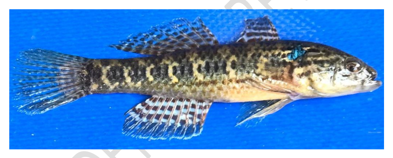
Fig.1. Individual of Dormitator lebretonis captured in Lake Nokoué

Sampling of Dormitator lebretonis : Live individuals of D. lebretonis (Fig.1) were collected at Lake Nokoué in Ganvié village located between 6°28'30.74" N and 2°23'22.3 "E. Samplings were made in aquatic vegetation/swamps and in open water using a seine (80 cm x 71 cm x 94 cm). Once caught, they were hold in oxygenated plastic packages (1 m x 42 cm) containing water from sampling site. Packaged fish samples were then transported to the experimental site of AFRICA PRO FISH located at Ouidah town where rearing disposal was set.