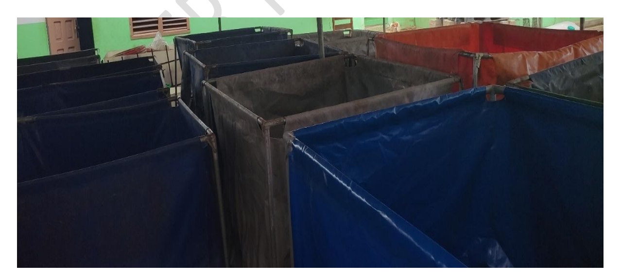
Fig. 2. Water tanks used for the experimentation.

Follow-up of water quality: Physico-chemical parameters such as dissolved oxygen (mg/l), temperature (°C) and pH were measured twice a day to the nearest 0.1 mg/l, 0.1°C and 0.1, respectively using the HANNA Multi-parameter (HI9829). Salinity was measured with a refract meter to the nearest 1‰. Also, ammonia (mg/l), nitrite (mg/l) and nitrate (mg/l) were measured twice a week with an Ammonia/nitrite and nitrate test Kit (SERA Test kit).