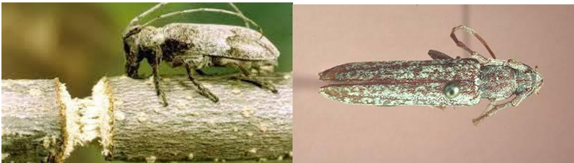
Fig 18 Persimmon clearwing borer ( Sanninauroceriformis Walker)

oviposition, which may eventually fall to the ground. The beetle may spread the wilt illness Cephalosporiumdiodospori in this way. Twigs that are infested need to be collected and removed[51].