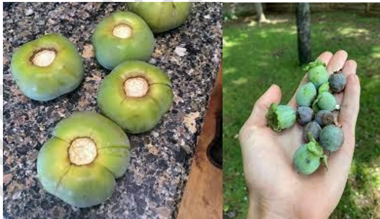
Fig .9 Kaki fruit

Kaki fruit physiological decline is divided into two groups: early drop, which happens from anthesis to early July, and late drop, which happens from mid-August to September. In the first drop, there are two waves. The most serious harm is caused by the first drop-wave, which happens between 10 and 20 days after anthesis. Early in July, the second drop-wave appears. Astringent persimmons experience the late drop more severely than sweet persimmons, notably in Hachiya, Hiratanenashi, and Yokono. In warm areas with little day-to-night temperature variation, the late drop also gets worse[41].