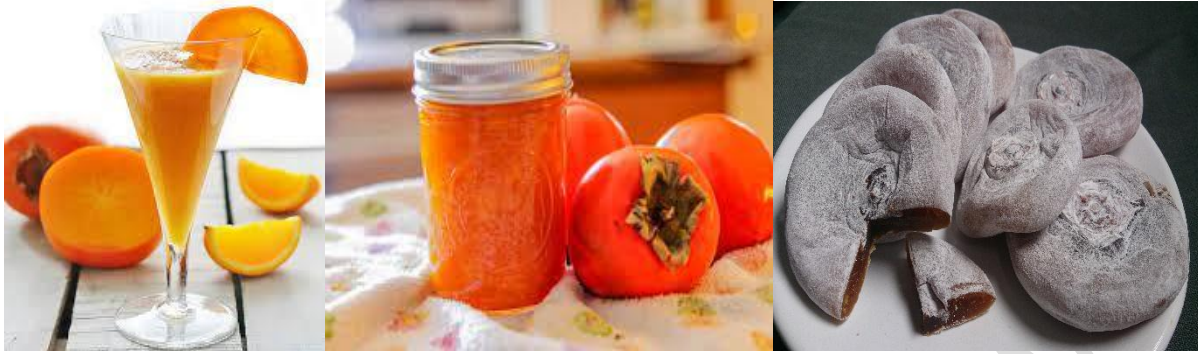
Fig 19 Flowering, Fruiting and Yield