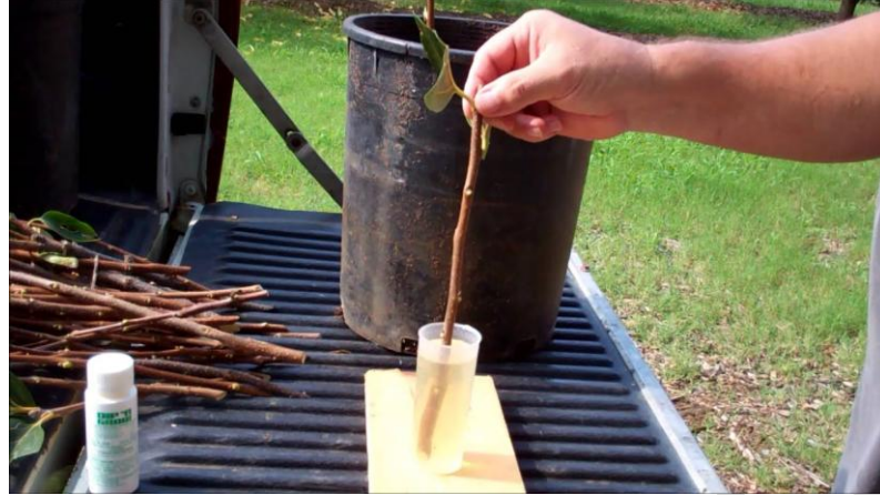
Fig. 4 Stem cutting method