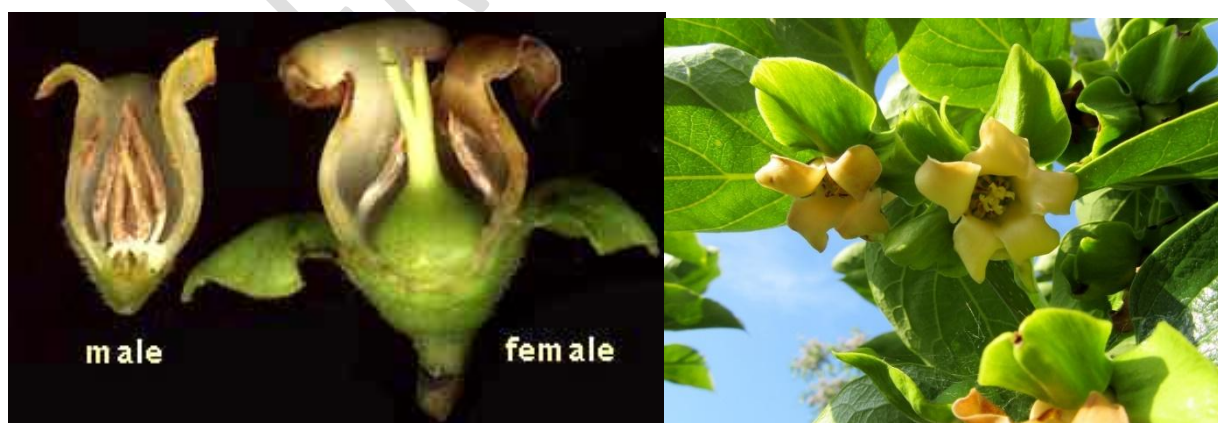
Fig .8 Orchard Floor Management

Kaki buds are compound buds that extend basal laterals on bearing branches as well as new shoots. The shoot apex of a flowering bud enlarges and flattens into a dome-shaped structure. Depending on the species and local customs, this takes place from mid-July to August. C/N ratio, level of training, moisture in the soil, amount of light, and length of sunshine are all factors that affect flower bud differentiation. In comparison to other deciduous fruit trees, the development of flowers in kaki trees is slower after flower bud differentiation. The petal primordia develop and grow in size by the middle of March the following year. Early in April, the anther stamens develop, followed immediately by the pistil[37].