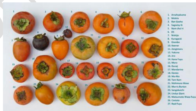
Fig. 3 Leading cultivar of D. virginiana