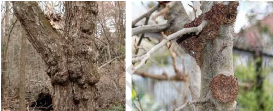
Fig. 10Crown gall disease

Disease signs observed around the crown, huge galls (swellings) form, and the bigger roots grow smaller marble-sized galls. Plants get infected by bacteria through wounds in the soil. The plant will turn yellow, grow stunted, and sickly if the condition worsens. Infected crop debris and the soil both harbor bacterial life. Warm temperatures and high humidity encourage the growth of illness.