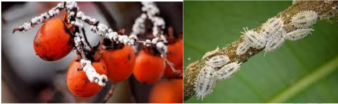
Fig 16 Pest Management