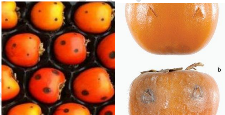
Fig 15 Post harvest fruit rot disease

The fruit calyx (stem-end) was the principal site for the disease's irregular brownish, soft lesions, which spread quickly at room temperature before turning dark brown or black and forming obvious, and occasionally numerous, white to grey mycelium. spreading through fruit that is infected. Fruits are subject to chilling harm, temperature changes, and long-term storage[47].