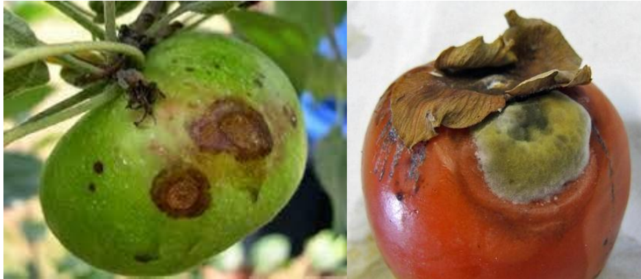
Fig 14 Bitter rot disease

Spot also appears on the surface of fruit and foliage. Additionally, it may cause the early loss of leaves and fruits. It could spread via infected areas. Continual rain, temperatures between 28 and 30 °C, and excessive humidity encourage the growth of disease.