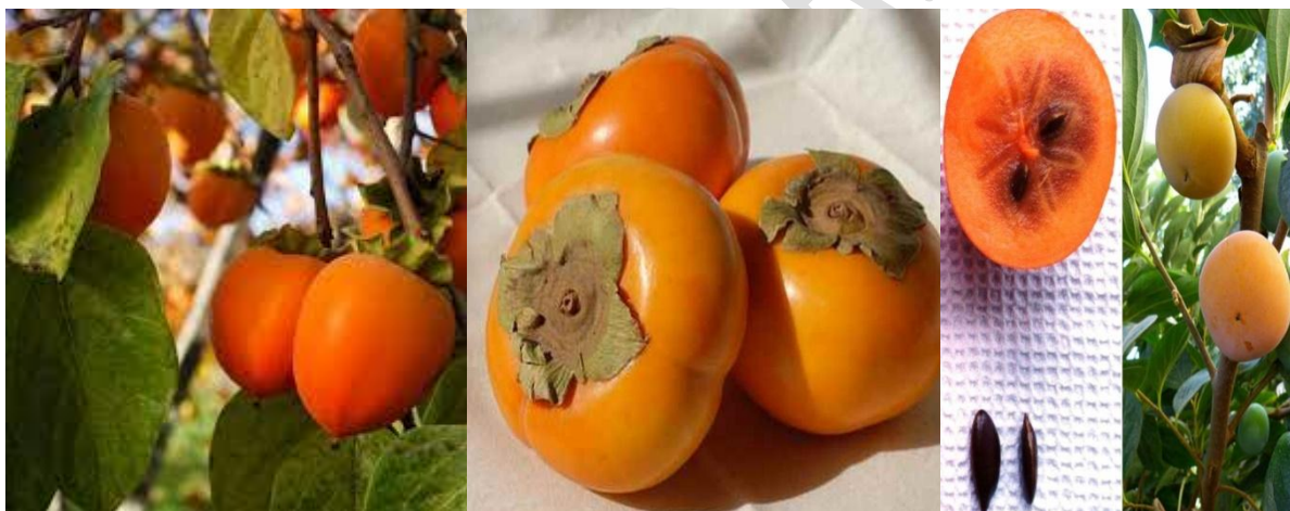
Fig 1. Morphology of fruits

Keywords: deciduous, health, nutritional, varietal, persimmon