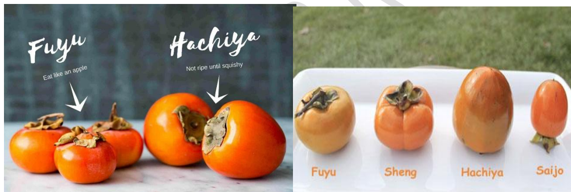
Fig.2 Plant Genetic Resource Management and Varieties

Persimmons can be divided into two groups: astringent and non-astringent. Sometimes, all astringent fruits are referred to as "Hachiya," whereas all non-astringent fruits are referred to as "Fuyu."