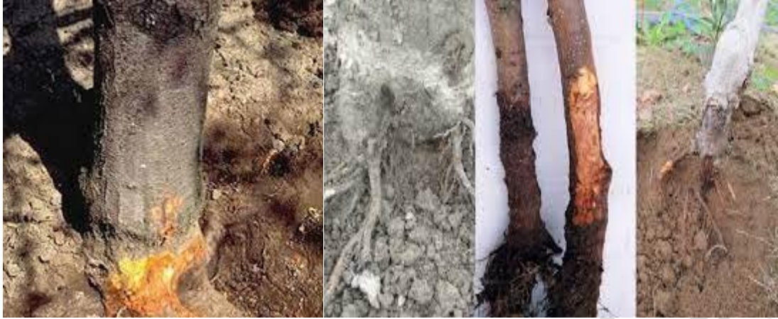
Fig. 11 Root rot disease