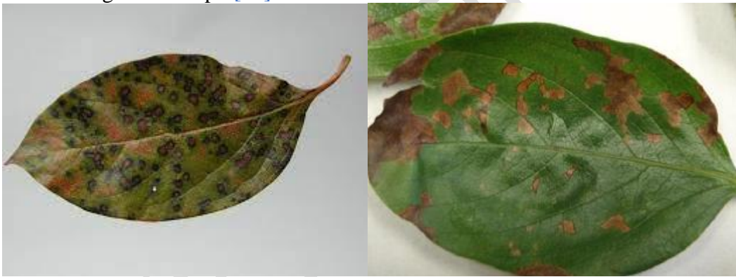
Fig.12 Cercospora leaf spot disease

On both leaf surfaces, there are tiny dark brown dots. The dots are constrained by the veins and take on an angular shape as a result. severely impacted leaves readily fall. The injured plant sections may allow the disease to spread. At temperature of 25 °C and a relative humidity of about 70% favours growth of spot [45].