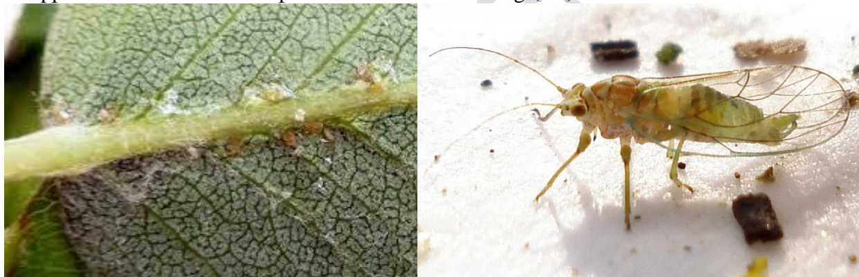
Fig 17 Persimmon psylla ( Triozadiospyri )

The main pest of leaves is the persimmon psylla, which attacks freshly emerging leaves in the spring. Crinkled and deformed leaves indicate an infestation. Control is challenging since the black-bodied adults and white-powder-covered nymphs are found eating inside the deformed leaves. Psylla infestations prevent young trees' shoots from growing normally. It is best to timing the application of conventional pesticides to the bloom stage[49].