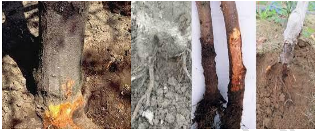
Fig. 11 Root rot disease Cercospora leaf spot =

On both leaf surfaces, there are tiny dark brown dots. The dots are constrained by the veins and take on an angular shape as a result. severely impacted leaves readily fall. The injured plant sections may allow the disease to spread. At temperature of 25 °C and a relative humidity of about 70% favours growth of spot[45].