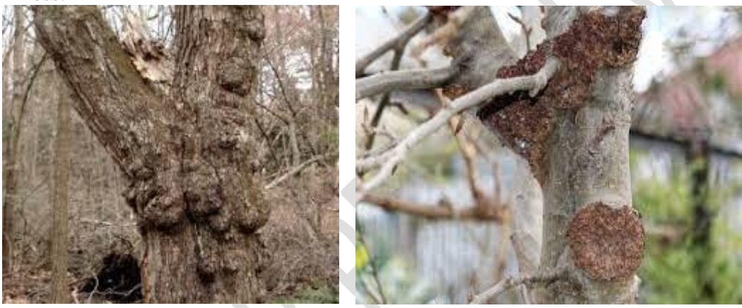
Fig. 10Crown gall disease Root rot =

Disease signs observed around the crown, huge galls (swellings) form, and the bigger roots grow smaller marble-sized galls. Plants get infected by bacteria through wounds in the soil. The plant will turn yellow, grow stunted, and sickly if the condition worsens. Infected crop debris and the soil both harbor bacterial life. Warm temperatures and high humidity encourage the growth of illness.