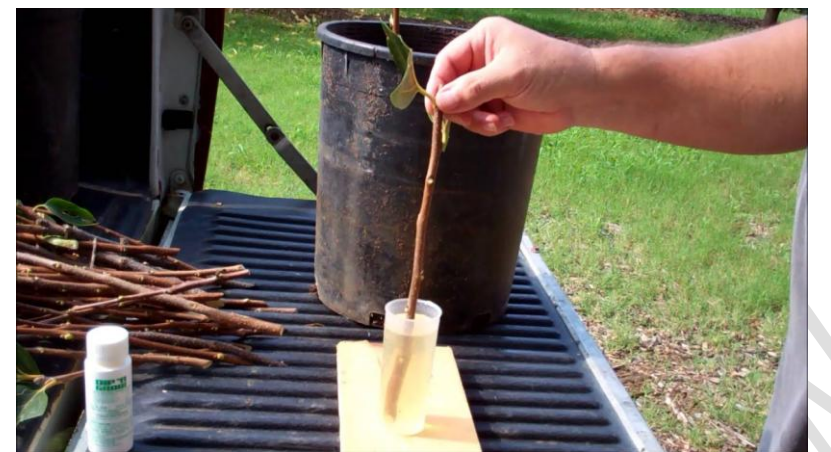
Fig. 4Stem cutting method