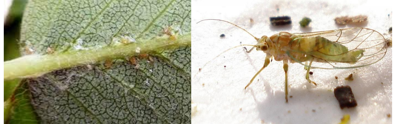
Fig 17Persimmon psylla (Triozadiospyri)

The main pest of leaves is the persimmon psylla, which attacks freshly emerging leaves in the spring. Crinkled and deformed leaves indicate an infestation. Control is challenging since the black-bodied adults and white-powder-covered nymphs are found eating inside the deformed leaves. Psylla infestations prevent young trees' shoots from growing normally. It is best to timing the application of conventional pesticides to the bloom stage[49].