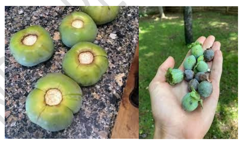
Fig .9 Kaki fruit

Kaki fruit physiological decline is divided into two groups: early drop, which happens from anthesis to early July, and late drop, which happens from mid-August to September. In the first drop, there are two waves. The most serious harm is caused by the first drop-wave, which happens between 10 and 20 days after anthesis. Early in July, the second drop-wave appears. Astringent persimmons experience the late drop more severely than sweet persimmons, notably in Hachiya, Hiratanenashi, and Yokono. In warm areas with little day-to-night temperature variation, the late drop also gets worse[41].