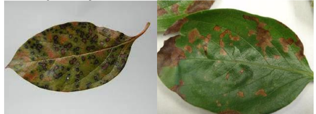
Fig.12 Cercospora leaf spot disease Circular leaf spot =

On both leaf surfaces, there are tiny dark brown dots. The dots are constrained by the veins and take on an angular shape as a result. severely impacted leaves readily fall. The injured plant sections may allow the disease to spread. At temperature of 25 °C and a relative humidity of about 70% favours growth of spot[45].