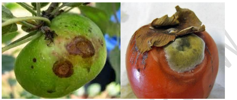
Fig 14 Bitter rot disease Post harvest fruit rot =

Spot also appears on the surface of fruit and foliage. Additionally, it may cause the early loss of leaves and fruits. It could spread via infected areas. Continual rain, temperatures between 28 and 30 °C, and excessive humidity encourage the growth of disease.