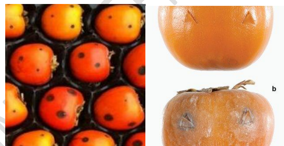
Fig 15 Post harvest fruit rot disease Pest Management

The fruit calyx (stem-end) was the principal site for the disease's irregular brownish, soft lesions, which spread quickly at room temperature before turning dark brown or black and forming obvious, and occasionally numerous, white to grey mycelium. spreading through fruit that is infected. Fruits are subject to chilling harm, temperature changes, and long-term storage[47].