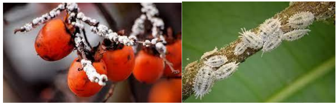
Fig 16Pest Management