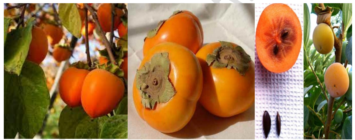
Fig 1. Morphology of fruits

Keywords: deciduous, health, nutritional, varietal, persimmon