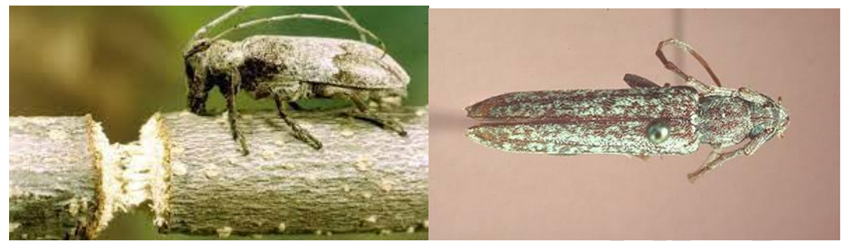
Fig 18Persimmon clearwing borer (Sanninauroceriformis Walker)

oviposition, which may eventually fall to the ground. The beetle may spread the wilt illness Cephalosporiumdiospyri in this way. Twigs that are infested need to be collected and removed[51].