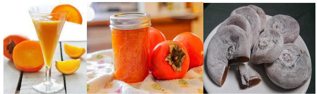
Fig 19Flowering, Fruiting and Yield