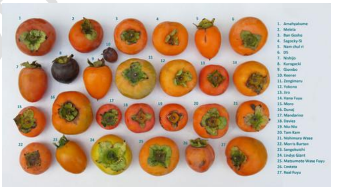
Fig. 3Leading cultivar of D. virginiana