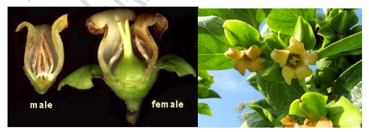
Fig .8 Orchard Floor Management

Kaki buds are compound buds that extend basal laterals on bearing branches as well as new shoots. The shoot apex of a flowering bud enlarges and flattens into a dome-shaped structure. Depending on the species and local customs, this takes place from mid-July to August. C/N ratio, level of training, moisture in the soil, amount of light, and length of sunshine are all factors that affect flower bud differentiation. In comparison to other deciduous fruit trees, the development of flowers in kaki trees is slower after flower bud differentiation. The petal primordia develop and grow in size by the middle of March the following year. Early in April, the anther stamens develop, followed immediately by the pistil[37].