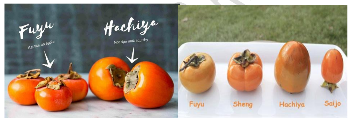
Fig.2 Plant Genetic Resource Management and Varieties

Persimmons can be divided into two groups: astringent and non-astringent. Sometimes, all astringent fruits are referred to as "Hachiya," whereas all non-astringent fruits are referred to as "Fuyu."