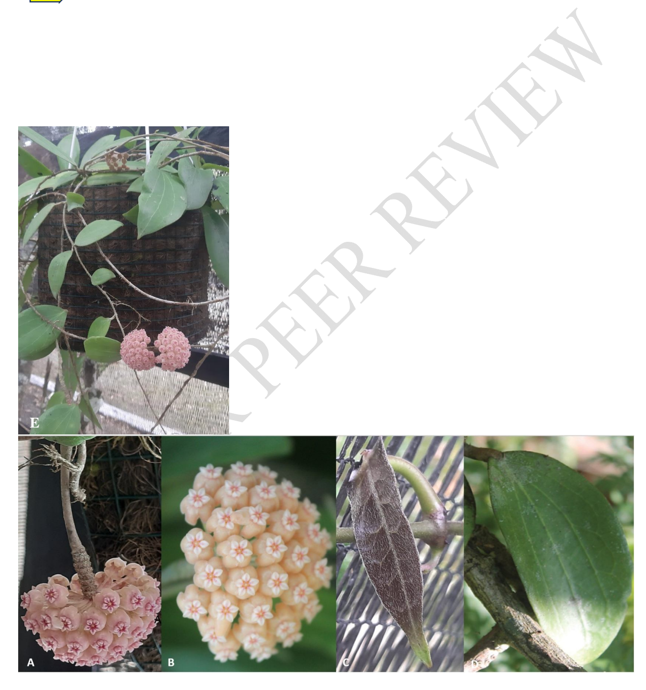
Figure 3. Inflorescence and leaves of Hoya pachyphylla from Ubiyau Village, West Papua (A)