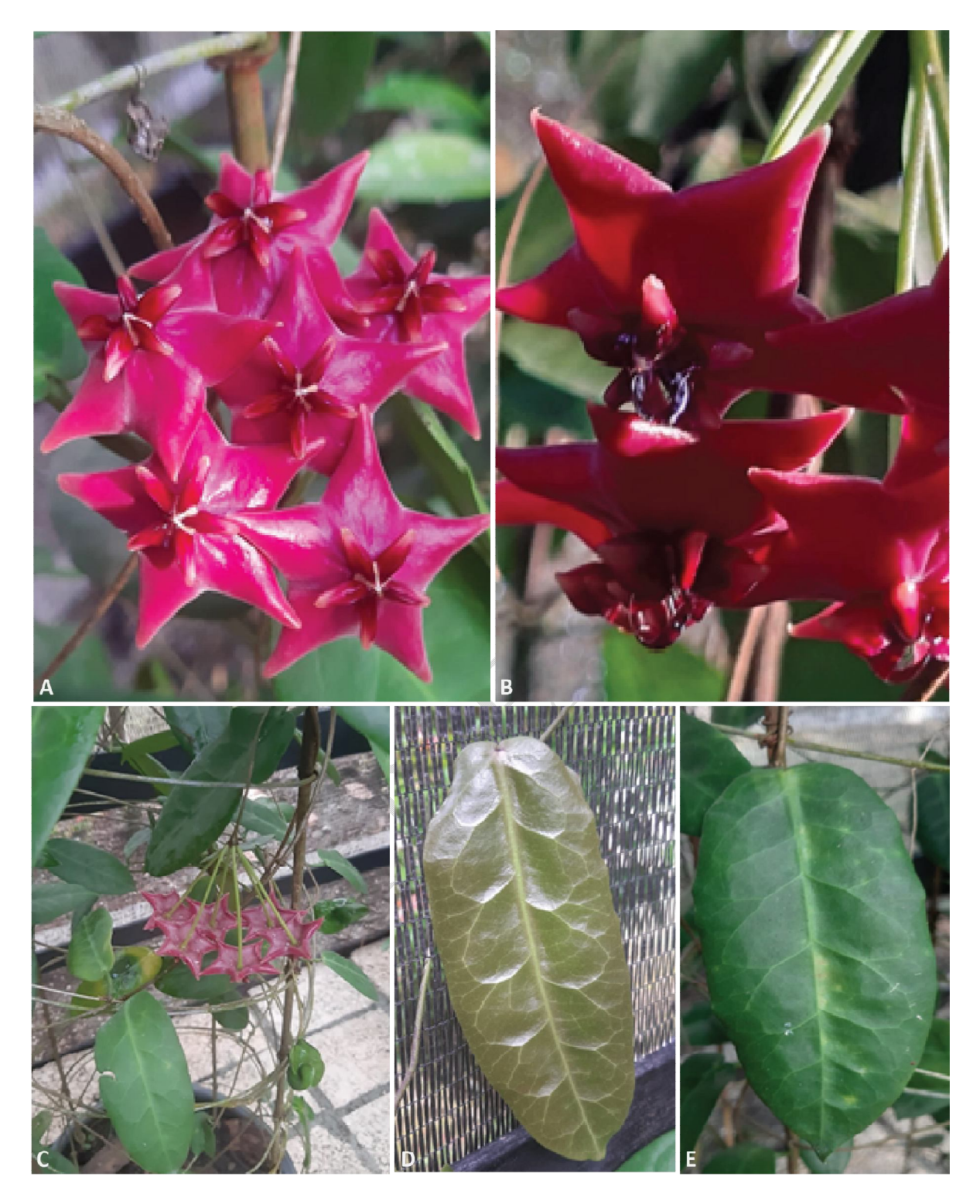
Figure 2. Hoya megalaster collected from Ubiyau forest, West Papua (A) The inflorescence (B)The release of nectar from the flowers in the morning (C) Leaf pairs and inflorescence(D) young leaf (E) mature leaf