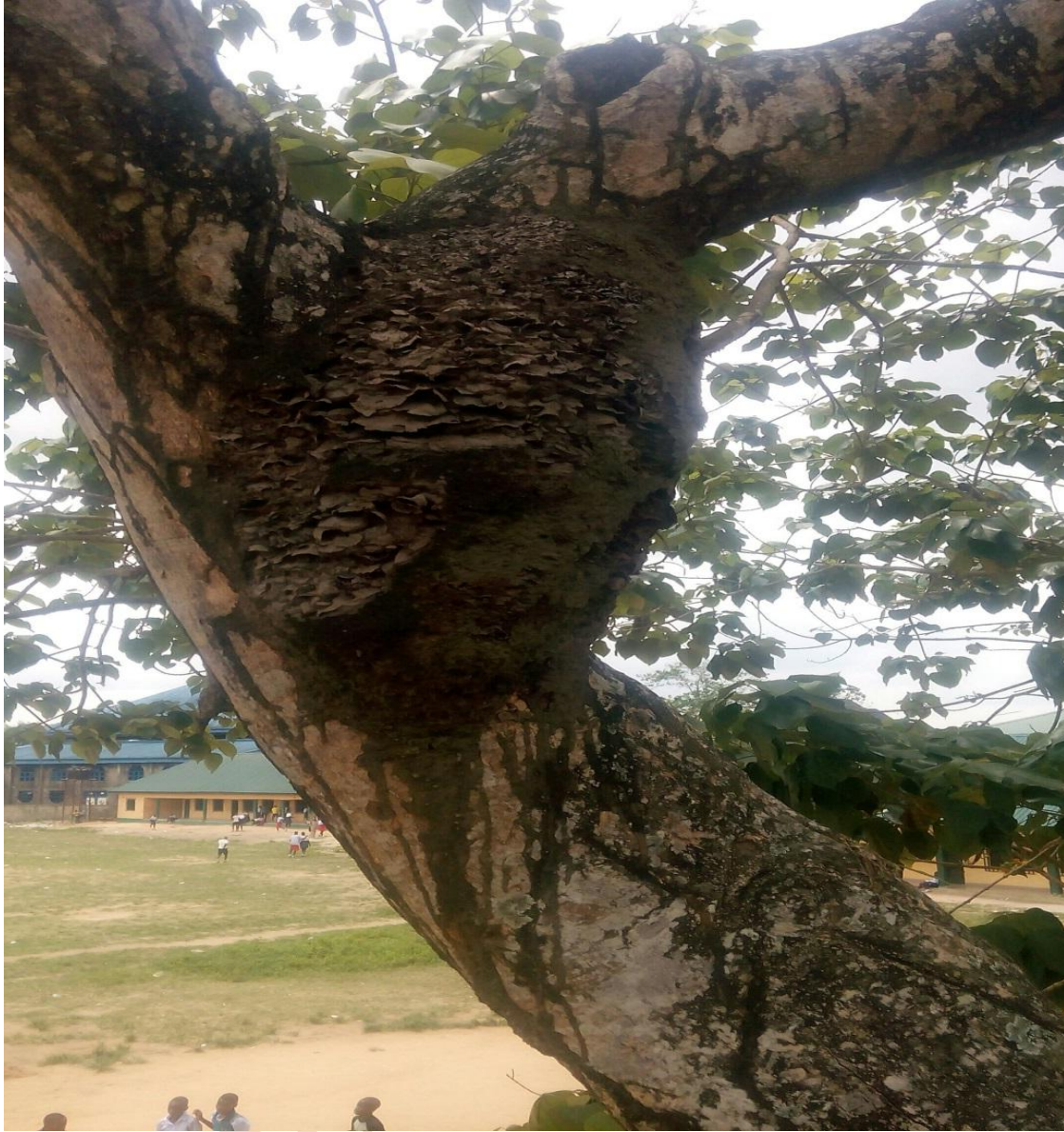
Fig:4 Gmelina arborea (tree) with Microcerotermes annandalei nest