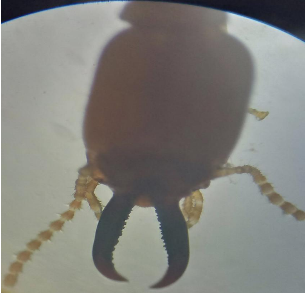
Fig 2. Head of soldier of Microcerotermes paracelebensis