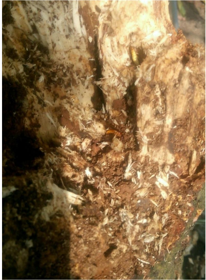
Fig 3 Persea americana showing Schedorhinotermes medioobscurus infestation using hollow sound of the tree