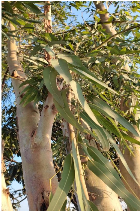
Fig 1: Eucalyptus tree

for the product which are derived from the plants their uses in therapeutic have been escalate . In various countries, especially in the rural state as a foremost fitness care aromatic herb is being on the other side 80% of community in the underdeveloped nations this tree is used as the conventional assests. In Indian tradition all the plant are considered to have some medical properties in it and the medicine is apply as the vital source of antitodesince the classical times. Eucalyptus was used as a various purpose such as food and antiode, presently eucalyptus plant is commonly used in forest management such as fuel, paper pulp, timber. It is also used in environmentalgadeningsuch as the control of thewind erosion, water control as amajorstarting point of the essential oil which is pull out from the various parts such as perfumery oils and medicinal, for fine arts. Environmentalist and researchers pay their attention on eucalyptus becauseof the good source of wood and essential oil which is used for the various objective. The lubricant which iswithdraw from various parts such as bud, bark, leaves and fruit, they all are showed the pharmalogicalactivies namely anti-viral, anti-inflammatory ,anti-oxidant, anti-fungal, anti- cancerous activitiesand due to these it is used to cure the respiratory disease such as common cold influenzas etc. (Gabriella et al., 2016).