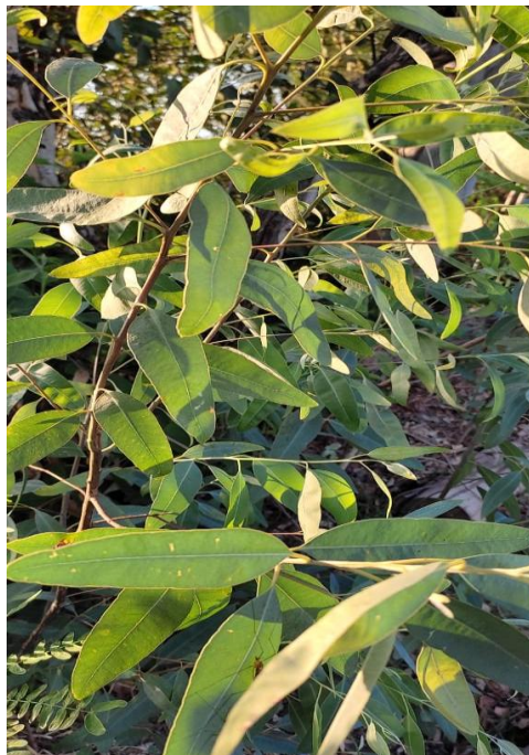
Fig 2: Leaves

Most of the species of eucalyptus is evergreen but at the end of the dry season there are some species who lose their leaves. Therefore, the mature one is usually are very tall and fully leafed the shade of their leaves are somewhere patchy because they hang towards the ground. On the mature eucalyptus tree, the leaves are often lanceolate, petiolate, waxy or glossy green and apparently alternate. As opposed to the seedling on the leaves is usually glaucous and opposite sessile but we can see many inconsistency in their figure.