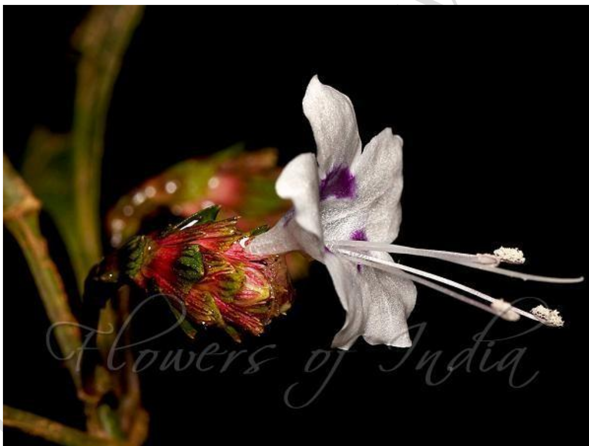
Fig. 1. Morphology of Strobilanthes ciliata Nees.(Acanthaceae)

Terpenoids, flavonoids, carbohydrates, phytosterols, and tannins are main phytochemicals present in S. ciliata Nees. Phytoconstituents such as flavonoids, flavanols, lipids, and tannins were quantified in S. ciliata Nees. Major constituent found in this species is lupeol which exhibit broad spectrum of biological activity like antitumor, antiprotozoal, antimalarial, and anti-inflammatory. [6]