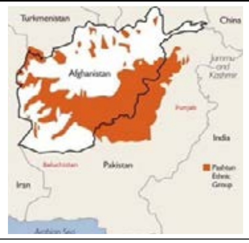
Source: The Heritage Foundation, 2010 (Terms Punjab and Baluchistan added by the researcher)

Some Afghans perceive Pakistan as a safer place for trade, as opposed to Afghanistan, and several other countries. For instance, an interviewed Pashtun Afghan started his business in 1983 in Quetta. He then moved to Islamabad in 1987. Later, he made a break and shifted to Dubai in 1990, where he established his carpet business which flourished. In the year 2000, he moved to Karachi. Post 9/11, tensions in Karachi pushed him to move to Islamabad, where he has been since. His decision to shift from Dubai to Pakistan was the feeling of being unhappy and restricted in dealings with "Arabs":