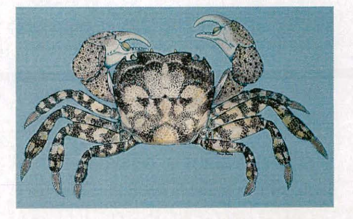
Asian shore crab Hemigrapsus sanguineus. Watercolor painting: Elizabeth J. Perry

_ Resale or republication not permitted without _ written consent of the publisher