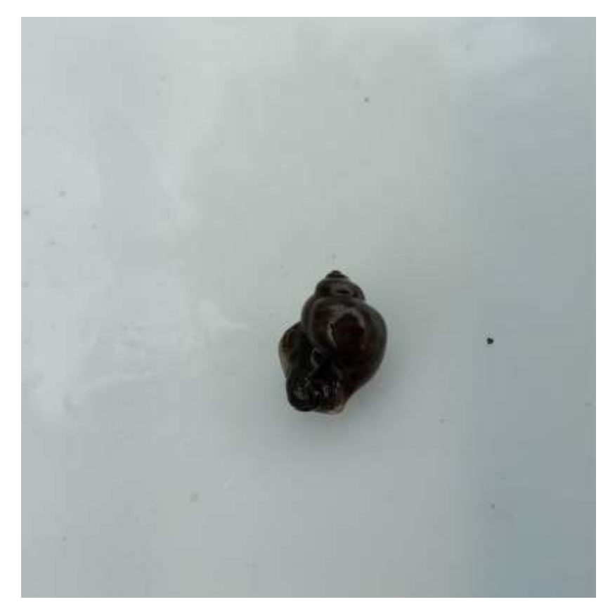
Figure 5: Bulinus truncatus