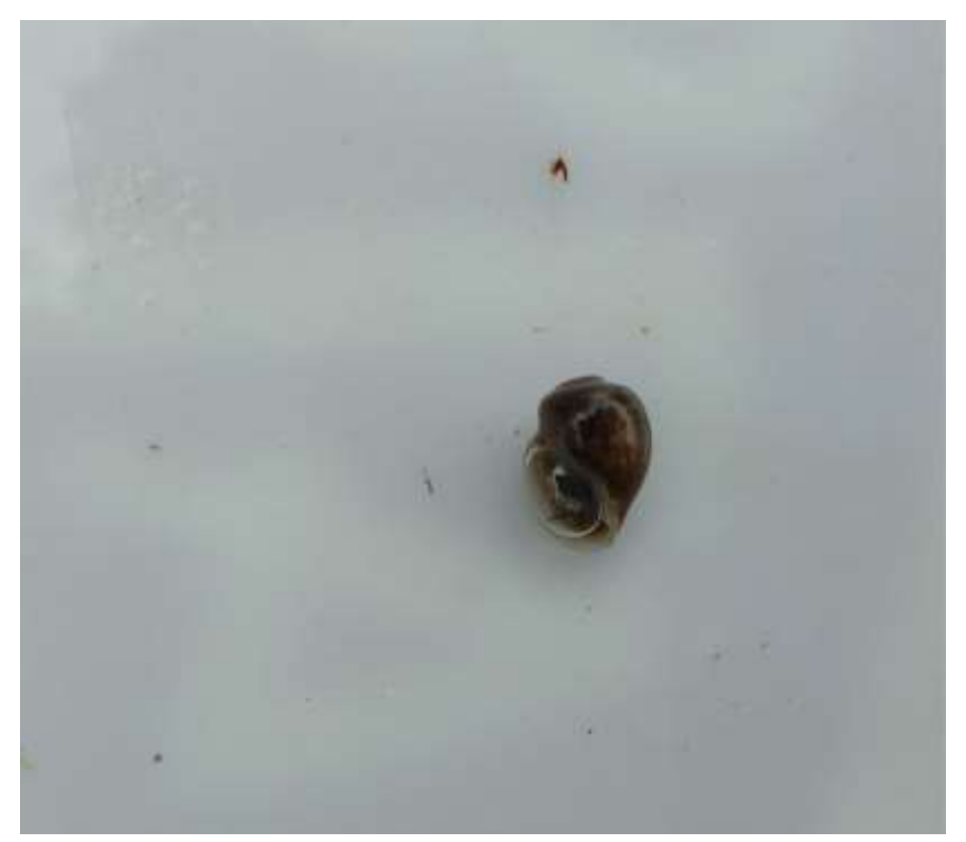
Figure 7: Bulinus obtusus