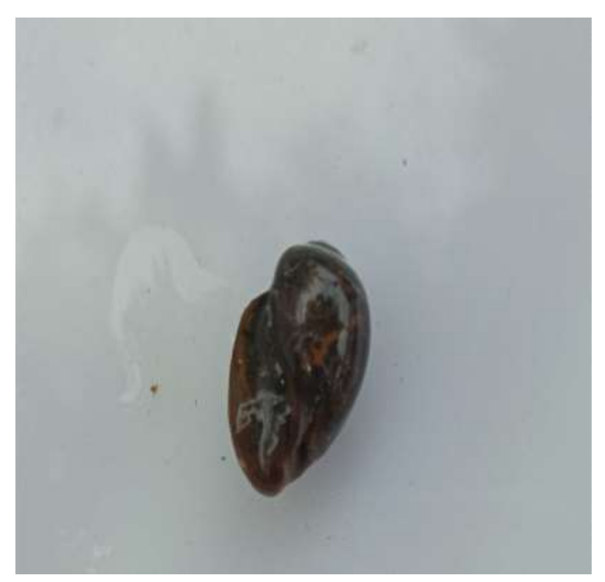
Figure 4: Bulinus truncatus