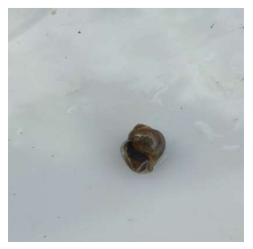
Figure 8: Bulinus permembranaceus