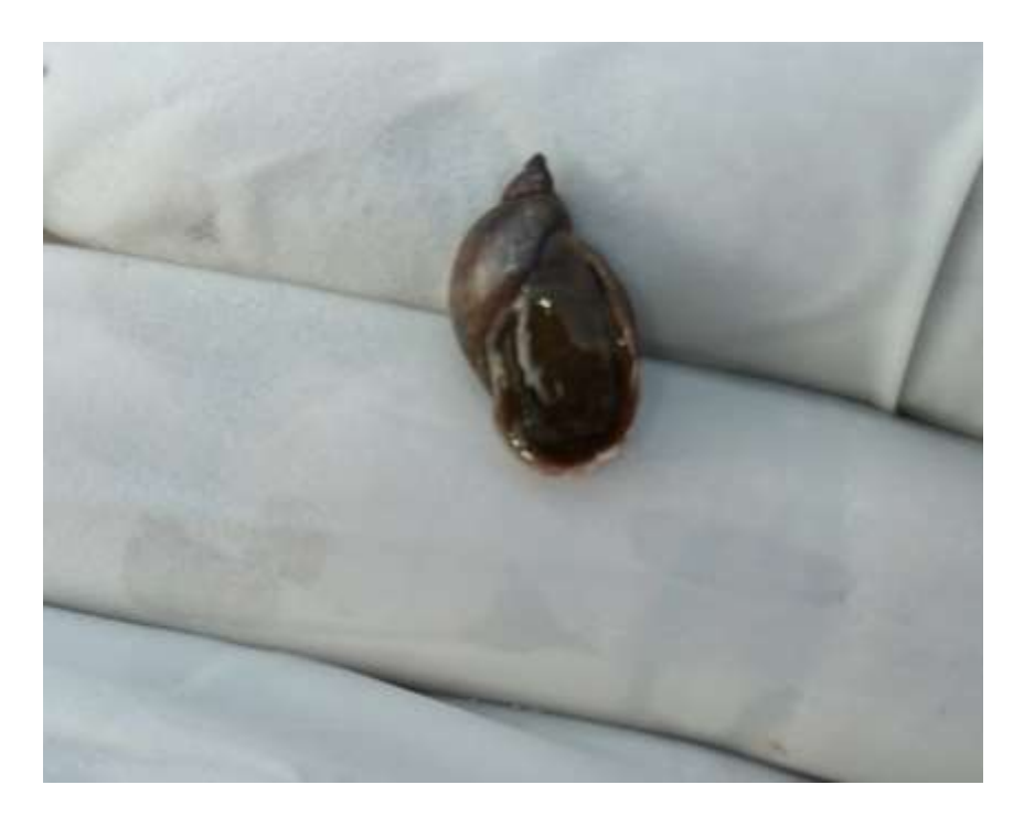
Figure 2: Lymnaea natalensis