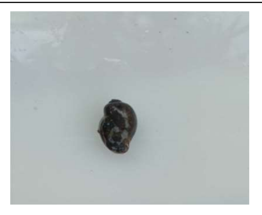
Figure 6: Bulinus truncatus