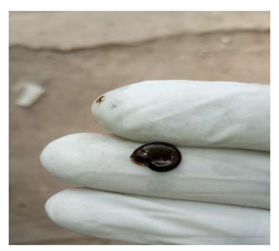
Figure 9: Biomphalaria pfeifferi