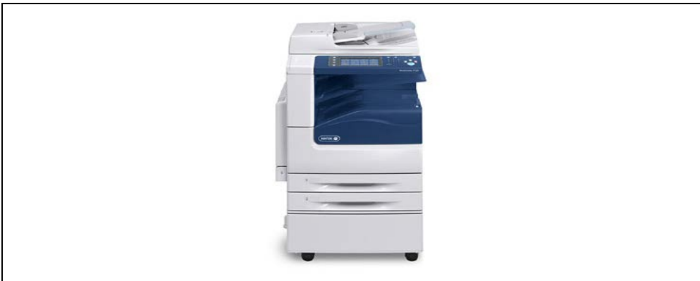
Figure 1: WorkCentre® 7220/7225 Xerox® ConnectKey® Technology with SIPRNet Support

The TOE can integrate with an IPv4 network with native support for DHCP. The hardware included in the TOE is shown in the figure below.