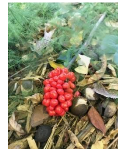
Jack in the Pulpit seeds

By late summer, the spathe and spadex have melted away, revealing a cluster of bright red berries in the female that are cherished by turkeys, wood thrushes and other birds.