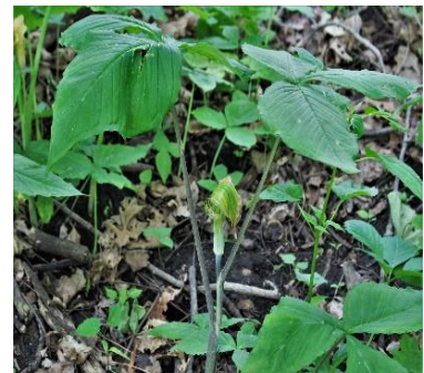
Female plant - 2 petioles, each with a trifoliate leaf on top.

It takes significantly more energy for a plant to produce seeds, so if a season is tough, a small corm is produced, and a male will re-emerge next season. If