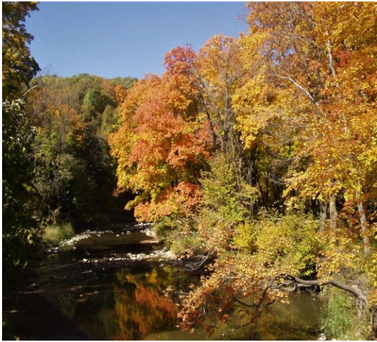
Redwood River at Camden in the fall.