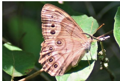
Northern Pearly-eye Butterfly - note clubbed antennae, upright wing posture at rest