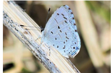
Spring Azure Butterfly - note clubbed antennae, upright folded wings.