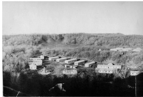
VCC camp at Camden during park construction in 1935.

In 1935, the MN legislature formally created the Division of State Parks and the idea of providing parks within 40 miles of each state resident was hatched, so the quest to find areas to fit this bill really gathered steam. The site of Camden State Park had been used over many centuries, and not surprisingly, was chosen by Native Americans as a place to live because of the ready source of water, wood and food. Perhaps most importantly, in this valley of the Redwood River, they were protected from the winter winds. The settlement of Camden had a short life in the late 1800s and died out largely due to the decisions of where to locate railroad lines and facilities. Ironically, there is still a heavily used railroad line going through the park.