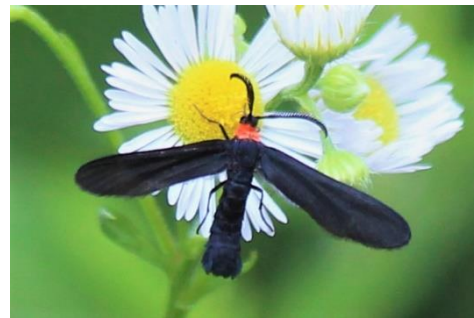
Grapevine Skeletonizer Moth male -feathery antenna