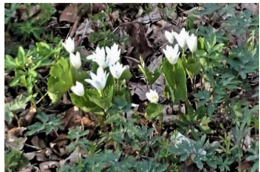
Bloodroot surrounded by Virginia Waterleaf. Cannon River Wilderness Park.