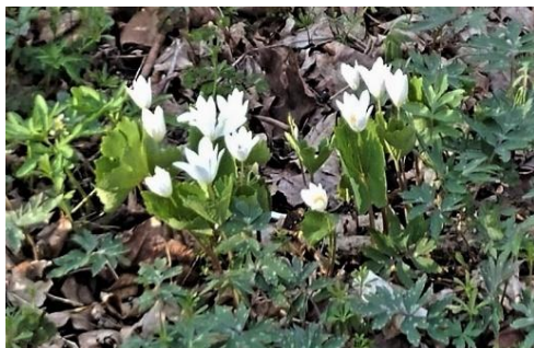
Bloodroot surrounded by Virginia Waterleaf at Cannon River Valley Park.