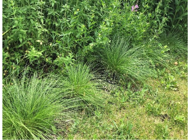
Prairie Dropseed ( Sporobolus heterolepis ) as a border in a garden.