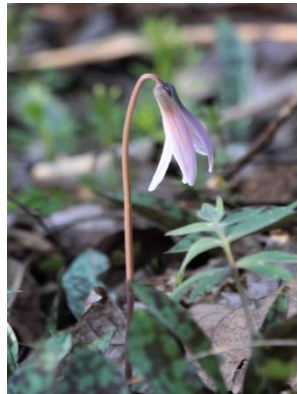
Trout Lily in bloom. Cannon River Wilderness Park.