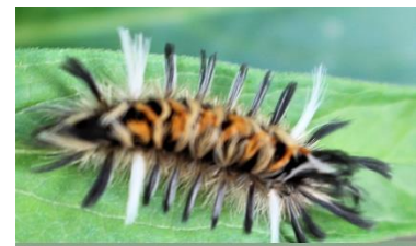
Tussock Moth Caterpillar - very hairy