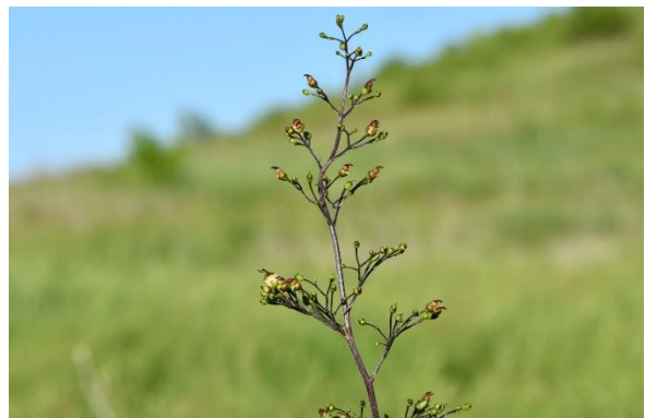
Early Figwort ( Scrophularia lanceolata ) in bloom in the Koester Prairie. Not the showiest of plants, but is a big draw for bees, butterflies, and hummingbirds!