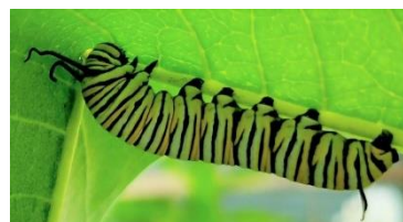
Monarch Caterpillar - hairless -by Sue White