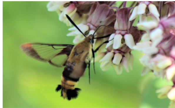
Hummingbird Clearwing Moth female - chubby body, no antenna clubs or feathering