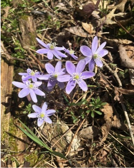
Sharp-lobed Hepatica at Cannon River Wilderness Park.