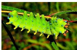
Cecropia moth caterpillar

I grew up in a small south-central town on the Minnesota River. We lived on the edge of town where I roamed free from an early age, exploring and observing. There, at the age of 8, my life changed. I spotted a fully grown Cecropia caterpillar crawling up our stucco house. I was hooked. It was unlike anything I had ever seen. I started researching it and became more and more excited about nature. I started a nature club with a friend where we studied trees, wildflowers, birds, insects, mammals, rocks, reptiles and amphibians. For the next three years we had a neighborhood nature exhibit where we would show the things we had collected with some information. It was a wonderful time. Because of my interest in the natural world, I got a B.S. in Biology.