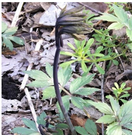
Blue Cohosh unfurling. Cannon River Wilderness Park. By Norma Gilbertson.