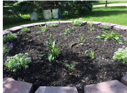
One of Jean Novotny's circle gardens from the Member-sponsored Native Garden grant program

We have accepted three applications thus far for the 2022 Member-sponsored Native Gardens. The goal of these gardens is to have more people use native plants in their landscapes. We offer a