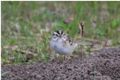
Clay-colored Sparrow, common in the Koester Prairie.