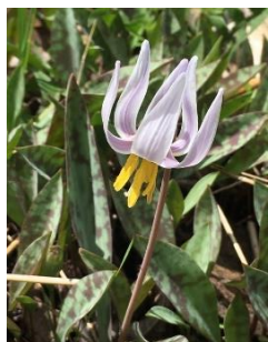
Trout Lily.