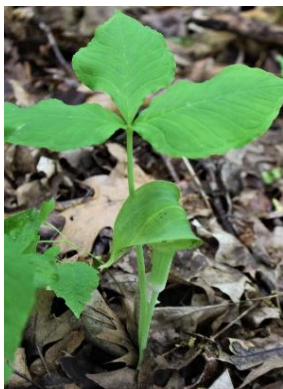
Male Jack-in-the Pulpit - 1 leaf with 3 leaflets

The first few years, most Jack-in-the-Pulpits are male. Later, if growth conditions are good, the plant may be a female. Conversely, if conditions are not