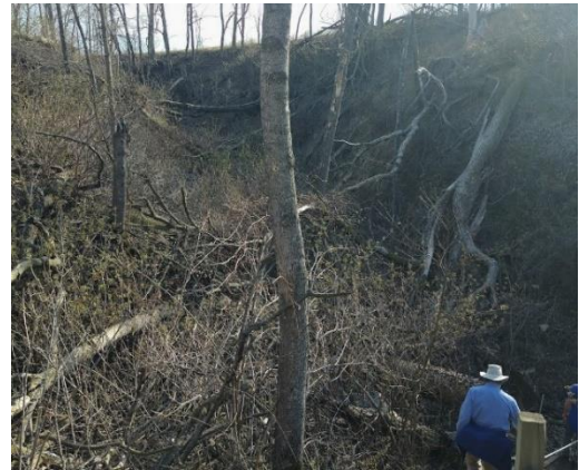
2018 Storm damage at Cannon River Wilderness Park.