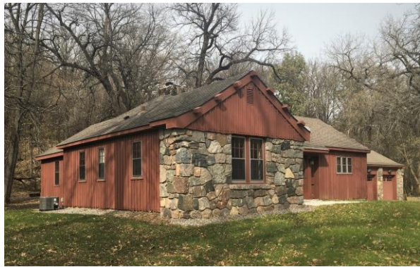
Former park manager residence now serves as a lodge for visitors.