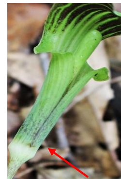
Male flower with exit hole for fungus gnats

tiny hole at the base where gnats can get out. Once free, they get attracted to the musty scent of another flower, and having gnat brains, dive in only to find themselves trapped again. If it is a female plant this time, the gnats actually pollinate her as they bounce around desperate to get out but unfortunately for them, they are now truly trapped – the females evolved with no escape hole so insects stay trapped and help assure pollination.