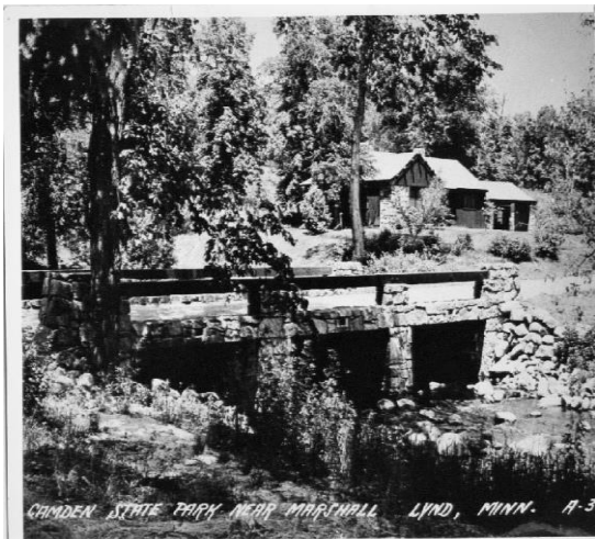
Historic picture of original Camden Park entrance and manager's residence.