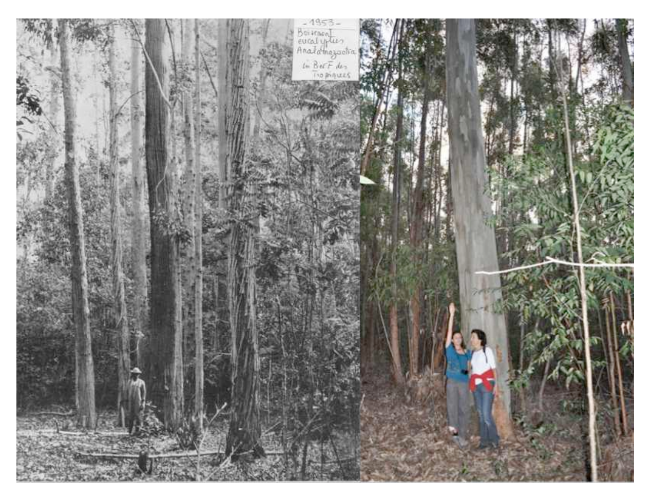
Fig. 2 Mature eucalyptus plantations at forest stations of Analamazaotra (in the 1950s) and Ialatsara (in 2010).