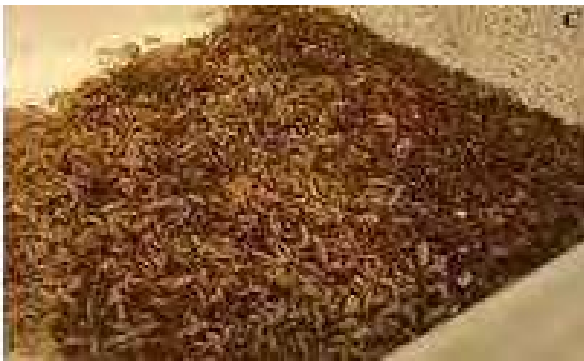
Fig. 1. Larvae of Hermetia illucens L. in action on agro-industrial biowastes.

The results pointed out 1) an increase varying between 13.3-16.5% of plant fresh weight in all compost treatments, 2) an enhancement of the root length, surface area and fine root length at 2 kg m -2 of compost rate and 3) the improvement of the root length was determined by an increase of the biomass allocation, 4) these morphological performances were sustained by higher levels of photosynthetic rates although an increase of water losses by higher transpiration rates was observed.