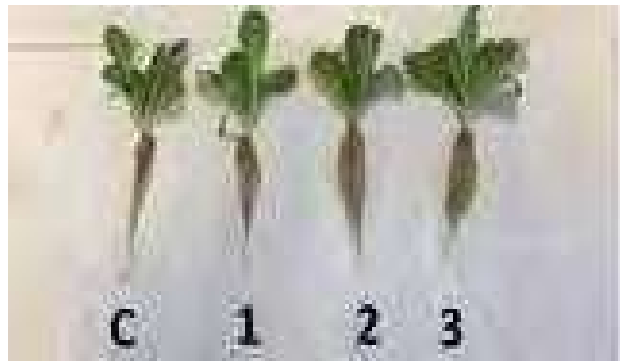
Fig. 2. Lettuce plants treated with 1, 2 and 3 kg m -2 of biocompost or not treated (C).

https://drive.google.com/file/d/1GQ8X4ao2xmJdx7NC5ZjiM1JJF89xe8of/view?usp=sharing