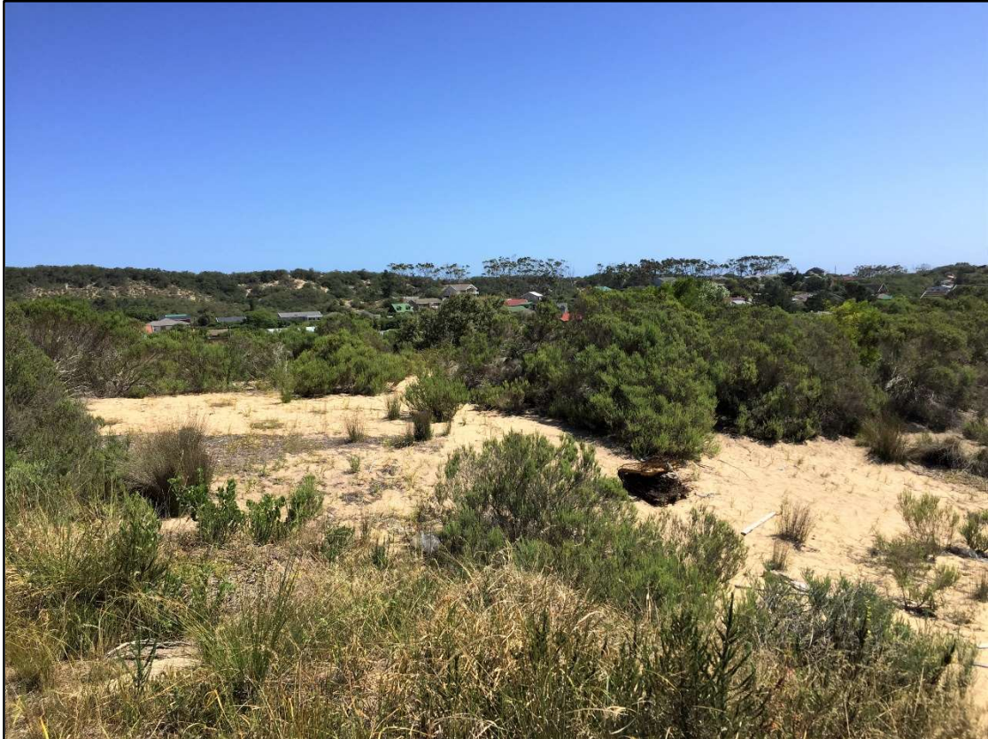
Photo 2 Exposed dune surface in the northern part of site.

Rainfall in the region ranges from 670 to 1 090 mm per annum (average = 852 mm) as per