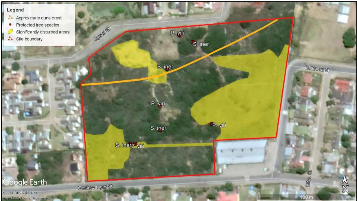
Map 4 Aerial photograph showing the biodiversity attributes of the site.