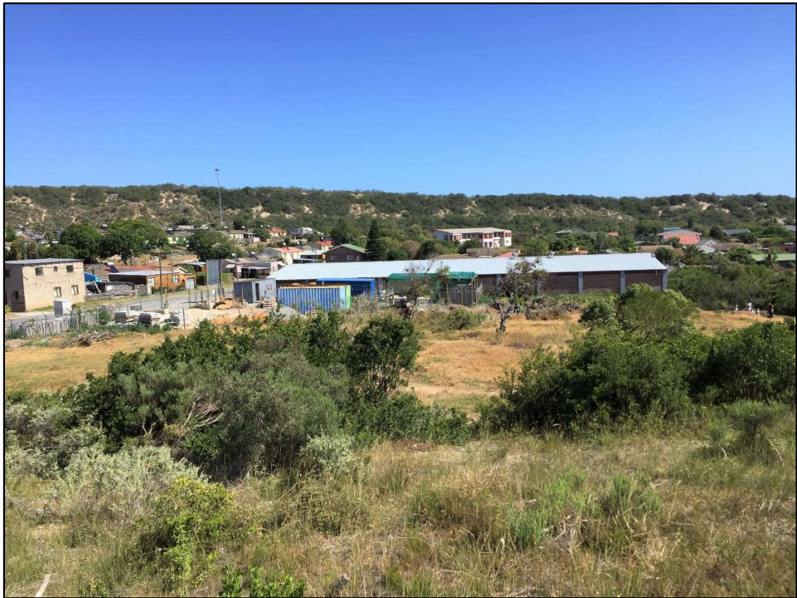
Photo 4 Disturbed area behind the commercial/retail centre.