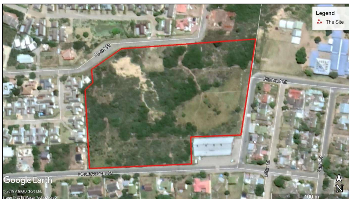
Map 2 Satellite photo showing the study site (outlined in red) in context with its surroundings.

The site (2.72 ha) is located in the eastern part of Sedgefield, on the boundary between Kingfisher Creek and Smutsville (see Map 2). The area is characterised by east-west orientated longitudinal dunes between Sedgefield Lagoon to the west and Groenvlei to the east (see Photo 1). It forms part of the so-called Garden Route Lakes District. Apart from a small dune cutting across the northern part of the site, it is relatively flat, sandy and covered with vegetation and grass (see Photo 2). It is bound by roads, residential areas and a small commercial/retail centre. The beach is located 1 km away to the south, and the lagoon 700 m away to the west. The coastal strip between Wilderness and Knysna is largely untransformed, with the presence of several protected areas, including the Garden Route National Park, Goukamma Nature Reserve and the Wilderness Lakes Ramsar Site.