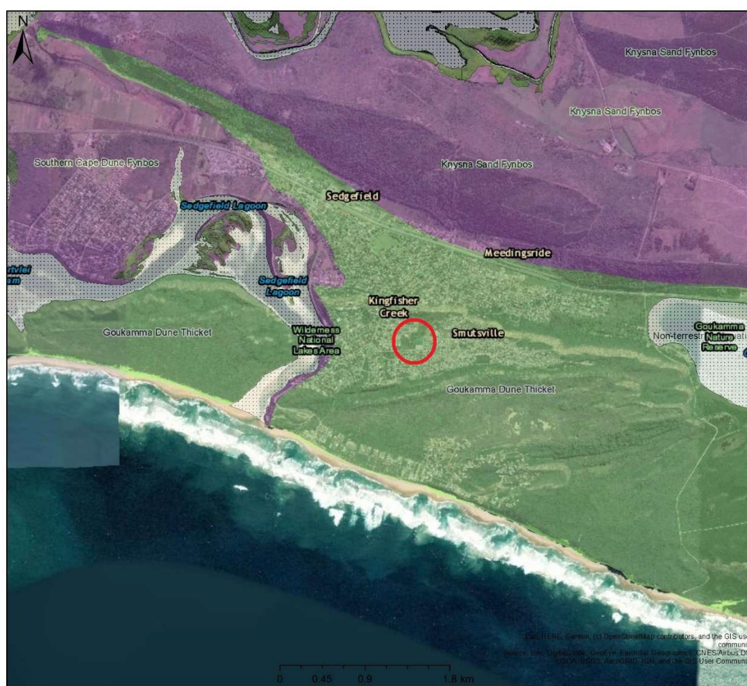
Map 3 Extract of the 2018 beta SA Vegetation Map, showing the position of the site (encircled in red) inside Goukamma Dune Thicket.

Being located in the Southern Cape (Garden Route area) in close proximity to the coast, the site occurs in a typical coastal fynbos/thicket environment. This is confirmed by the presence of mainly dune thicket species, such as Searsia laevigata , Maytenus procumbens , Pterocelastrus tricuspidatus and Olea exasperata . According to the 2012 South African Vegetation Map, the site and its surrounding area have been mapped as Southern Cape Dune Fynbos. The latter occurs in dune areas (usually associated with large estuaries) between Wilderness in the west and St Francis Bay in the east, with a few smaller patches further away towards Mossel Bay and East London (Mucina & Rutherford 2006).