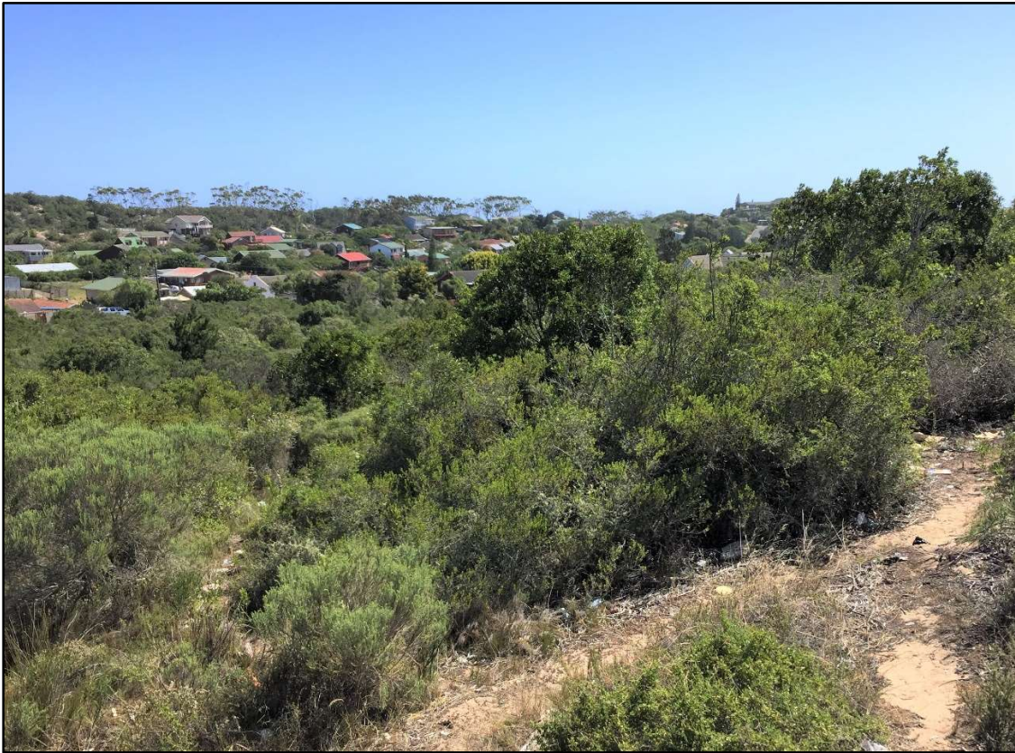
Photo 3 Dune thicket recorded on site.

Subsequently the dune vegetation south of the N2 has been re-mapped as Goukamma Dune Thicket (see Map 3 above). The latter stretches along the coast from Wilderness to Keurboomstrand. The vegetation is characterised by its often impenetrable thicket structure, dominated by sclerophyllous shrubs, such as Pterocelastrus tricuspidatus , Sideroxylon inerme and Tarchonanthus littoralis (see Photo 3). Typical fynbos species, such as ericas and proteas, are noticeably absent.