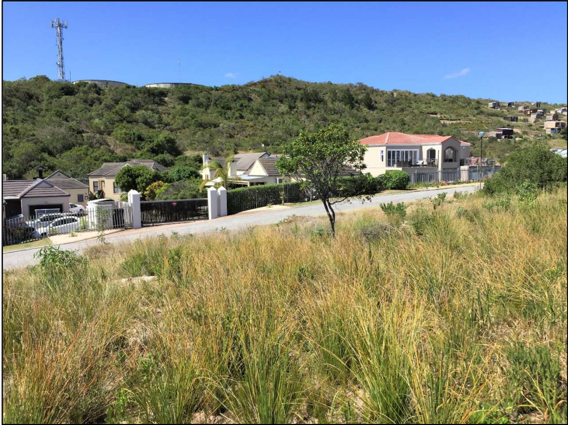
Photo 1 A section of the Sedgefield dune system behind the site to the north.