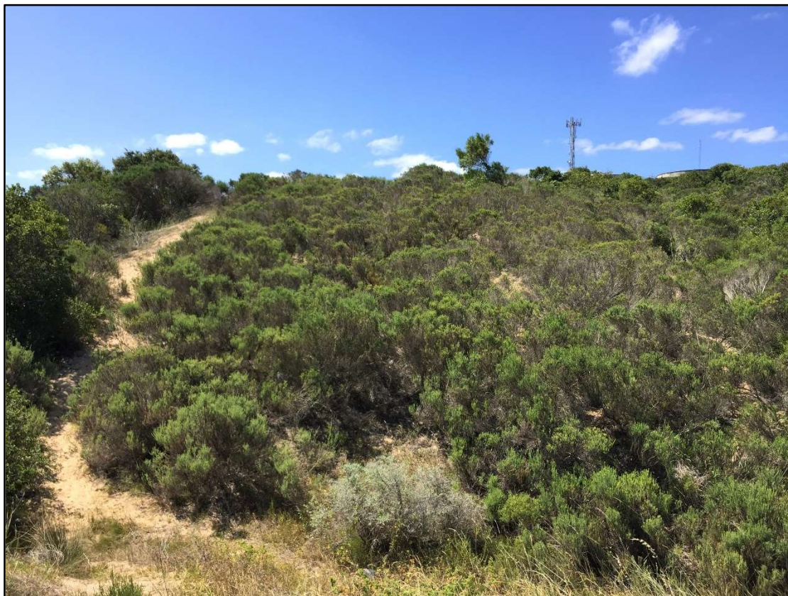
Photo 6 Metalasia cf. muricata dominated dune slope.

Biodiversity Act (Act 10 of 2004) Alien and Invasive Species List (2016), the harbouring of Ricinus communis (Category 2 invader) on a property requires a permit.