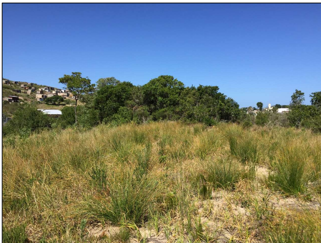
Photo 5 Rehabilitated dune surface.

Prominent indigenous tree and shrub species recorded include Metalasia cf. muricata (not in flower, see Photo 6), Helichrysum dasyanthum , H. teretifolium , H. cymosum , Osteospermum moniliferum , Felicia echinata , Tarchonanthus littoralis , Tetragonia fruticosa , Pelargonium capitatum , Grewia occidentalis , Carissa bispinosa , Passerina cf. montivaga , Anthospermum aethiopicum , Muraltia squarrosa (on top of dune), Salvia africana-lutea , Phyllica cf. axillaris , Olea exasperata , Searsia glauca , S. laevigata , S. crenata , Cussonia thyrsoflora , Colpoon compressum , Cassine peragua , Mystroxyton aethiopicum , Maytenus procumbens , M. oleoides , Apodytes dimidiata , Pittosporum viridiflorum , Sideroxylon inerme , Pterocelastrus tricuspidatus , Zanthoxylum capense , Asparagus aethiopicus and Agathosma apiculata . Several of these species are important Southern Cape Dune Fynbos species.