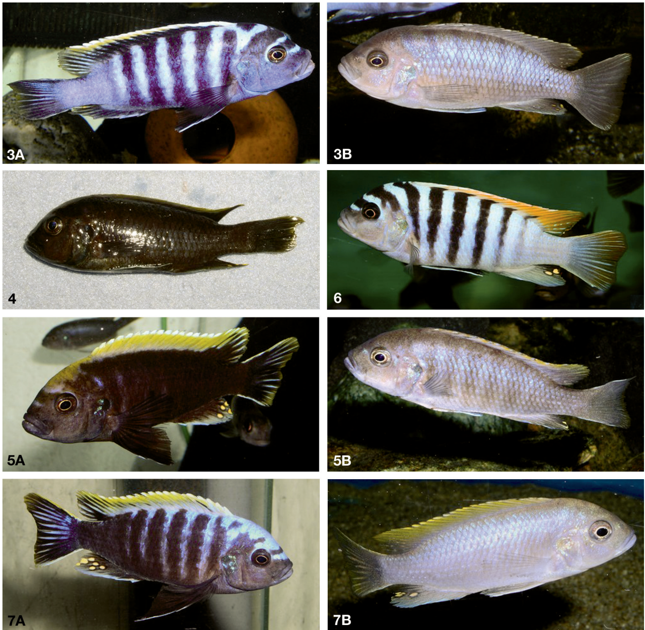
Figure 3. - Microchromis zebroides . A: Wild male; B: Female in aquarium (Likoma Island).