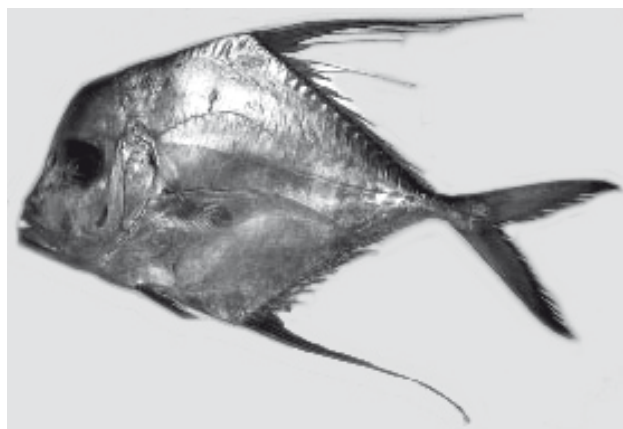
Figure 2. - Specimen of Alexandria pompano, Alectis alexandrinus (FSB/HAL 010), captured off Annaba (Algeria). [Spécimen du cordonnier bossu, Alectis alexandrinus (FSB/HAL 010), capturé au large d'Annaba (Algérie).]