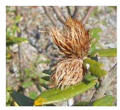
Sara Rall, bugguide.net

Most oak wasp galls are harmless to the tree. In some cases, the galls can cause cosmetic damage and occasionally they can cause significant dieback in heavy infestations. Chemical control is difficult at best. However, if populations are a problem, target the adult gall-makers before they lay eggs (often at bud break) with a contact insecticide. Correct timing is important. Monitor adult activity by placing sticky traps near the galls and dissect several galls a week to track insect development.