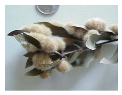
Wooly Oak Leaf Gall

Every year it at this time we start getting a lot of phone calls about little round balls falling out of trees. Sometimes they are fuzzy, and sometimes they are smooth. The fuzzy balls falling to the ground are called woolly oak leaf galls. They are usually attached to the lower surface of an oak leaf and fall off of the leaf. The smooth BB like gall is called the live oak pea gall. When I first encountered these galls I wondered what made them. After a little research, I found out that are many of types of galls on oaks and they can be caused by insects, fungi and even bacteria. The galls we will be learning about in this article are all formed by insects.