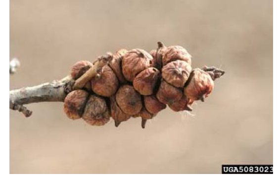
Rough Bullet Gall Whitney Cranshaw Colorado State University

Lately we have been seeing a very severe infestation of rough bullet galls on live oaks in commercial plantings. The trees that are severely infested have heavy infestations. It appears that in the most severe cases the tips of heavily infested branches die back. Some researchers are looking into whether or not there are any live oak cultivars that are more or less resistant to rough bullet galls.