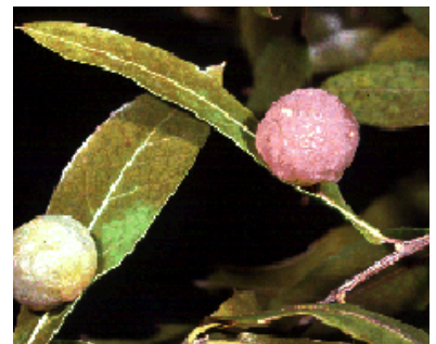
University of Florida

The gall to the right is called an Oak Apple Gall. They are in the genus Amphibolips . They are growths that are filled with a spongy mass. There is one larvae encased in the center of the gall. I once convinced a co-worker that it was the fruit of an oak tree.