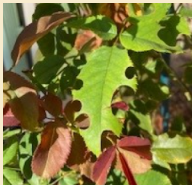
Cuts on a Rose Bush