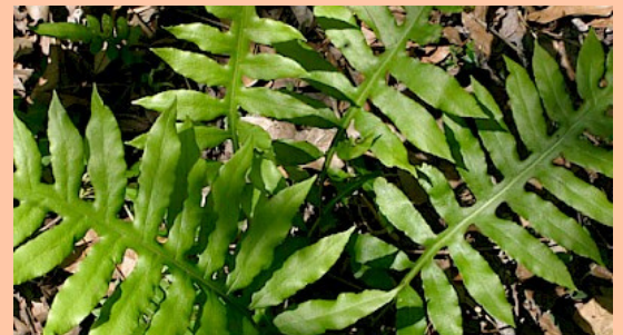
Native Chain Fern

For fern information, visit https://edis.ifas.ufl.edu/entity/topic/ferns