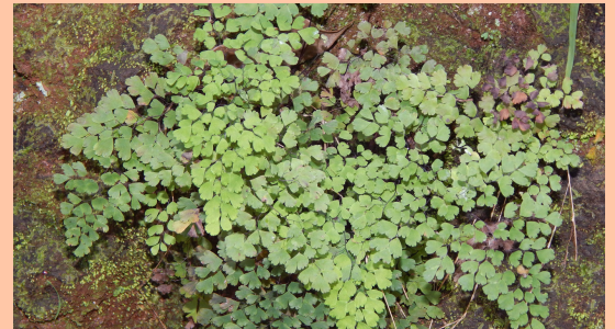
Maidenhair Fern

Many ferns sold in garden centers are not ferns, like the popular asparagus fern which is also invasive. Purchasing ferns from a native plant nursery is the best way to ensure you're getting the correct plant.