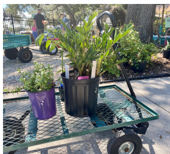
Plant Fair 2021 - Wagon