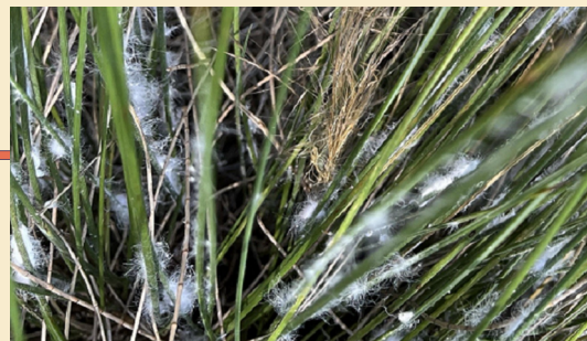
Stemmatomerinx acircula