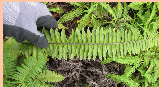
Sword Fern ( Nephrolepis exaltata )