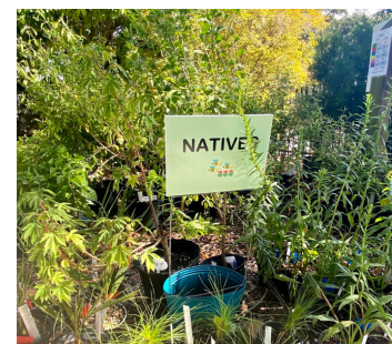
Plant Fair 2021 - Natives