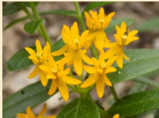
Asclepias tuberosa 'Hello Yellow'

A cultivar (literally “cultivated variety”) is a plant selected for certain characteristics such as size, leaf or bloom color, bloom shape, disease resistance, or other traits, and it can be derived from ornamental as well as native plants. Most cultivars are produced by cloning from plant cuttings and are genetically identical. Nativar is a term created in 2008 to describe a cultivar of a native plant versus a non-native plant. In this country, native plants are those that were present before Europeans arrived. These are the plants that pollinators and other animals depend on as they have evolved together over millions of years.