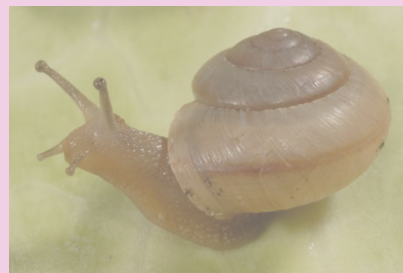
Asian Tramp Snail

Slugs can be described as snails without shells: they are all stomach and slime-producing foot. They live where it is moist and dark, like under mulch or in loose garden soil. They feed (voraciously!) at night, so you may only know they are there by the ragged holes in your leaves and the slime trails they leave as they travel. It is not unusual to have a bedding plant in the evening (like a nice, juicy begonia) that is completely gone by morning!