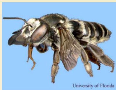
University of Florida

https://edis.ifas.ufl.edu/publication/IN619 Planetbee.org/planet-bee-blog//native-bee-series-leafcutting-bees