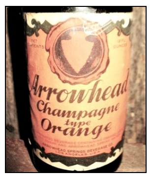
Figure 43 – Orange label (eBay)