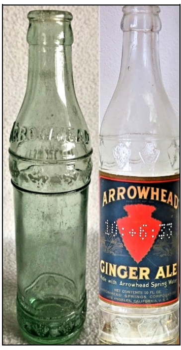
Figure 37 – Paper-label bottle

name on both sides of the neck-shoulder area, the bottle was embossed with a series of downwardly pointing arrowheads on the shoulder, itself. An identical band on the heel had similar arrowheads with "NET CONTENTS 8 FL. OZS." just above it.