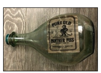
Figure 15 – Paper Label (eBay)

constructed in two parts so that the bottle could be stored on a shelf in the usual upright position or could be tilted to a 45-degree angle for storage in a shorter space (Figure 13). The base was embossed "ARROWHEAD & PURITAS WATERS (arch) / {OI symbol} / Duraglas (cursive) / LOS ANGELES / 2A / PAT. APP. FOR / REG IN CALIF." (Figure 14). The bottles originally