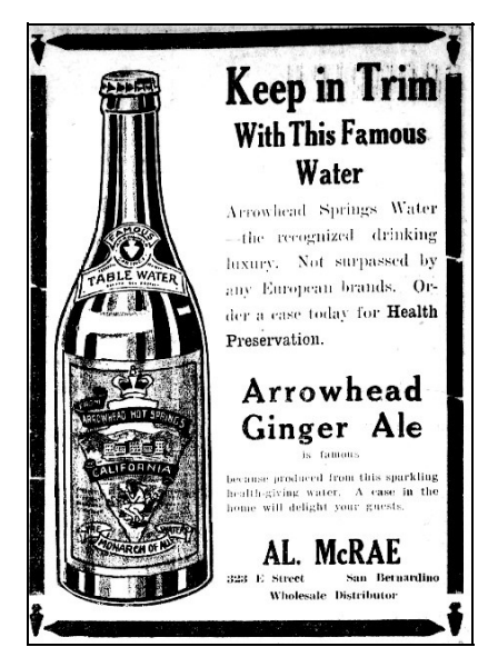
Figure 16 – 1917 ad ( Los Angeles Times 1/27/1917)

center, and a kneeling Indian near the point (Figure 16). We do not know how long these early generic bottles with paper