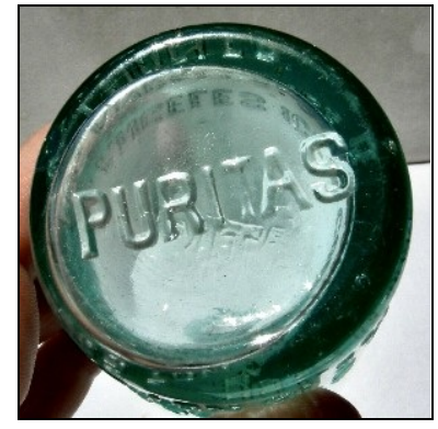
Figure 31 – Puritas base (eBay)

SOLD LOS ANGELES" or "BOTTLE IS NOT SOLD LOS ANGELES" at the heel (Figure 30). The base was embossed "PURITAS" horizontally across the center, sometimes with a double stamp or "PURITAS" above the Diamond-IPGCo logo of the Illinois-Pacific Glass Co. (Figure 31). These were made between 1894 (when LA I&CS developed Puritas) and 1901when the Puritas Water Co. separated from the LA Ice & Cold Storage Co.