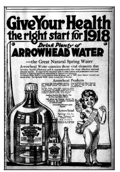
Figure 17 – 1917 ad ( Los Angeles Times 12/27/1917)

A January 27, 1917, ad in the San Bernardino News illustrated a generic, crown-capped bottle with a paper label. Although all of the writing on the label was not legible, the salient points were a neck/shoulder label noting "FAMOUS / ARROWHEAD / SPRINGS / TABLE WATER" that included a downwardly pointing arrowhead and a body label that centered around a downwardly pointing arrowhead with a crown on the top, a drawing of the Arrowhead Resort in the