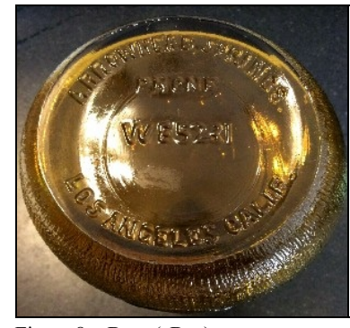
Figure 8 – Base (eBay)

(arch) / PHONE / WE5231 (both horizontal) / LOS ANGELES CALIF. (inverted arch)" (Figure 8). These were probably only used from 1925 (the first time we have found the phone number in on of their ads) to 1933, although the bottles may have been phased out gradually with the introduction of the new, colorless containers in 1933.