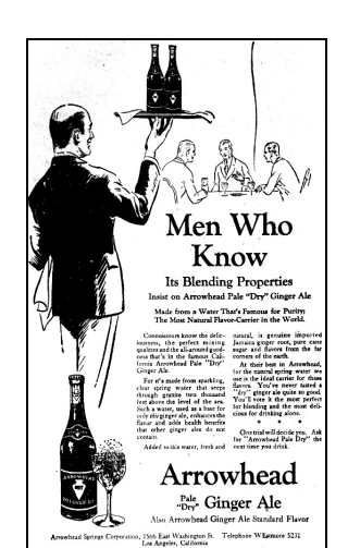
Figure 36 - Ginger ale ad (Los Angeles Times 9/23/1925)

shoulder with the paper label in the center. Another ad, from the San Bernardino County Sun of November 23, 1923, showed the same bottle with a similar label (Figure 35). These were probably