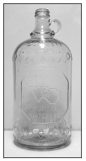
Figure 23 – Arrowhead Puritas gallon

outline (Figure 23). The word "DEPOSIT" appeared above the symbol line at the shoulder with "UNAUTHORIZED USE PROHIBITED BY LAW" below the heel row. This was very similar to one of the larger bottles described above, but all the wording was read with the bottle upright (see Figure 22, Part 2). The continuous-thread finish included a ring to aid in lifting. The base was embossed "346 / 3 intertwined GC / 51" (Figure 24). The logo belonged to the Glass Container Corp., but the glass house rarely included a date code. While this bottle may have been made in 1951, the logo