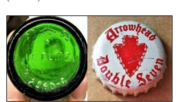
Figure 49 – Double-Seven base & cap

The back was all white ACL: "YOU WILL AGREE / Double / Seven / IS THE FINEST OF / UP TYPE DRINKS / 'It agrees with you.' (cursive) / FLAVOR FROM LEMON AND / LIMES. CITRIC ACID AND