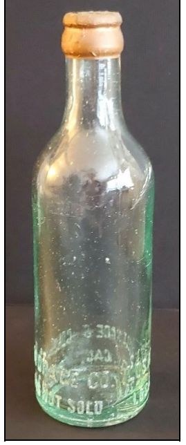
Figure 30 – Puritas bottle (eBay)

Also illustrated was a ginger ale bottle with "PURITAS" on the neck label and "Puritas Ginger Ale (cursive) / MADE FROM DOUBLE DISTILLED WATER / PURE JAMAICA GINGER & FRUIT FLAVORS / THE / ICE & COLD STORAGE COMPANY / LOS ANGELES, CAL. U.S.A." on the body label (see Figure 27).