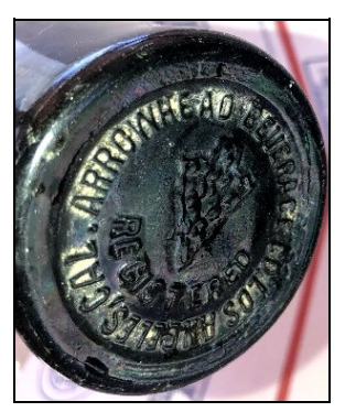
Figure 45 – Base (eBay)

type / Orange" in cursive, followed by two lines of ingredients then "ARROWHEAD SPRINGS BEVERAGE CO. / LOS ANGELES, U.S.A." (Figures 42 & 43).