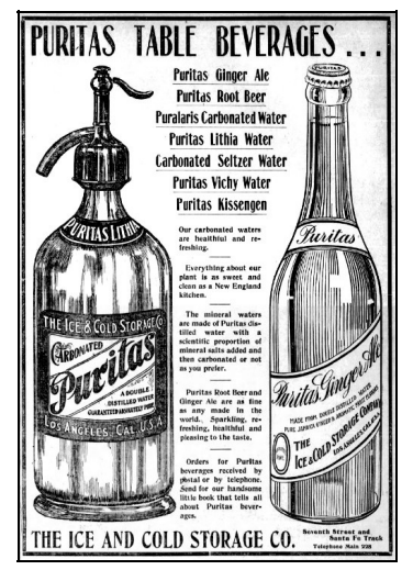
Figure 27 – Puritas seltzer ad ( Los Angeles Evening Express 9/16/1899)

In addition, Arrowhead offered stoneware water jugs – probably before the firm used the coolers (Figures 25 & 26). In 1899, the Los Angeles Ice & Cold Storage Co. advertised Puritas water in siphon bottles with paper labels, but we have not found any of the bottles – which may not have been in production long (Figure 27). The Puritas Mineral Water Co., at 419 W. 54th St., New York, used siphon bottles, but the firm was completely unrelated to any form of California Puritas (Figure 28).