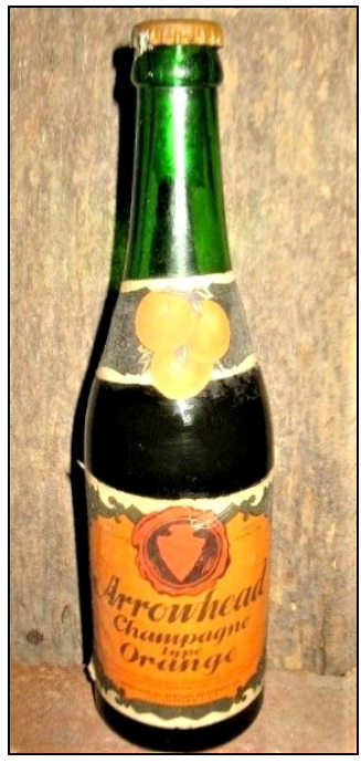
Figure 42 – Orange bottle

An ad in the Los Angeles Evening Express for December 10, 1929, mentioned Arrowhead Champagne Type Orange. The only example we have seen was in a dark green, generic bottle with a paper label. The neck/shoulder label was simple, depicting a cluster of three oranges, while the body label had a downwardly pointing arrowhead at the top with "NET / CONTENTS" to the left and "12 FL. OUNCES" on the right. Below was "Arrowhead / Champagne /