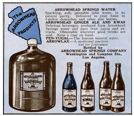
Figure 41 – Undated ad (Nestlewatersna.com)

The Los Angeles Times featured an ad on November 6, 1917, that illustrated a