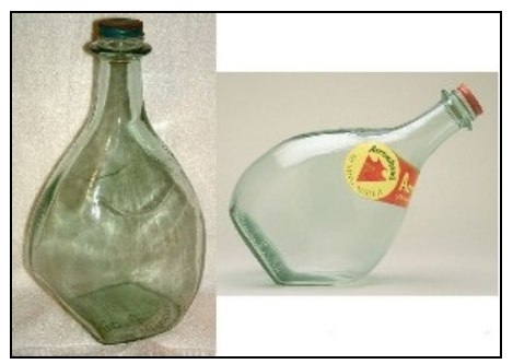
Figure 13 – Tilted base

Compared to the earlier refrigerator bottles, these had a shorter neck, although the neck still extended well above the shoulder. The bottles were aqua in color, topped by a continuous-thread finish, and machine made