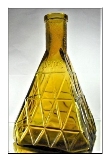
Figure 1 – Pyramid bottle

The California Consolidated Water Co. originally decided to sell different refrigerator bottles for Arrowhead and Purtas waters. The initial Puritas bottle was embossed with a series of triangles and was in a triangular shape with squared tips when viewed from any side. Observed from the base, the bottle was square in shape with chamfered corners – creating an overall pyramidal shape. The one-part finish appears to have been made for a cork, the neck was lined to appear crackled, and "PURITAS" was embossed on the shoulder (Figure 1). The base was embossed "CALIFORNIA CONSOLIDATED WATER COMPANY / FOR PURITAS WATER SERVICE (both arched) / CALL TRINITY 1861 / LOS ANGELES CALIFORNIA (both inverted arches)" (Figure 2). In all likelihood,