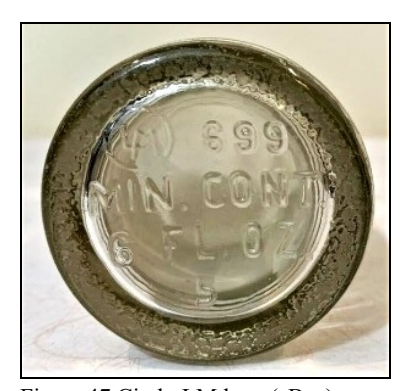
Figure 47 Circle-LM logo (eBay)

An ACL specialty bottle had nine embossed ribs encircling the shoulder above the labeling area with "ARROWHEAD (slight arch) / PURITY {downwardly pointed arrowhead} QUALITY / BEVERAGES (all horizontal)" in black ACL on a white