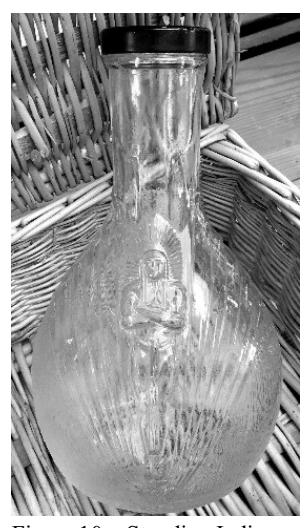
Figure 10 – Standing Indian bottle (eBay)

Like the second Puritas bottle discussed above, this style was designed by J.F. Infield, who filed for a patent on June 5, 1933, and received Design Patent No. 90,619 for a "Design for a Bottle" on September 5 of the same year (Figure 9). Note that these were the same dates as the patent discussed above. This design was for an oval refrigerator bottle with a long neck, embossed with an Indian in a war