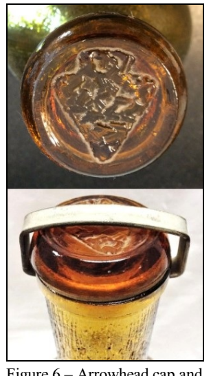
Figure 6 – Arrowhead cap and clamp (eBay)

The first of these bottles varied in color from medium amber to light amber to ice blue with a textured surface and a downwardly pointed arrowhead in a circle at the center, and the glass stopper – held in place by a clamp – also