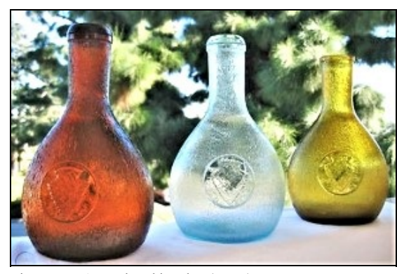
Figure 7 – Arrowhead bottles

The first of these bottles varied in color from medium amber to light amber to ice blue with a textured surface and a downwardly pointed arrowhead in a circle at the center, and the glass stopper – held in place by a clamp – also