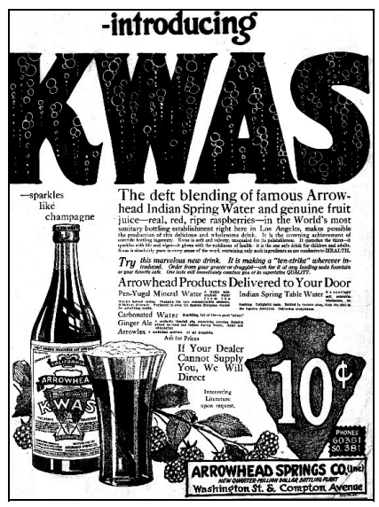
Figure 40 – Kwas ad ( Los Angeles Times 11/6/1917)

The Los Angeles Times featured an ad on November 6, 1917, that illustrated a