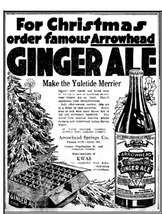
Figure 32 – Ginger ale ad ( Los Angeles Times 12/19/1917)

Our first glimpse of a ginger ale bottle was a drawing in an ad presented in the Los Angeles Times on December 19, 1917. Although this bottle had no neck/shoulder label, the body label was almost identical to the one for table water in the 1917 ads (see above), centering around a downwardly pointed arrowhead with a