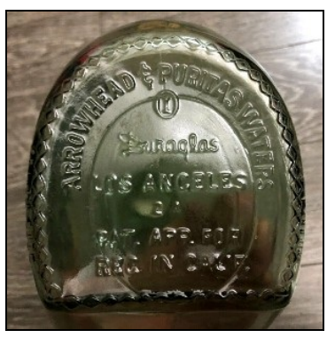
Figure 14 – Base markings (eBay)

carried paper labels that advertised Arrowhead or Puritas – although third-party labels were sometimes used (Figure