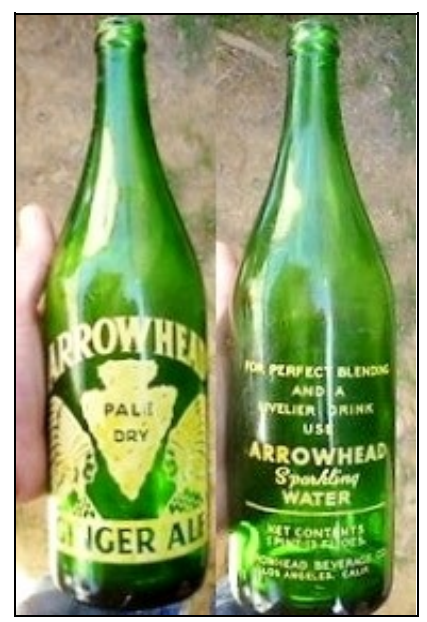
Figure 39 – ACL bottle (eBay)

Our only ACL (Applied Color Lettering) example was also green in color with a pale yellow label: "ARROWHEAD (slight arch) / PALE DRY (in arrowhead with Indian chiefs on either side) / GINGER ALE (stenciled in a rectangle)" (Figure 39). Although the first ACL was used on soda bottles in 1934, very few were out until 1936, and the technique was not common until about 1940, the earliest probable date for this bottle.