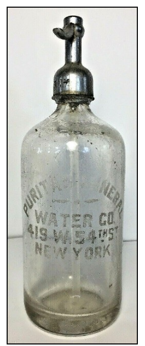
Figure 28 – Puritas seltzer (eBay)

In addition, Arrowhead offered stoneware water jugs – probably before the firm used the coolers (Figures 25 & 26). In 1899, the Los Angeles Ice & Cold Storage Co. advertised Puritas water in siphon bottles with paper labels, but we have not found any of the bottles – which may not have been in production long (Figure 27). The Puritas Mineral Water Co., at 419 W. 54th St., New York, used siphon bottles, but the firm was completely unrelated to any form of California Puritas (Figure 28).