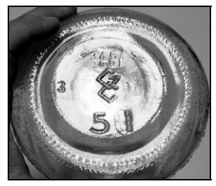
Figure 24 – Base (eBay)

was used from 1934 to ca. 1968. Interestingly, Arrowhead Puritas used five-gallon bottles with very similar designs from 1940 to 1968.