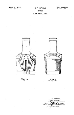
Figure 3 – Infield 1933 patent

the mold was made in 1929 or 1930, just after the 1929 merger that created the California Consolidated Water Co. The firm must have initially used the old Puritas Water Co. phone number that was apparently adopted in 1926. The bottles were replaced in 1933, although some may have continued in production until the old molds were out.