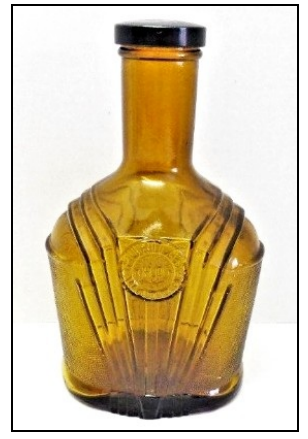
Figure 4 Geometric bottle (eBay)

The second style was designed by J.F. Infield, who filed for a patent on June 5, 1933, and received Design Patent No. 90,620 for a "Design for a Bottle" on September 5 of the same year (Figure 3). Infield assigned the patent to the California Consolidated Water Co. The container was oval and