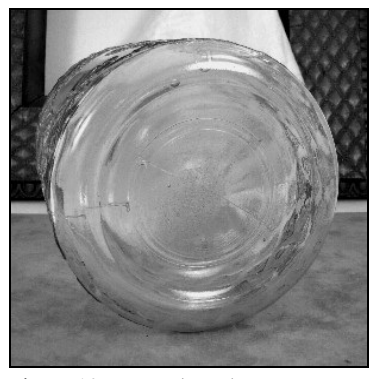
Figure 19 – Base