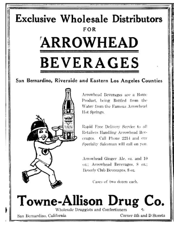
Figure 35 – Paper-label ad (San Bernardino County Sun 11/23/1923)

A Times ad for September 23, 1925, showed a very different bottle for Arrowhead Pale Dry Ginger Ale. The neck/shoulder label had "CALIFORNIA" superimposed over an arrowhead with "ARROWHEAD (slight arch) / DRY in a downwardly pointed arrowhead / PALE GINGER ALE (horizontal)" on the body label (Figure 36). Although the ad was in black and white, we know that the lettering and arrowhead were red on a black background (see next paragraph).