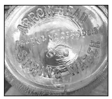
Figure 11 - Base (eBay)

bonnet with his arms folded over his chest – standing on a downward-pointed arrowhead (Figure 10). Many of these bottles have been available at various auction sites. The base was embossed "ARROWHEAD (arch) / PATENT NO DES 90619 (horizontal) / {drawing of the springs} / SPRING WATER (inverted arch)" (Figure 11). Like the Puritas botte designed by Infield (discussed immediately above), these were probably made from 1933 to ca. 1950.