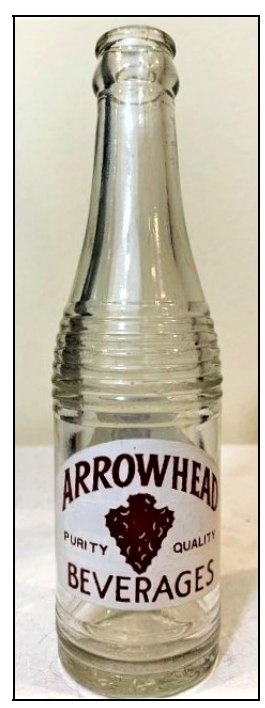
Figure 46– Arrowhead Beverages

the crown cap - a ploy used by several bottlers to avoid having so many different actual bottle shapes and/or labels to deal with.