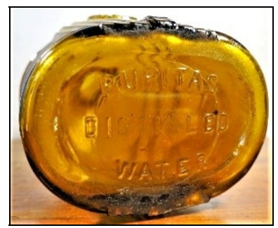
Figure 5 – Geometric base

The second style was designed by J.F. Infield, who filed for a patent on June 5, 1933, and received Design Patent No. 90,620 for a "Design for a Bottle" on September 5 of the same year (Figure 3). Infield assigned the patent to the California Consolidated Water Co. The container was oval and