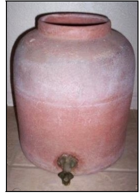
Figure 25 – Ceramic Cooler