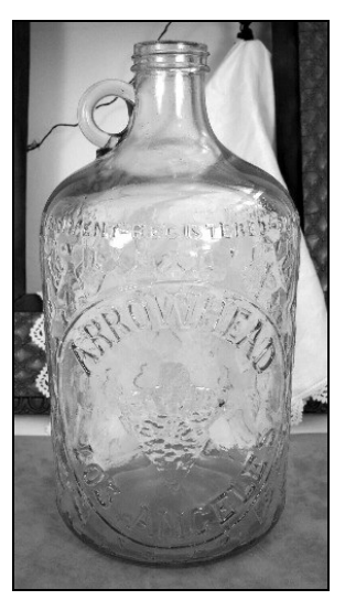
Figure 18 – Arrowhead 1-gallon (eBay)

bottles embossed with 16 rows of arrowheads along with "REGISTERED – PENALTY FOR PRIVATE USE FINE AND IMPRISONMENT" around the shoulder. The front was embossed "ARROWHEAD (arch) / {downwardly pointed arrowhead} / WATER (inverted arch)" in a round plate that stretched from heel almost to shoulder (Figure 18). The continuous-thread finish was made for a screw cap, and the neck had a finger ring. The bottle was machine made (no Owens scar), but the only basal embossing was a zero (0) on the outside edge (Figure 19).