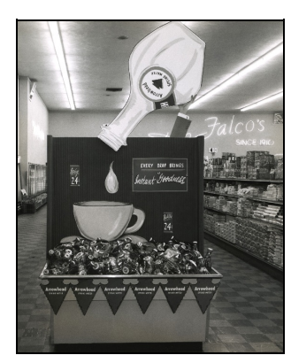
Figure 12 – Refrigerator bottle display

Compared to the earlier refrigerator bottles, these had a shorter neck, although the neck still extended well above the shoulder. The bottles were aqua in color, topped by a continuous-thread finish, and machine made