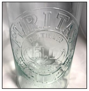
Figure 20 - Puritas 1-gallon

below the outer circle. At the shoulder was "DEPOSIT / ONE GALLON" with "PENALTY FOR PRIVATE USE" at the heel (Figure 20). The base was embossed "APW INC (arch) / 57 Circle (possibly W in center) 1 (horizontal) / 43 (Figure 21). Although the bottle was slimmer and taller than the Arrowhead one-gallon, it had a very similar continuous-thread finish. If the base logo was Circle-W, it was the mark of the Wheaton Glass Co. from 1943 to 1970. That would make 57 the