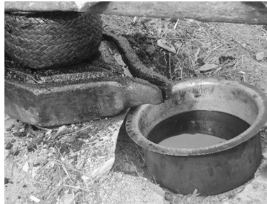
Fig. 4. Traditional process of oil extraction using Tsermoo and Merkang