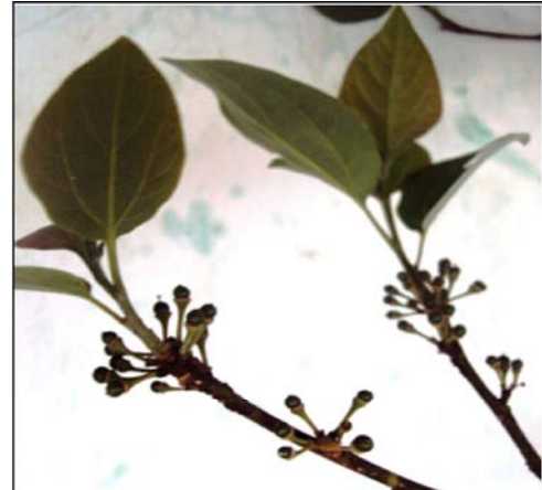
Fig.1. Parasassafras confertiflora (Seshing)