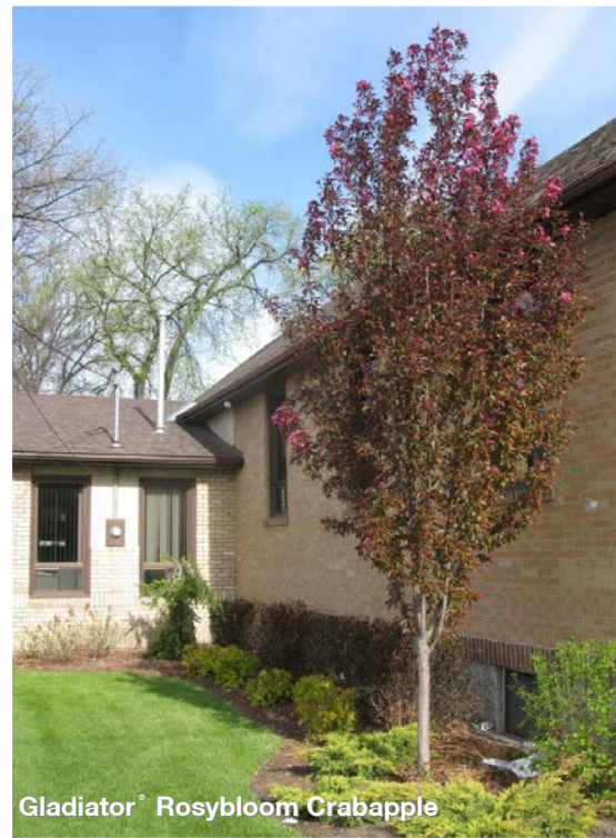
Gladiator® Rosybloom Crabapple

A slow-growing, medium-sized tree with slender spreading branches. Hop-like fruits add interest in late summer. Leaves persist into winter. Minnesota seed source.