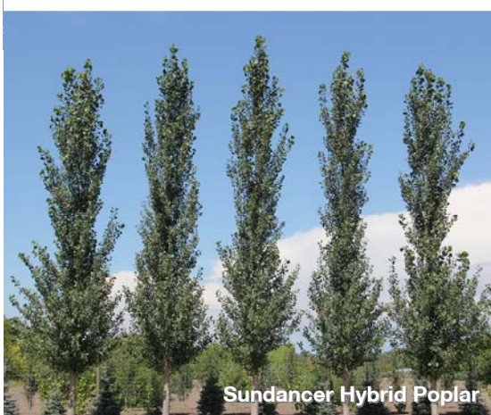
Sundancer Hybrid Poplar