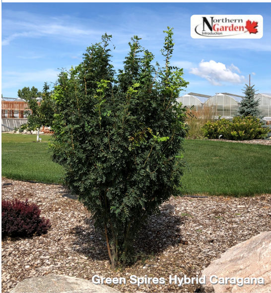
Green Spires Hybrid Caragana