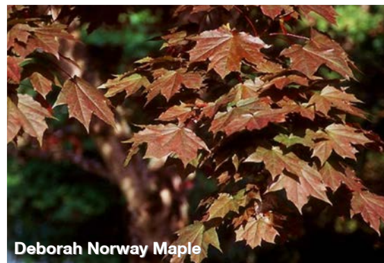
Deborah Norway Maple