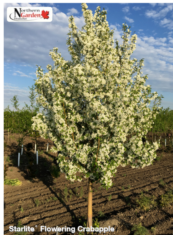
Starlite® Flowering Crabapple