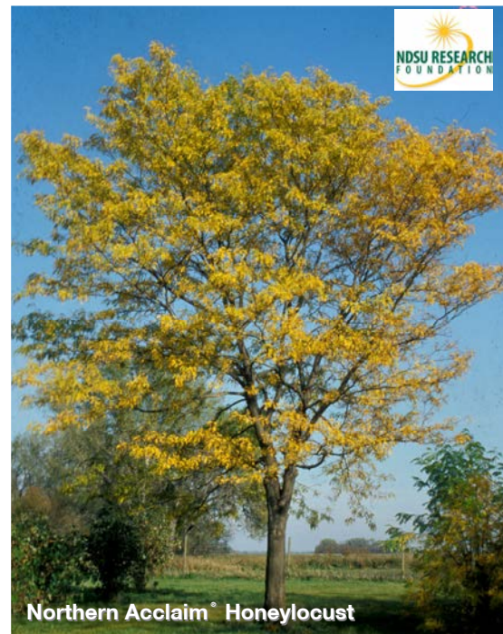
Northern Acclaim® Honeylocust

Purple Spire is outstanding for its compact, columnar form and showy purple foliage in late summer. A few pink flowers in spring are followed by purple fruit. Introduced by Jeffries and Bylands Nurseries.