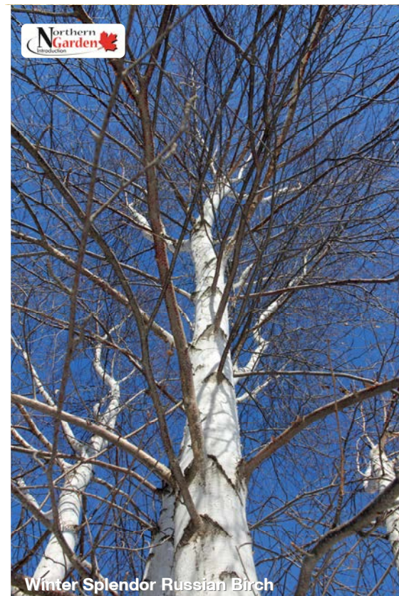
Winter Splendor Russian Birch

Winter Splendor develops a rounded spreading crown form with multiple stems and clean white bark. A drought-tolerant cultivar with resistance to Bronze Birch Borer.