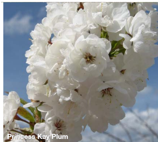
Princess Kay Plum