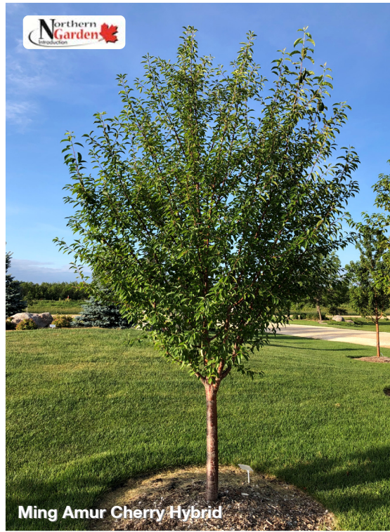
Ming Amur Cherry Hybrid

A native to Manitoba, Bur Oak is slow growing, long-lived, adaptable to a wide range of soils and is very tolerant to drought.