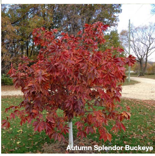
Autumn Splendor Buckeye