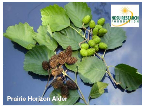
Prairie Horizon Alder

A fast-growing, cold hardy tree for difficult, dry locations. Dark green foliage, purple catkins followed by brown strobiles (resembling tiny pine cones) in fall. NDSU introduction.