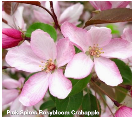
Pink Spires Rosybloom Crabapple