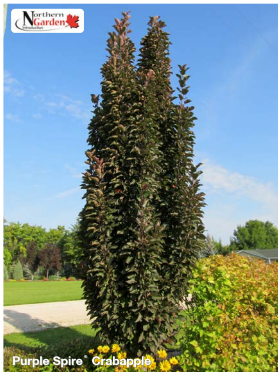
Purple Spire® Crabapple