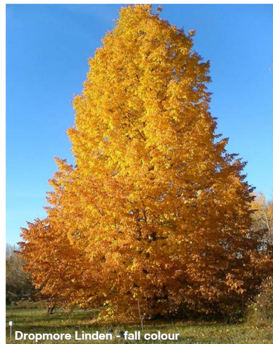
Dropmore Linden - fall colour

A hybrid of American and Littleleaf Linden with a straight trunk and large leaves. Attractive pyramidal form. Golden fall foliage colour. Developed by Sheridan Nursery.