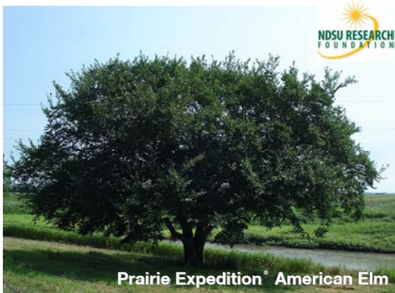
Prairie Expedition® American Elm