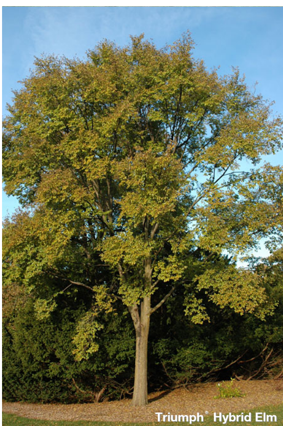
Triumph® Hybrid Elm