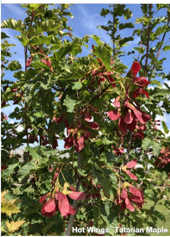
Hot Wings® Tatarian Maple