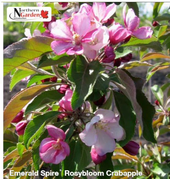
Emerald Spire® Rosybloom Crabapple