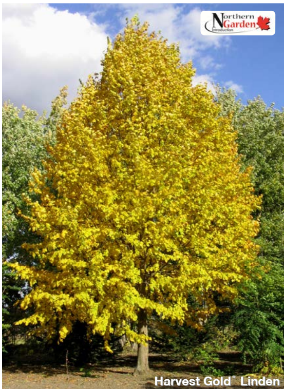
Harvest Gold® Linden