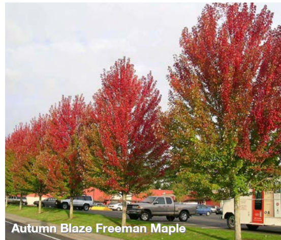
Autumn Blaze Freeman Maple