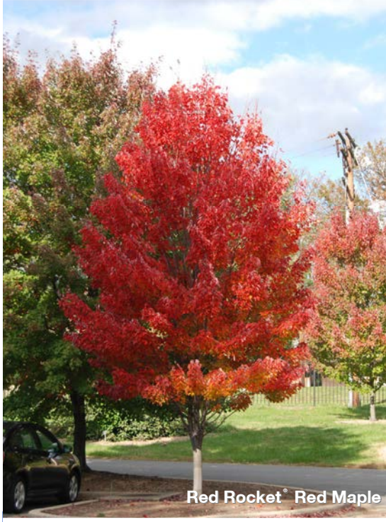
Red Rocket® Red Maple

Hybrid buckeye cultivar from the University of Minnesota Landscape Arboretum. Scorch-resistant foliage turns maroon-red in the fall. Yellow-red flowers seldom give rise to fruit.