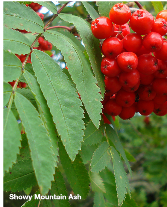
Showy Mountain Ash

The hardiest and slowest growing member of this genus. Its foliage and flowers are similar to European, but berries are bright red. Moderate resistance to fireblight.