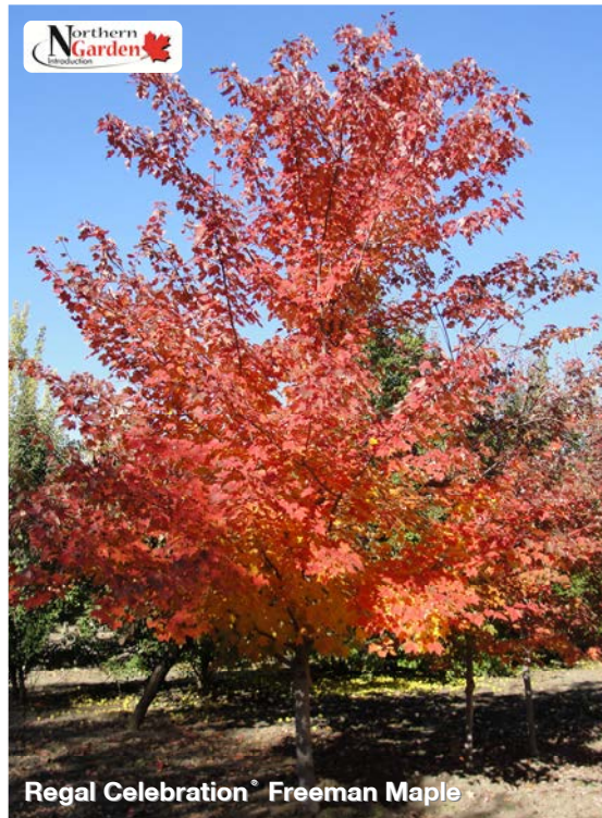
Regal Celebration® Freeman Maple