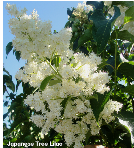
Japanese Tree Lilac

This small tree has cherry-like bark, glossy foliage and spectacular creamy-white, fragrant flowers that bloom in June. No disease or insect problems. A Sheridan Nursery introduction.