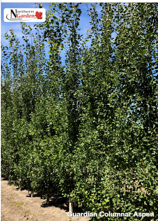
Guardian Columnar Aspen