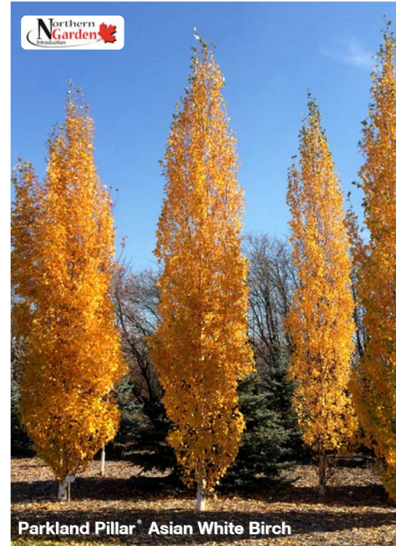
Parkland Pillar® Asian White Birch

New listing for 2020. The parent tree in Dickinson, N.D. is the largest of this species observed in the upper Northern Plains. Ivory colored bark with striking coppery-bronze exfoliations. Resistant to bronze birch borer. NDSU introduction.