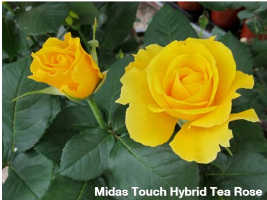
Midas Touch Hybrid Tea Rose