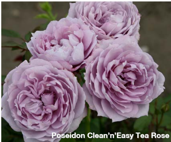
Poseidon Clean'n'Easy Tea Rose