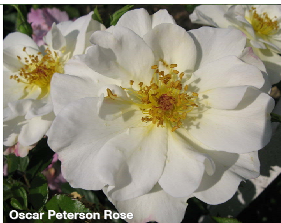
Oscar Peterson Rose

Named after the famous French-Canadian singer, this variety covers itself in clusters of large, medium pink blooms all season. Can be trained as a climber. Extremely disease resistant.