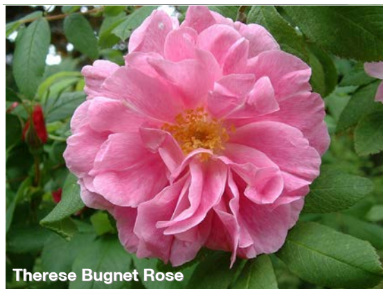
Therese Bugnet Rose