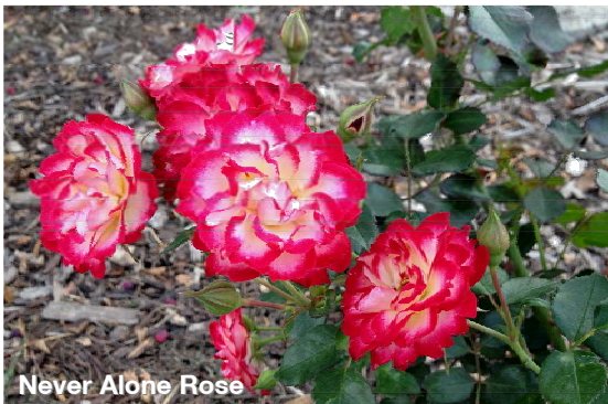
Never Alone Rose

This incredible rose blooms in a flush with a riot of exotic coral colours. Gardeners will love this low-maintenance beauty featuring black spot tolerance and winter hardiness across Canada. Released by the Vineland Research and Innovation Centre.