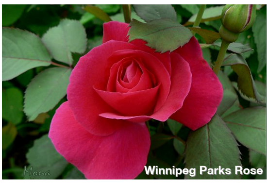
Winnipeg Parks Rose

Full, cup-shaped cream-white blossoms with greenish-yellow centre. Blooms in flushes throughout the season.