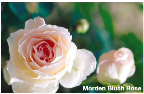
Morden Blush Rose

This award winning rose produces double flowers from early summer until fall. Strongest fragrance among Parkland roses. Excellent disease resistance.