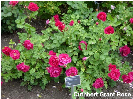
Cuthbert Grant Rose

These roses were developed at Manitoba's own Morden Research Station. Parkland Roses are hardy in zones 2 and 3, own rooted and repeat bloomers.