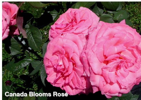
Canada Blooms Rose

Often described as a hardy Hybrid Tea rose, Canada Blooms produces fragrant flowers with over 40 petals. The dark-green foliage is moderately resistant to diseases. A sheltered location in the garden combined with additional mulch in the fall and some lasting snow cover should guarantee winter survival in zones 2 and 3.