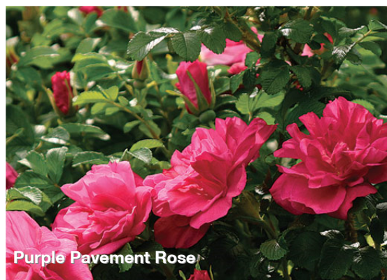
Purple Pavement Rose

New listing for 2020. An everblooming rose with semi-double blooms that emit a strong cinnamon fragrance. Salt tolerance makes this plant a landscape favorite. USPP #22,570