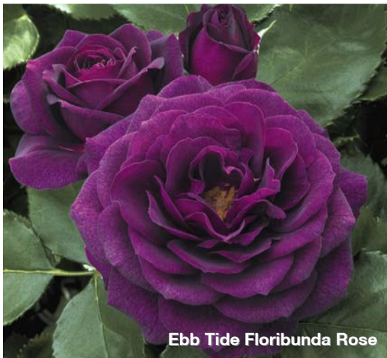
Ebb Tide Floribunda Rose