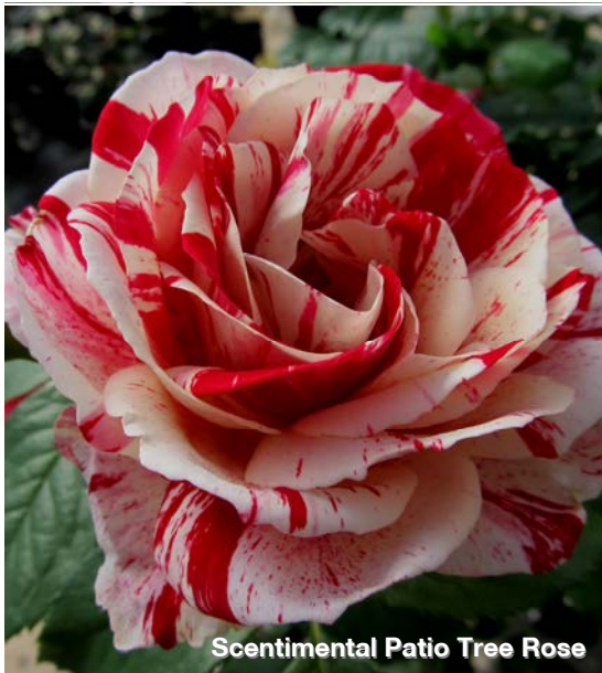
Scentimental Patio Tree Rose