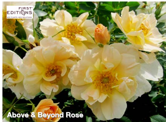
Above & Beyond Rose