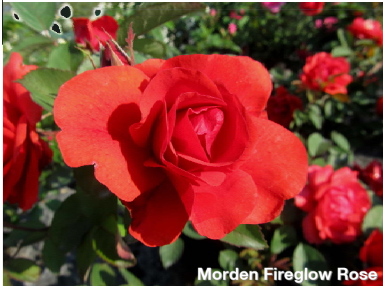
Morden Fireglow Rose

A dwarf plant with double flowers (50 petals) in clusters of 1-5. As they mature flowers fade from pink to ivory. Excellent for bouquets. Good disease resistance.