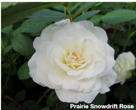
Prairie Snowdrift Rose

Glowing red flowers have 28 petals. The unique flower colour was the result of lab-based selection based on petal pigments. Moderate resistance to powdery mildew.