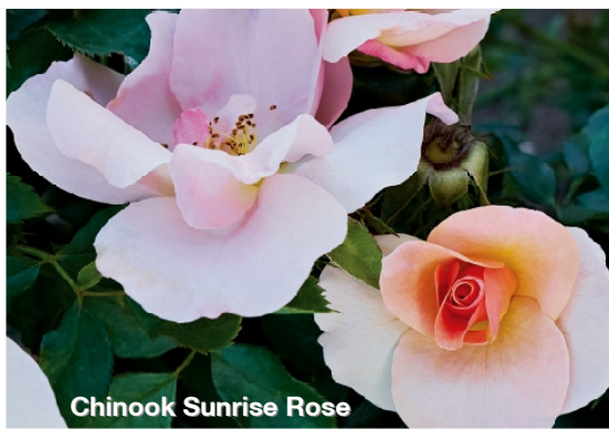
Chinook Sunrise Rose

Large red flowers (42-52 petals) are produced throughout the summer and fall. Foliage is resistant to black spot and powdery mildew. Released by the Vineland Research and Innovation Centre to coincide with Canada's 150th birthday in 2017.