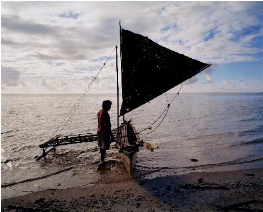
A Fishing Canoe

Well culturally, I think the canoe is part of the family you know. You have the parents – the father and the mother – and you have the children and next to that is the canoe. The canoe is very important, it's like a member of the family in a sense. ... so it's a very intimate relationship with the canoe, because we depend a lot on the sea. If you have no canoe you feel incapacitated because you can't go to the sea, you can't get fish, there is really something missing you know.