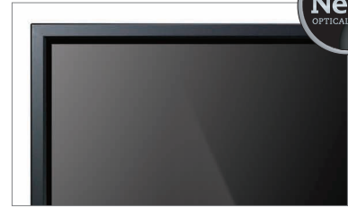
NeoV™ Optical Glass protects against scratches, impacts and other physical damage