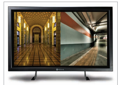
Viewing versatility with Picture-in-Picture (PIP), Picture-by-Picture (PBP) and Video-on-Video (VOV)