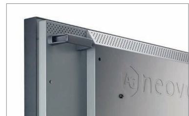
Durable metal casing for enhanced strength and secure mounting