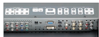
Multiple video inputs (VGA, DVI, dual BNC, S-Video and Component) allow for effortless system integration