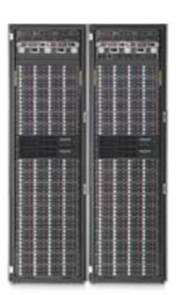
HP StorageWorks Enterprise Virtual Array Cluster