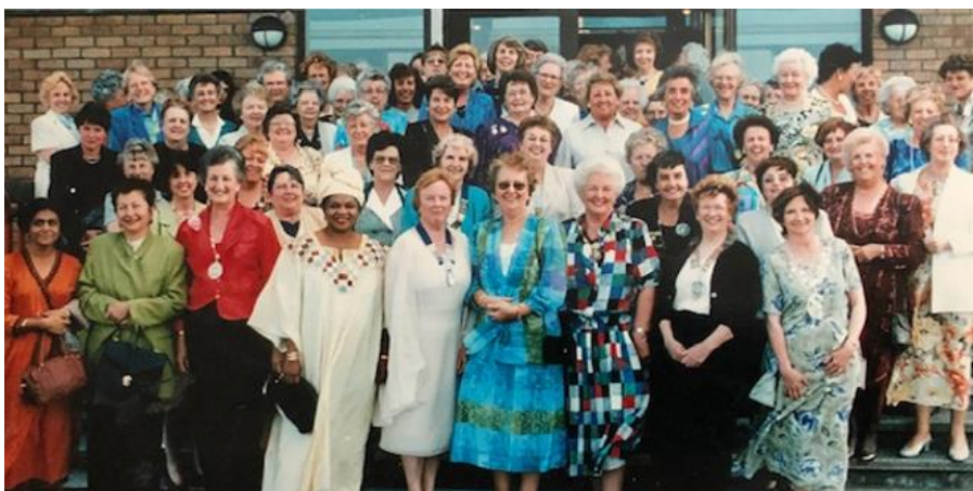
Members and guests pictured outside West Lancs Golf Club before the start of the Diamond Jubilee Party

Other events to mark the diamond jubilee included the presentation of a bench with a memorial plaque in the centre of Crosby village shopping area and the planting of a flower bed featuring the Soroptimist logo in Victoria Park, Waterloo. The commitment to support children attending courses at CHET – Crosby Hall Educational Trust – was renewed for a further five years.