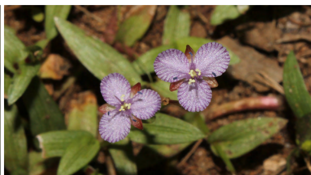
L - Carisa spinarum , R - Cyanotis sp