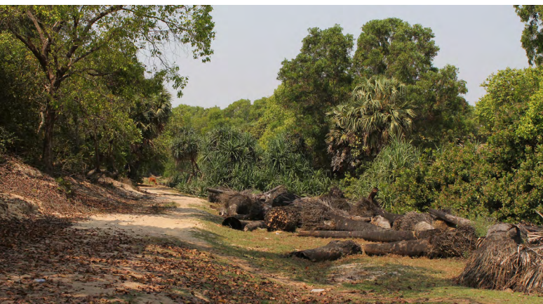
Sand dune vegetation along the Buckingham Canal. Proposed route for coal conveyor belt.

The proposed site has many seasonal and semi-permanent pools, ponds, backwaters and irrigation tanks. These are home to a wide variety of aquatic species. Coastal wetlands are crucial habitat for several plant species belonging to Scrophulariaceae, Commelinaceae, Cyperaceae and Poaceae families. A wild relative of rice - Leersia hexandra - was recorded during our research. These wetlands are also important habitat for birds and other animal lives.