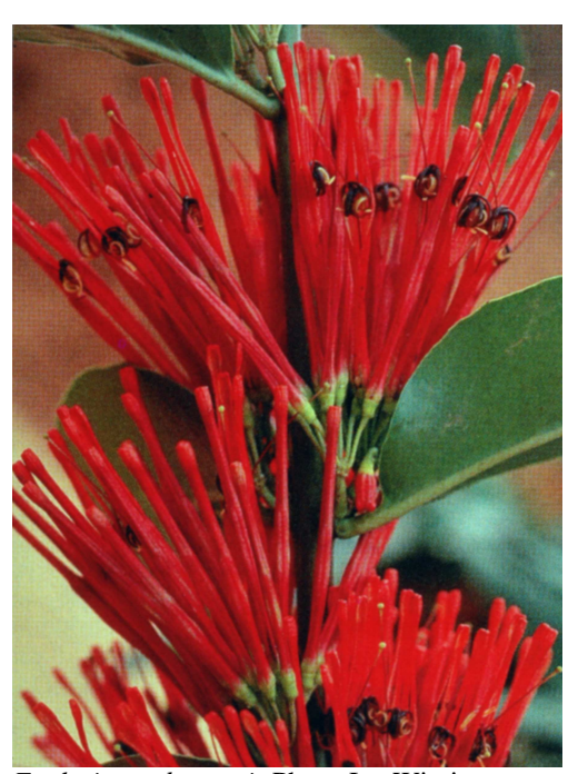
Englerina gabonensis

In a search of my Endnote reference database that contains all of the citations listed in past Haustorium newsletters the name Loranthus micranthus was used in the following journals: African Journal of Biotechnology, American Journal of Pharmacology and Toxicology, Asian Journal of Biomedical and Pharmaceutical Sciences, Asian Pacific Journal of Tropical Medicine, Bio-Research, Current Research, Drug plants, European Journal of Medicinal Plants, Fitoterapia, International Journal of Pharma and Bio Sciences, Journal of Ethnopharmacology, Journal of Pharmacy and Pharmacology, Journal of Tropical Medicine, Pharmaceutical Biology, and Phytopharmacology and Therapeutic Values. I then searched for this binomial using Google Scholar and added the following journals: Biochemistry Research International, Current Research Journal of Biological Sciences, Evidence-Based Complementary and Alternative Medicine, Global Advanced Research Journal, Journal of Pharma and Bio Sciences, Journal of Pharmaceutical and Allied Sciences, Natural Product Research (Formerly Natural Product Letters), Pharmaceutical Biology, Phytochemistry Letters, Planta Medica, Research Journal of Medicinal Plant, and Scientia Africana. Although some of these journals are from developing nations, others are from the United States and Europe, demonstrating that this taxonomic problem is not being detected among a wide range of authors, journals, reviewers, and editors.