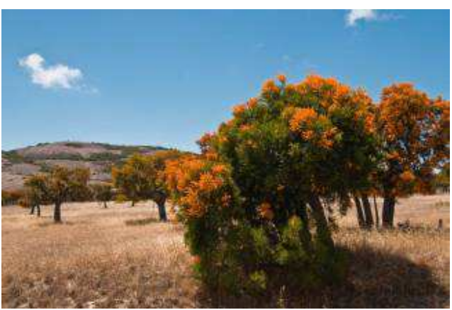
Photo: Nuytsia floribunda , the Australian mistletoe, in bloom in Western Australia.

were so beautiful,' she told 720 ABC Perth. 'What we have been doing is looking at the trees that were left amongst houses and parkland and found that most of those have disappeared. 'The trees that were in patches of urban bushland were still there.'We think about 90 per cent of the trees that are not in bushland have disappeared. In bushland nearly 100 per cent have remained.'