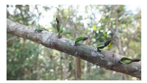
Mistletoe seeds 'planted' for the host suitability experiment.