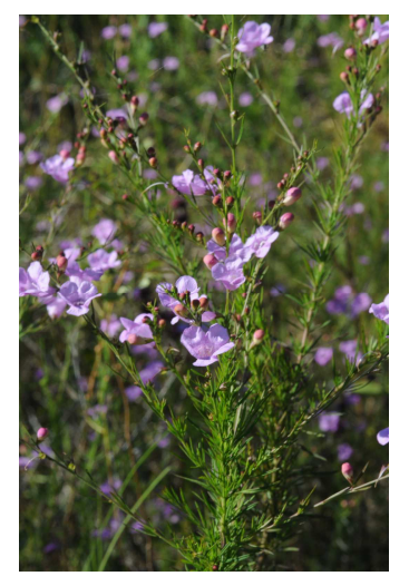
Agalinis fasciculata at margin of loblolly pine plantation, Sabine Parish, Louisiana. 5 October 2014

A. fasciculata is an annual, herbaceous plant that parasitizes several pine species (Musselman and Mann 1979) including loblolly pine, longleaf pine ( P. palustris Mill.), sand pine ( P. clausa Chapm. ex Engelm.), slash pine ( P. elliotii Engelm.), and shortleaf pine ( P. echinata Mill.). A. fasciculata is native to the southeastern United States (Miller and Miller 1999), has showy pink or purple flowers lasting one day, and grows 5 to 6 feet tall by the end of the growing season (Figure Two). It can be easily confused with A. purpurea (L.) Pennell, another common species, that often forms large stands in ditches and other moist areas.