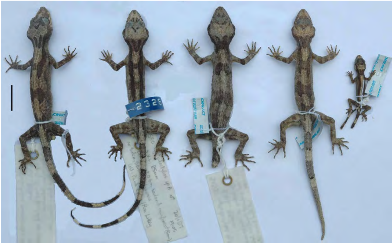
FIGURE 2. Dorsal view of type series of Cyrtodactylus nuaulu sp. nov. From left to right MZB lace 2325, MZB lace 2326 (holotype), MZB lace 2327, MZB lace 2328, MZB lace 2329. Scale = 20 mm.

much broader than high and bordered dorsally by a single series of variably sized enlarged scales. Head scales small and granular, temporal and nuchal scales smaller than those on snout, scattered small conical tubercles on temporal and nuchal regions. Infralabials to rictus: 9 on right, 10 on left, all much broader than high, bordered by several rows of enlarged scales grading into small and granular gular scales. Mental triangular, approximately as wide as long, bordered by first infralabials and two diamond-shaped postmentals in contact for approximately 50% of their length.