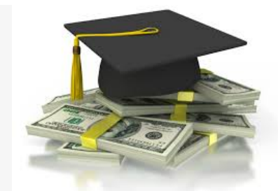
$45,000 for SJHS Class of 2018