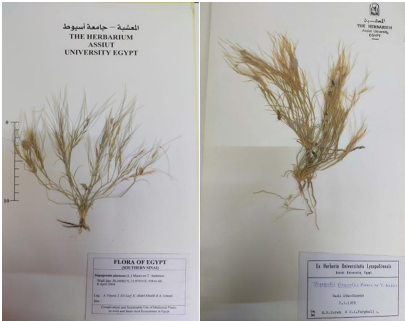
Fig. 2. Stipagrostis plumosa (L.) Munro ex T. Anderson subsp. seminuda (Trin. & Rupr.) H. Scholz - Left ; Stipagrostis plumosa (L.) Munro ex T. Anderson var. brachypoda (Tausch) Bor - Right , (habit; herbarium specimens, ASTU).

Distribution in Egypt: the species is widely distributed in the most phytogeographical regions in Egypt: The Nile region, including the Delta, Nile Valley, and Faiyum, the Oases of the Western Desert, the Mediterranean coastal strip, all the deserts of Egypt, including that of Sinai Peninsula, the Red sea coastal strip, and Gebel Elba and surrounding mountainous regions [5].