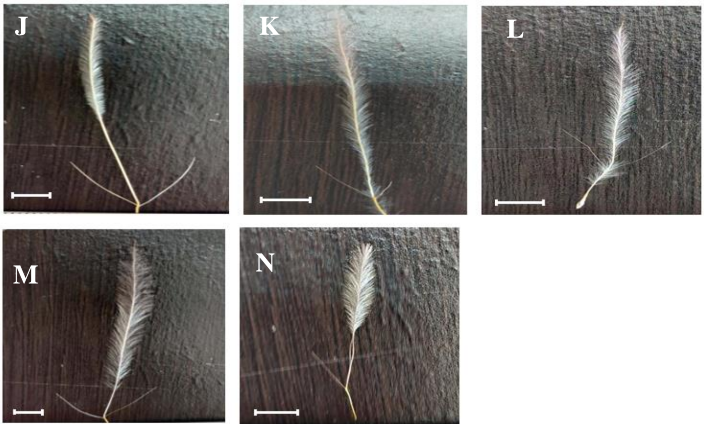
Fig. 1 continued: Awns of Stipagrostis : (J) S. multinerva , (K) S. hirtigluma , (L) S. uniplumis , (M) S. paradisea , (N) S. obtuse (Scale bare = 5 mm).

Phenology: Flowering and fruiting in April and May [18].