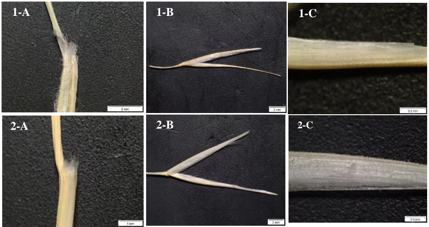
Fig. 3. Differences between the two varieties of S. plumosa : (1) subsp. seminuda , (2) var. brachypoda . (A) sheath, (B) whole glumes, (C) enlargement part of upper glume.

Panicle about 6 cm long. Spikelet small, erect; glumes unequal, lanceolate, multinerved, lower glume 15 mm long, 5-7-nerved, scabrous; upper glume 20 mm long, 3-5-nerved, scabrous; lemma 6 mm long, 3-awned, central awn plumose only in the upper half with a naked exerted tip, up to 50 mm, lateral awns naked, up to 15 mm long.