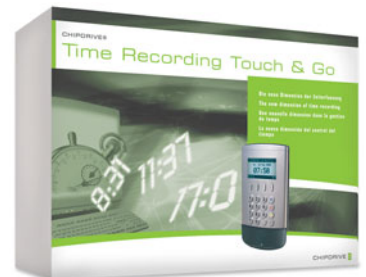
CHIPDRIVE® Time Recording Touch & Go