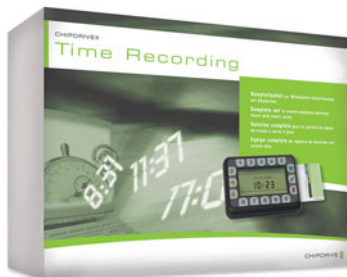
CHIPDRIVE® Time Recording

Each time recording device in the system is uniquely identified by the system so you can see which device was used for each booking.