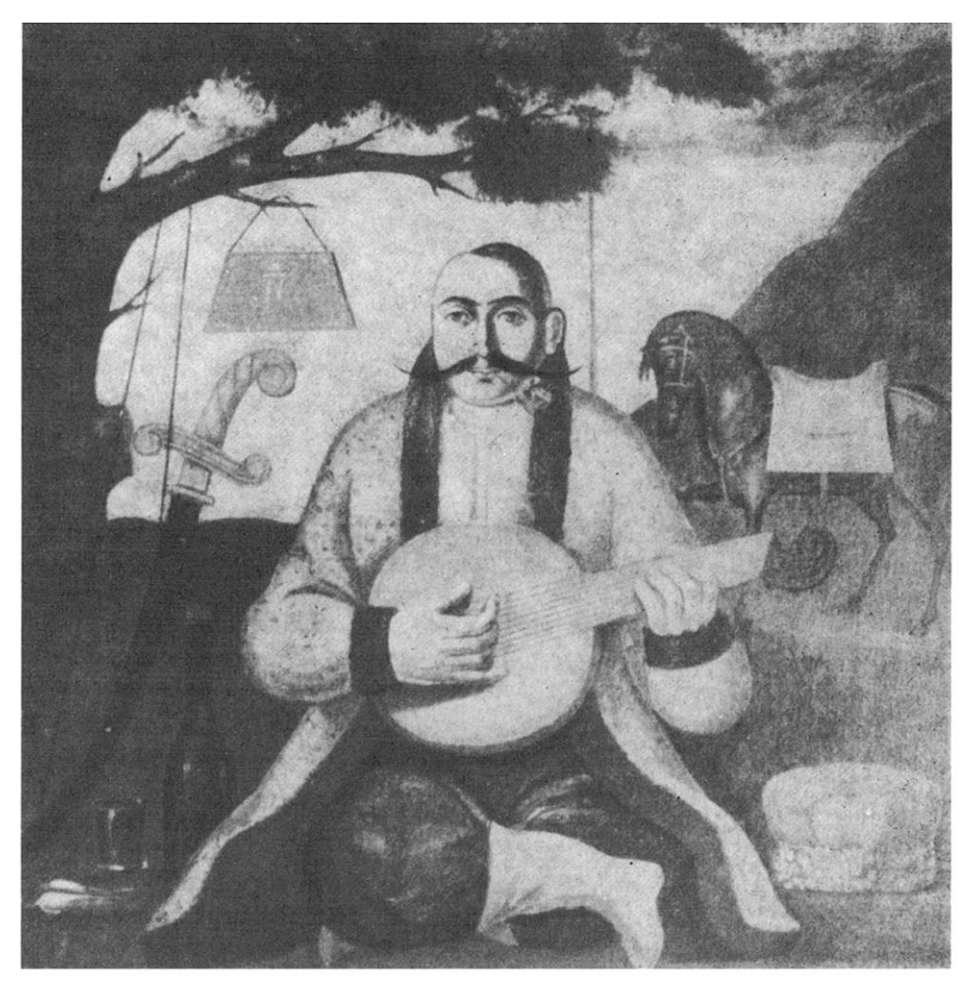
Figure 3. From P. M. Zholtovs'kyi, Ukraïns'kyi zhyvopys XVII-XVIII st. (Kiev, 1978), 298.

both the American and the Ukrainian scene, the audience identifies with the minstrel performance—it legitimates its own view of it—through somebody else's, some patron's, gaze. Mamai (like the black dancer) remains the painting's ostensible subject matter; the panych (like the white b'hoy) occupies the place from where the picture communicates with us, against which our view of Ukrainian culture, at the turn of the nineteenth century, is unconsciously triangulated.