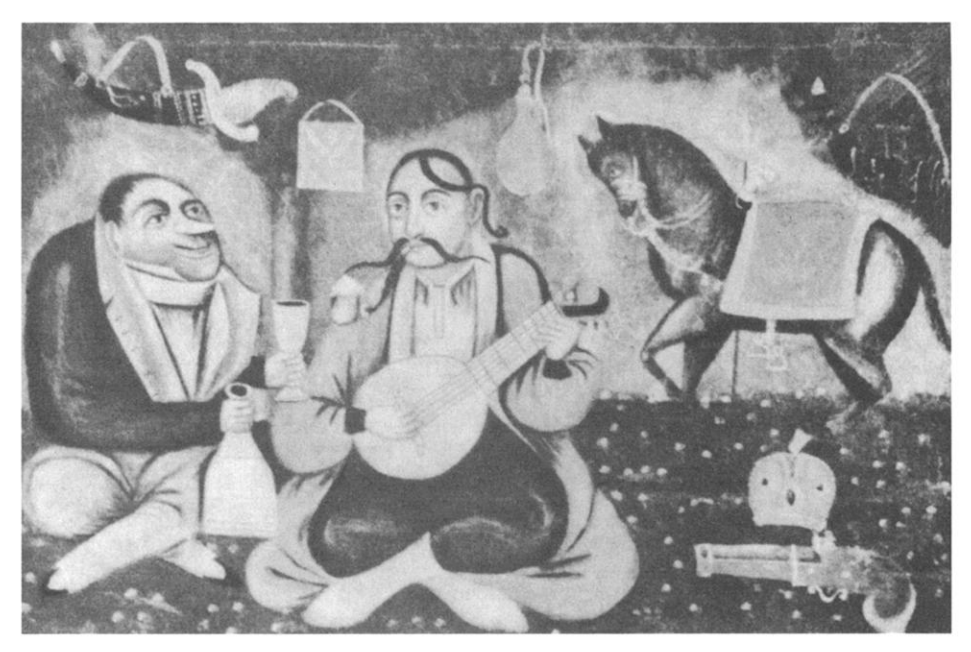
Figure 4. From P. M. Zholtovs'kyi, Ukraïns'kyi zhyvopys XVII-XVIII st. (Kiev, 1978), 300.

orossiiskii (Little Russian, as in figures 5 and 6). These are all Great Russian signifiers for Ukrainian cultural production. Hence, the Ukrainian public's activity (and, despite the location of the Little Russian craze in Russia, we must assume that most readers of these works were in fact Ukrainians) is supported by the illusion—if not the reality—of Russian patronage, of another, Russian, audience. The latter gives structure to the former.<sup>27</sup>