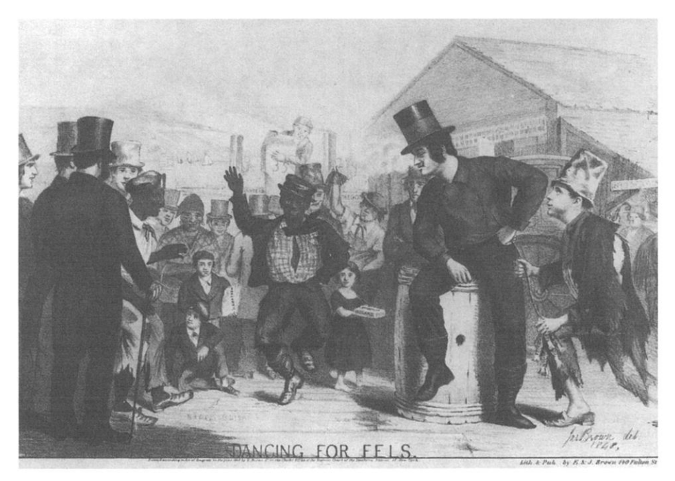
Figure 2. From W. T. Lhamon, Jr., Raising Cain: Blackface Performance from Jim Crow to Hip Hop (Cambridge, Mass., 1998), 27.

Nets of identification are being stretched. If the viewer of the 1820 folk drawing may identify with the black dancer by virtue of his own "autonomous," framed position, by the 1840s he may do so only through the watchful gaze of the white dandy.<sup>24</sup> Whose gaze structures our view? An early nineteenth-century popular reimagination of Mamai, the "paragon of Cossackdom" (figure 3), poses the same problem (figure 4).<sup>25</sup> Like the black dancer, Cossack Mamai looks back at the viewer from the center of the picture. Like the dancer, Mamai is observed from more than one quarter: off to the left of center is a panych , a dandy, watching the Cossack.<sup>26</sup> While we may track the foregrounding and centering of the foppish white "b'hoy," who focuses our view in the American print over time , in the Ukrainian painting the same effect has been achieved simultaneously: the face of our panych is grotesquely lengthened, his eye, nose, and mouth displaced toward the center, so much so that his features take on coherence only as the viewer moves away from center. In the case of