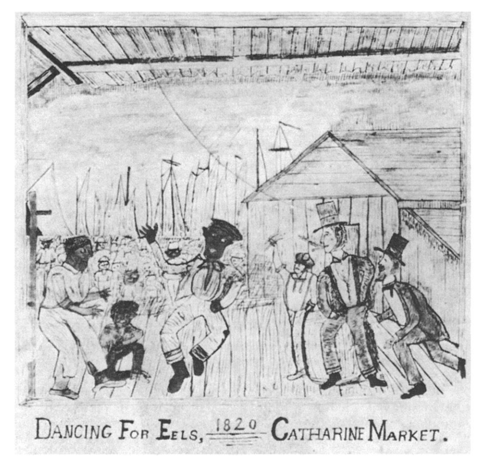
Figure 1. "Dancing for Eels, 1820 Catharine Market."

the earliest minstrel shows (before the first white performers "corked up" in blackface), danced on the docks of port cities by free blacks and slaves in exchange for eels, some spectators were black, others white; some were watching, others paying; some were patrons, others patronizing. These relationships may be seen in the early American folk drawing of a black minstrel performance, "Dancing for Eels 1820 Catharine Market" (figure 1) and its successive reworkings in prints of the late 1840s (figure 2).<sup>23</sup> Lhamon shows us that points of view are shifting: if in the original drawing, we see the dancer and two coteries of admirers (one black, the other white) from a distanced and framed viewpoint in a market stall, in the prints we have been pushed out into the open, into the crowd; if the black and white viewers are balanced at first, by the end the whites, and, one assumes, the values that accompany their gazes, have come downstage.