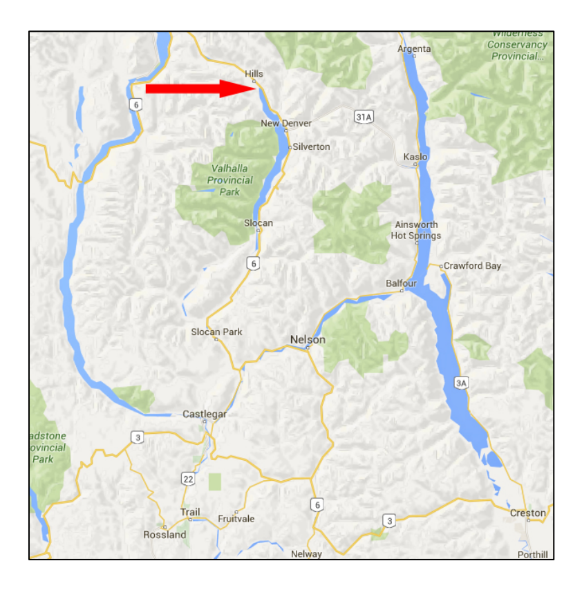
Fig. 1. Location of Bonanza Marsh Wetland Complex in the Slocan Valley (Adapted from Google Maps).

Given the on-going conversations about the future condition of the Bonanza Marsh Wetland Complex among local residents, stewardship groups, land conservancies, biologists and resource managers, SWAMP has prepared this paper to further inform conservation objectives and actions towards protecting Bonanza's exceptional ecological values.