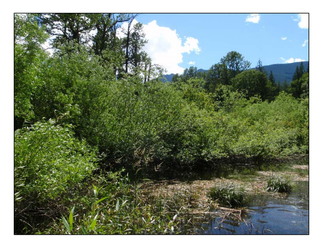
Fig. 6. Ws06 Sitka willow – Sitka sedge swamp.

Willow swamp . Sitka willow dominated Ws06 (Sitka willow – Sitka sedge) swamps occur along the outlet of Bonanza Creek where it drains into Slocan Lake (Fig. 6). It is in excellent condition, with no recent disturbances or invasive species present. This wetland type is blue-listed in many portions of the province, but is not currently tracked as an ecosystem-at-risk in the Interior Cedar Hemlock subzone where it occurs in the Slocan Watershed. It is uncommon in the Slocan Watershed, currently identified in only three locations, and is often highly modified or degraded.