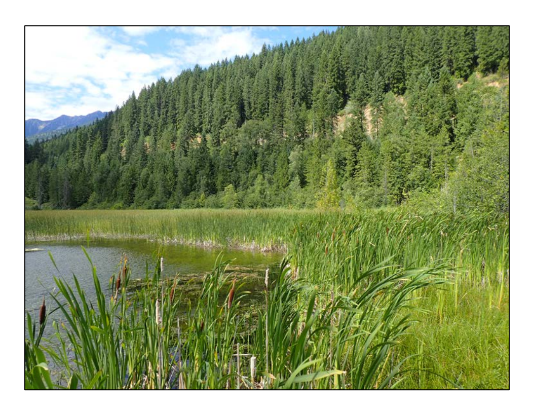
Fig. 9. Cattail marsh.