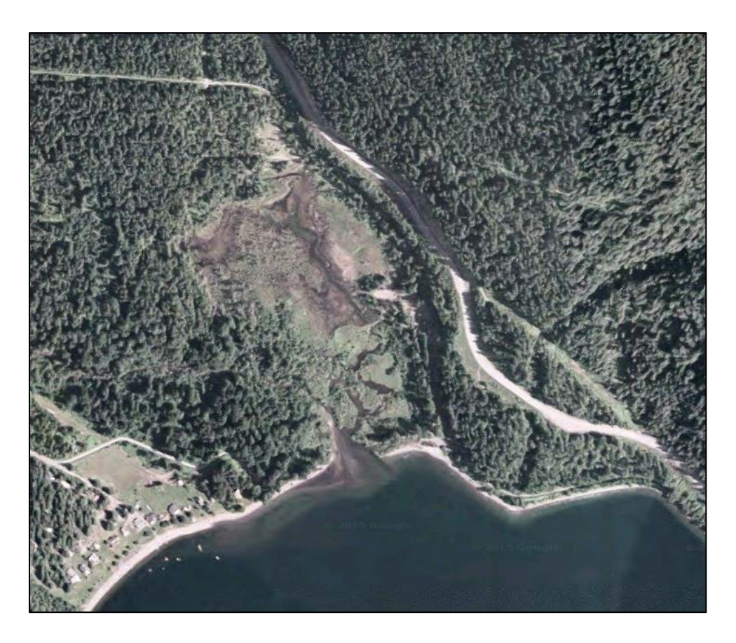
Fig. 2. Satellite map of Bonanza Marsh Wetland Complex at the north end of Slocan Lake (Adapted from Google Maps).