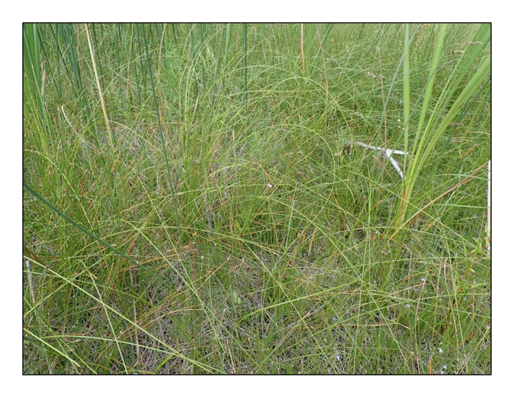
Fig. 13. Beaked Spike-Rush.

A sizeable population of beaked spike-rush ( Eleocharis rostellata ) was found by Ryan Durand in the Bonanza Complex in July, 2015 (Fig. 13). The population covered an area of roughly 0.25 hectares with roughly 50% cover of the species. The population is considered to be viable and stable with no immediate threats. It is restricted to a fen in the southeast corner of the complex. No other similar habitat (it requires water with elevated salinity and/or calcium) is known in the complex, or in the larger watershed, therefore it is expected that this is the only element occurrence of this species. The Bonanza occurrence is the 10<sup>th</sup> known element occurrence of this species in the province (BC CDC, 2015).