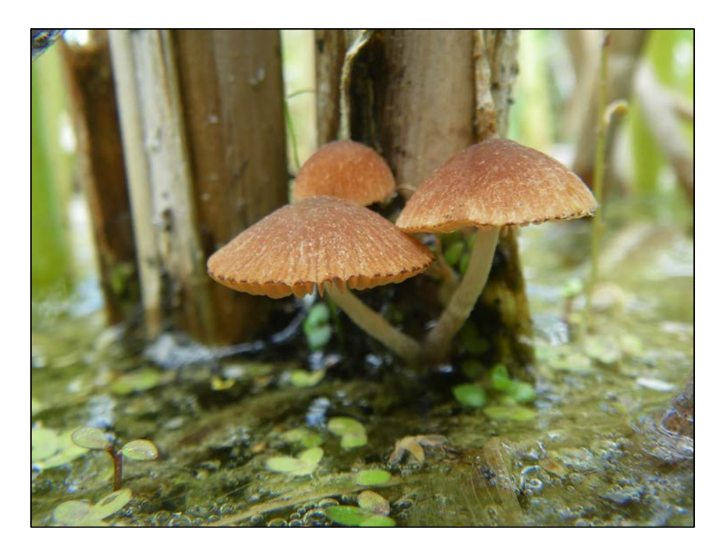
Fig. 15. Cat-tail Mushroom.