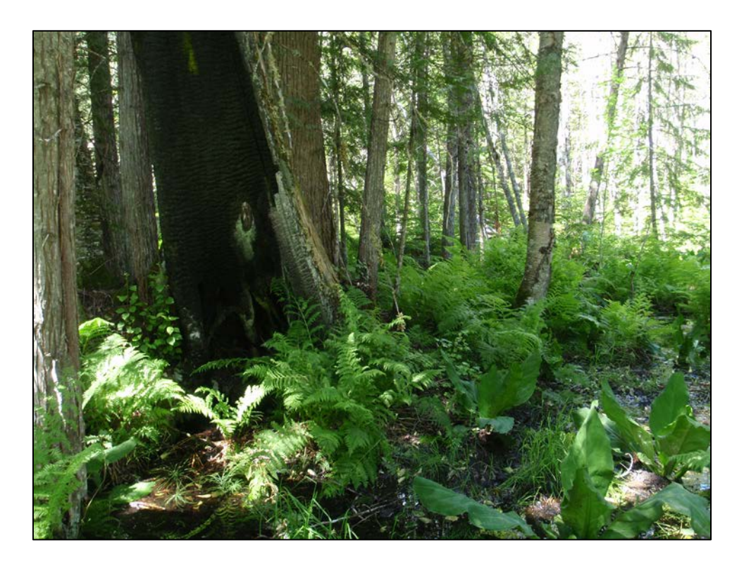
Fig. 4. Ws10 western redcedar – spruce – skunk cabbage forested swamp.

Forested swamp. A mature mixed forested swamp occurs on the western edge of the complex (Fig. 4). It is classified as a Ws10 (western redcedar – spruce – skunk cabbage) swamp which is considered regionally rare (not tracked by the CDC¹) by the local MFLRO Forest Ecologist, especially mature stands. In the Slocan Watershed, mature Ws10 swamps were only found north of Slocan Lake and were limited to small fragments. The Ws10 swamp that occurs in the Bonanza Complex is one of the larger and more intact examples of this wetland type in the watershed.