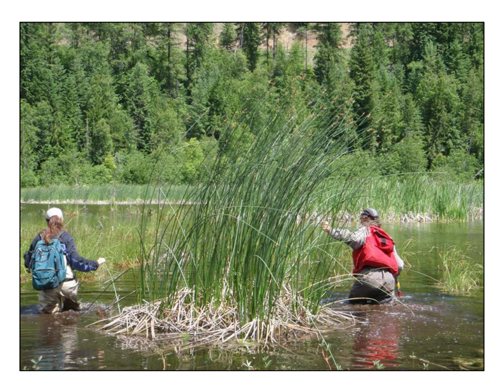
Fig. 7. Hard-stemmed bulrush deep marsh.

Bulrush marsh. Small areas in wetter portion of the complex contain a Wm06 (hard-stemmed bulrush Deep Marsh) marsh (Fig. 7). This ecosystem type is considered to be blue-listed in most of the province, but is not currently tracked in the Interior Cedar Hemlock subzone in which is occurs (ICH dw1). The Bonanza Complex was the only place in the Slocan Watershed where it was observed. It occurs as small patches in the wettest portions of the wetland complex, where it is permanently flooded by deep waters.