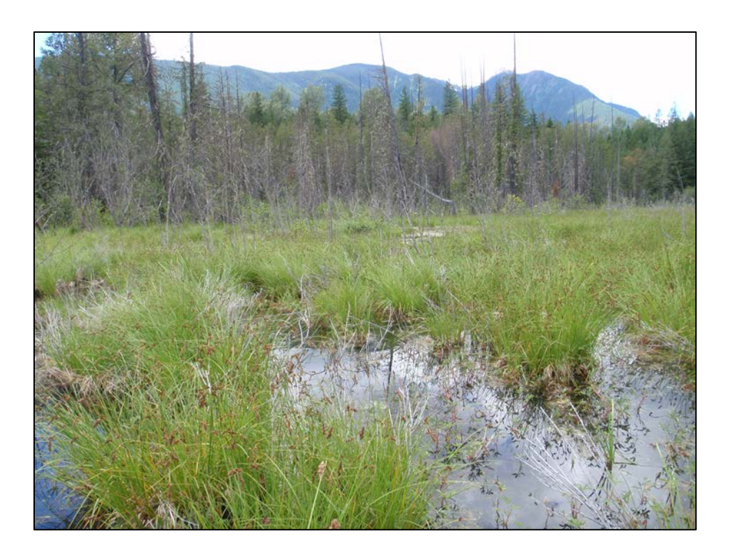
Fig. 8. Cusick's sedge marsh.

Cattail marsh. The Wm06 (Cattail) marsh occurs as a fringe along disturbed portions of the complex, and as large expanses in mid to deeper water areas (Fig. 9). This ecosystem type is considered to be blue-listed in most of the province, but is not currently tracked in the Interior Cedar Hemlock subzone in which is occurs (ICH dw1). This type of marsh is regionally uncommon, with only six mapped in the Slocan Watershed to date. It typically occurs in highly modified areas (such as old fields, dug out ponds, and modified areas).