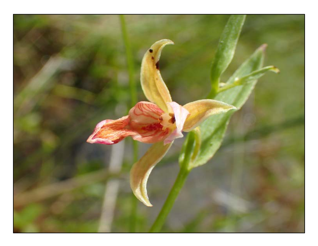
Fig. 12. Giant Helleborine.

A sizeable population (several hundred individuals) of giant helleborine ( Epipactis gigantea ) was found by Tyson Ehlers in the Bonanza Complex in July, 2015 (Fig. 12). The population covered an area of roughly 0.25 hectares with regularly spaced flowering individuals. The population is considered to be viable and stable with no immediate threats. It is restricted to a fen in the southeast corner of the complex. No other similar habitat is known in the complex, or in the larger watershed, therefore it is expected that this is the only element occurrence of this species. This species is known from several element occurrences on the Kootenay Lake, the closest of which is over 60km away. There are 34 known occurrences of the species in the province, including many historic records that are likely extirpated (BC CDC, 2015).