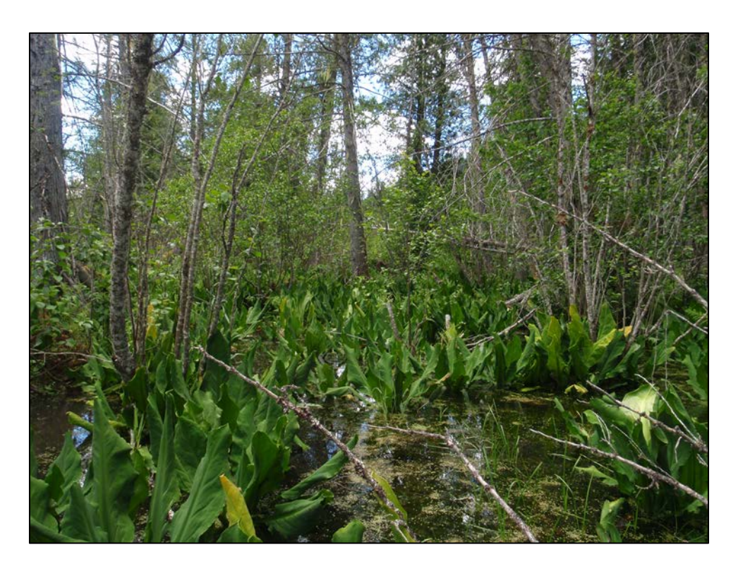
Fig. 5. Ws01 mountain alder – skunk cabbage – lady fern swamp.

Alder skunk cabbage swamp. The wetter portion of the treed swamps (west side of the complex) contains a Ws01 (mountain alder – skunk cabbage – lady fern) swamp (Fig. 5). This wetland type is one of the most common swamp types in the interior of BC, and is found extensively throughout the Slocan Watershed. Based on the occurrence of dead or stressed western redcedar that occur in this swamp, water levels have likely been modified in the last 10 - 20 years resulting in what may be a seral (or temporary) state that may progress towards a cedar dominated Ws10 swamp in the future.