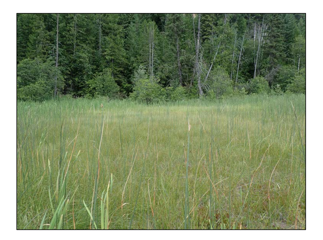
Fig. 10. Unclassified fen (R. Durand Photo).

occur in direct proximity to deep water marshes). While some of the transitional areas to the south and east of the fen were historically modified (old roads, ditches and logging), and marsh species are encroaching from the west and north, the fen in in good condition and appeared to be stable.