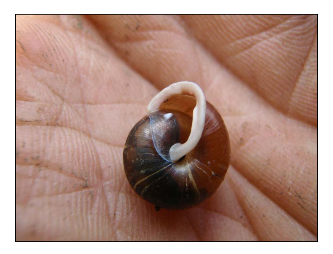
Fig. 14. Coeur D'Alene Oregonian (R. Durand photo).

It is likely more widespread than current records indicate, as 9 new locations were found in 2015 during SWAMP field work.