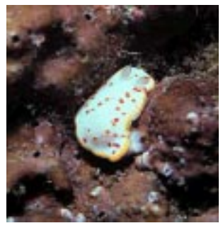
Fig. 6 N. haliclona