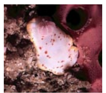
Fig. 7 N. haliclona