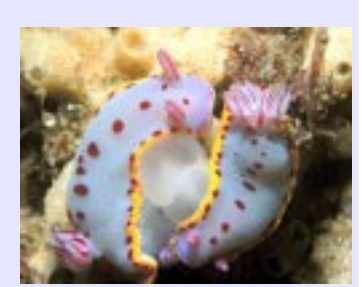
Fig. 4 H. bennetti