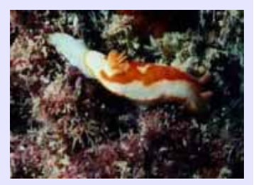
Fig. 3 C. splendida