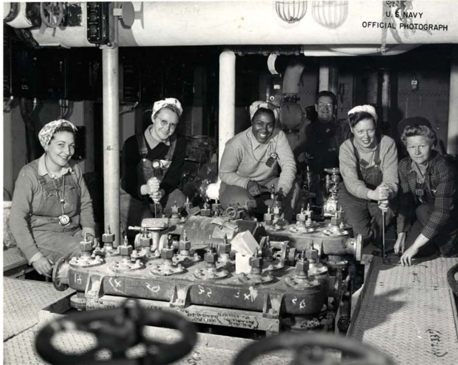
RG181 mare island shipfitters box 60-300pdi