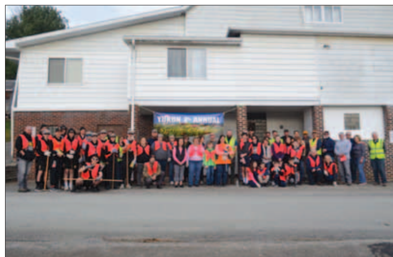
More than 70 volunteers met at the Yukon Slovenian Hall on March 19 to participate in the eighth Annual Yukon Spring Cleanup sponsored by Silverstars Lodge 729.