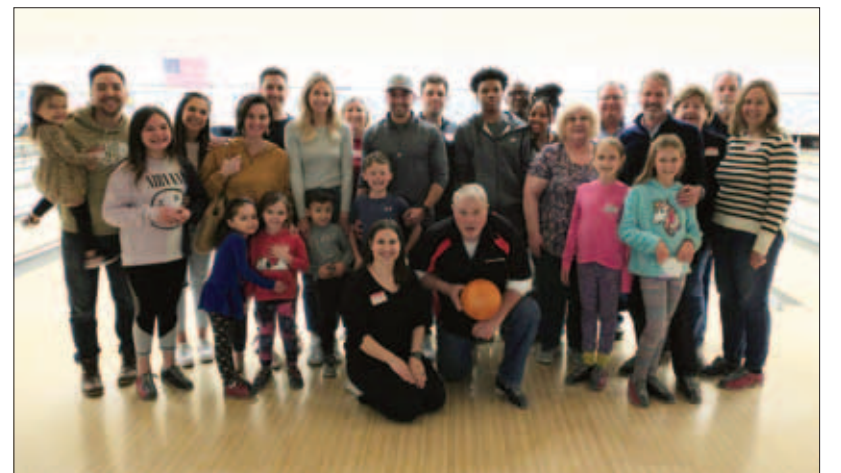
SNPJ Lodge 142 and Youth Circle 94 members headed to Wickliffe Lanes for some bowling fun in April.