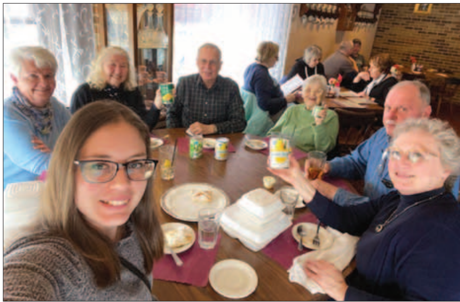
During their March meeting, Pioneer Lodge 559 members conducted a food drive to benefit the food pantry at St. Cletus. The Lodge will host another food drive at the May meeting.

We are saddened to report the loss of our longtime Lodge recording secretary and former SNPJ National Secretary