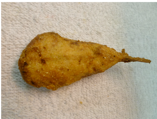
Fried and ready to eat - Photo by Dan Gill

BlowToad is scheduled to open in early January and Jimmy plans to serve toads as an appetizer when available. Jimmy told me that he often has to instruct customers on the proper way to eat them: The uninitiated will usually try to start from the end like a corn dog and consequently bite through the central backbone, or try to be cultured and use a knife and fork — leaving the sweetest meat behind. Just pick them up with your fingers like you would a chicken drumstick and nibble from the sides as you would an ear of corn, then suck the last sweet, tender morsels from between the bones.