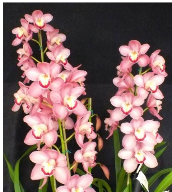
Cymbidium Asilomar 'Wilson's Choice' AM-AOS, CCM-AOS, 86 points, Synea Tan.