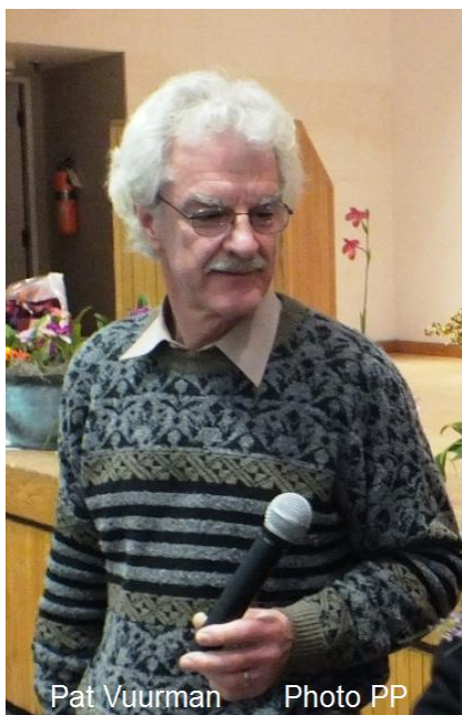
Pat Vuurman Photo PP

Next Meeting Sunday, March 9 , in the Garden Hall ( NOT the Floral Hall ) at the Toronto Botanical Garden, Sales 12 noon, Cultural Snapshots with Wayne Hingston at 12.15 pm, Introduction to Orchids and Watering (See the schedule elsewhere in the newsletter).