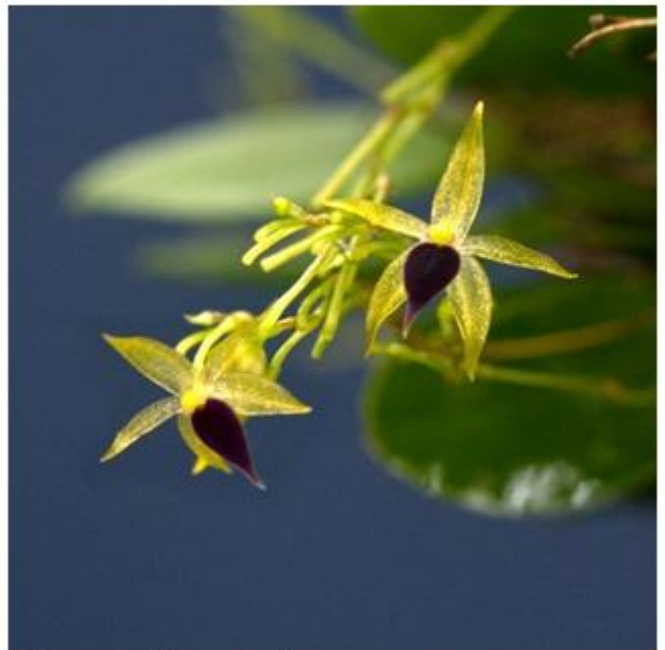
Platystele propinqua Photo: Jose Portilla, Ecuagenera, OW 11.2