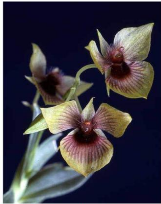
Telipogon setosus 'Jo' CHM-AOS