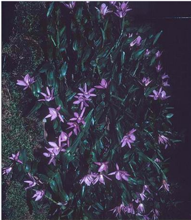
Epidendrum mirabile 'Jardin botanique de Montréal'

CCM-AOS, Photo: Jean Troalen, Orchids Plus v. 1.2