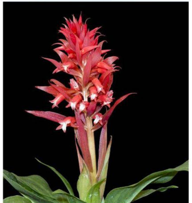
Stenorrhynchos glicensteinii 'MVO Leon' CHM-AOS