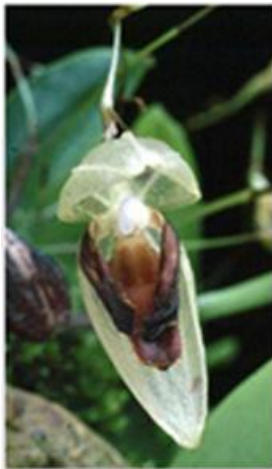
Pleurothallis janetiae 'J&L' CHM-AOS, O+ 1.2