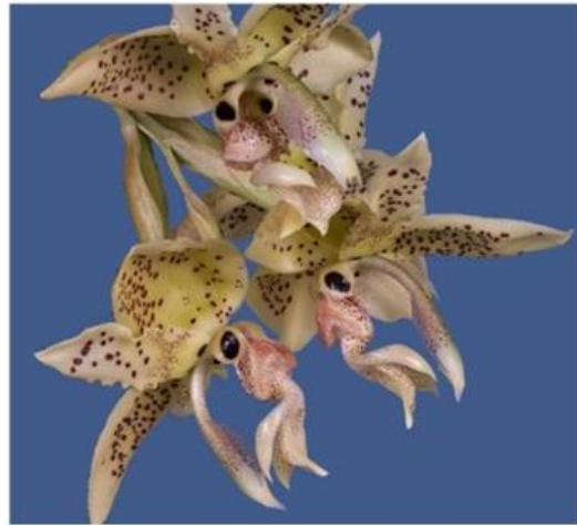
Stanhopea gibbosa 'Dona Felicia' AM-AOS

OW 11.2