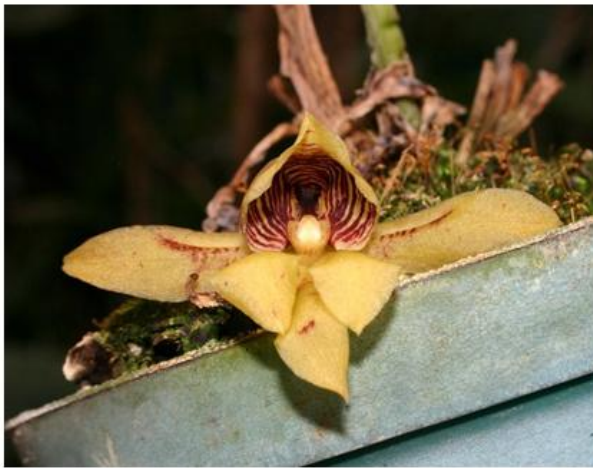
Chaubardiella subquadrata Photo: Patricia Harding, OW 11.2