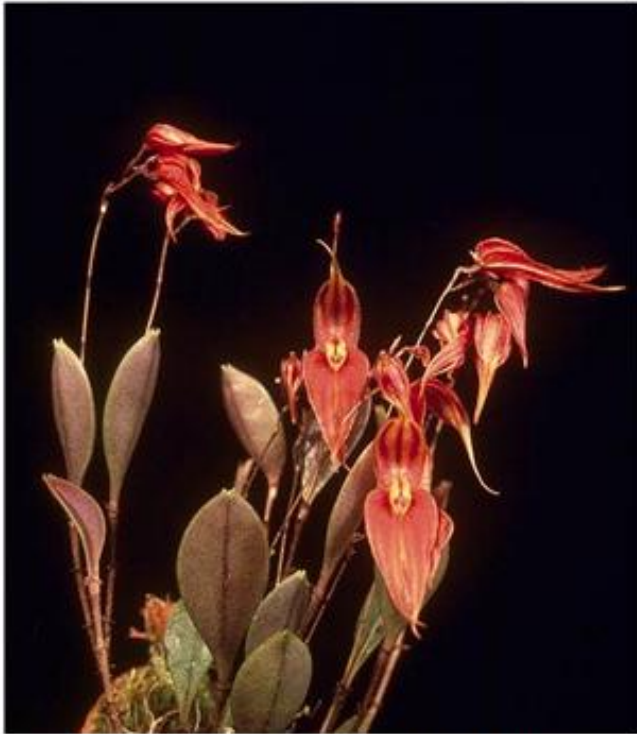
Lepanthes horrida 'Rojohn' CBR-AOS

Pictures of Some of the plants discussed by our speaker at our September meeting. Please note that the names on these pictures have not been verified in some cases. These are not the pictures used by our speaker.