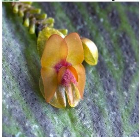
Lepanthes mystax Photo: Ecuagenera's Jose Portilla, OW 11.2