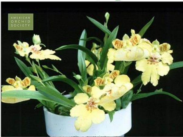
Erycina crista-galli 'Sunfire' HCC, CCM-AOS