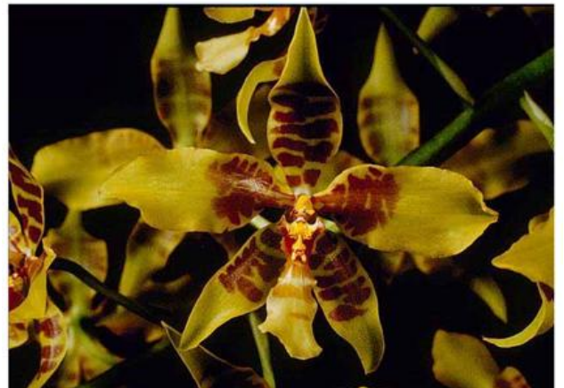
Rossiglossum schlieperianum 'Robustin' AM-AOS