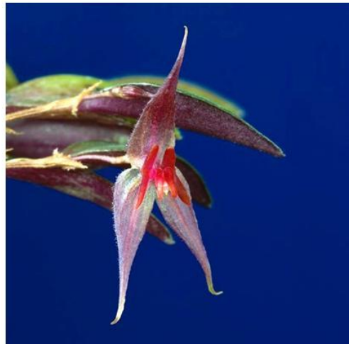
Lepanthes grandiflora Photo: Ecuagenera's Jose Portilla, OW 11.2