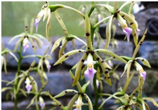
Prothechea prismatocarpa