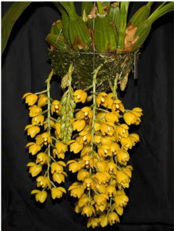
Acineta chrysantha 'NYBG' CCM-AOS