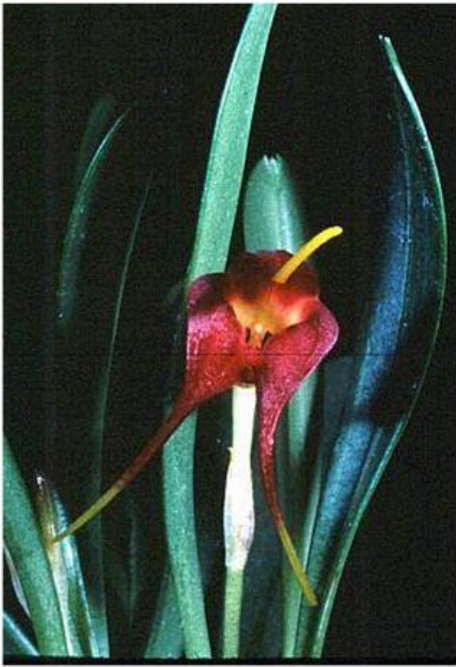
Masdevallia rolfeana 'D&B' AM-AOS