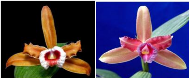
Sobralia atrorubescens from Ecuagenera