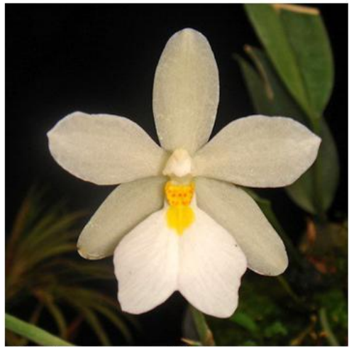
Ticoglossum oerstedii Photo: Ecuagenera's Jose Portilla, OW 11.2