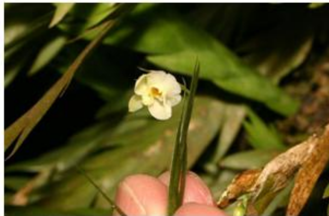
Lockhartia hercodonta Photo: Patricia Harding, OW 11.2