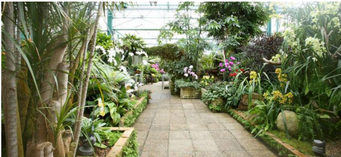
The Display house At the Eric Young Foundation

Next Meeting Sunday, October 4 , Floral Hall of the Toronto Botanical Garden,