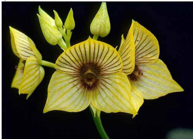
Telipogon leila-alexandrae 'Keith' CBR-AOS