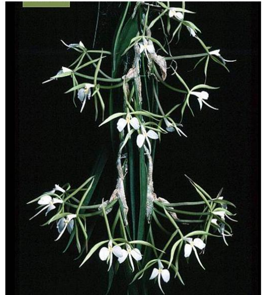
Epidendrum parkinsonianum 'Las Lomas' CCM-AOS

CCM-AOS