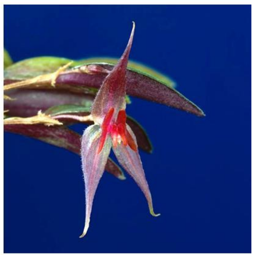
Lepanthes grandiflora Photo: Ecuagenera's Jose Portilla, OW 11.2