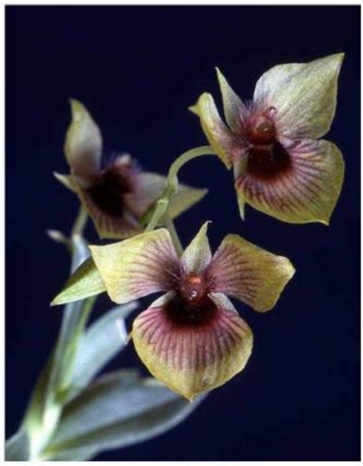
Telipogon setosus 'Jo' CHM-AOS