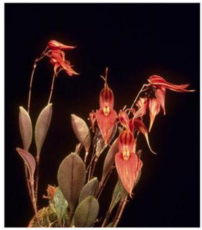
Lepanthes horrida 'Rojohn' CBR-AOS

Pictures of Some of the plants discussed by our speaker at our September meeting. Please note that the names on these pictures have not been verified in some cases. These are not the pictures used by our speaker.