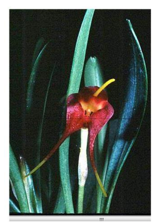
Masdevallia rolfeana 'D&B' AM-AOS