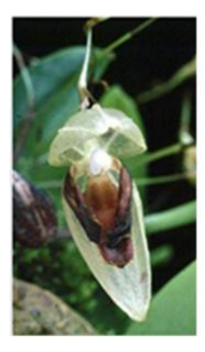
Pleurothallis janetiae 'J&L' CHM-AOS, O+ 1.2