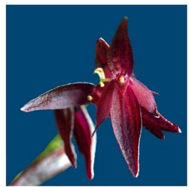
Pleurothallis rowleei OW 11.2