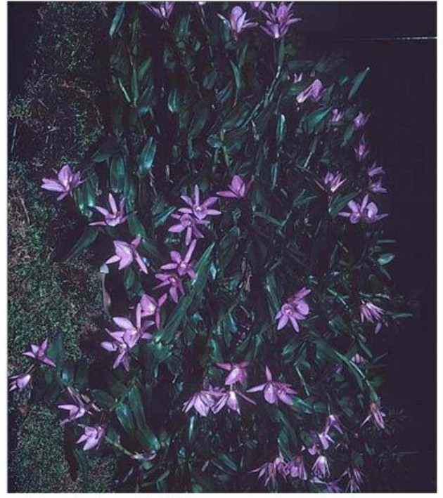
Epidendrum mirabile 'Jardin botanique de Montréal' CCM-AOS