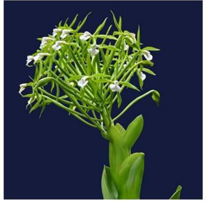
Epidendrum lacustre Photo: Ecuagenera's Jose Portilla, OW 11.2