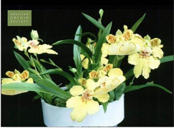
Erycina crista-galli 'Sunfire' HCC, CCM-AOS