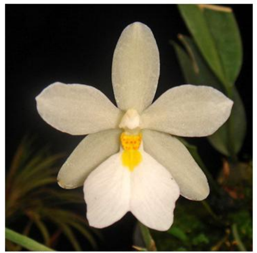
Ticoglossum oerstedii Photo: Ecuagenera's Jose Portilla, OW 11.2