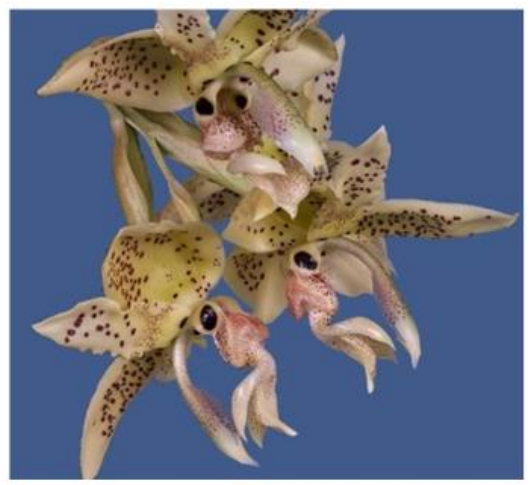
Stanhopea gibbosa 'Dona Felicia' AM-AOS