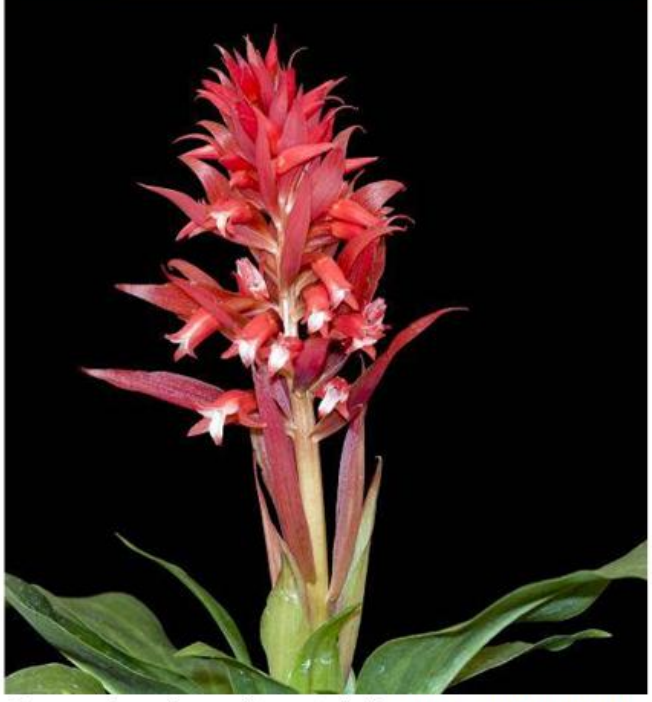
Stenorrhynchos glicensteinii 'MVO Leon" CHM-AOS