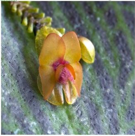
Lepanthes mystax Photo: Ecuagenera's Jose Portilla, OW 11.2