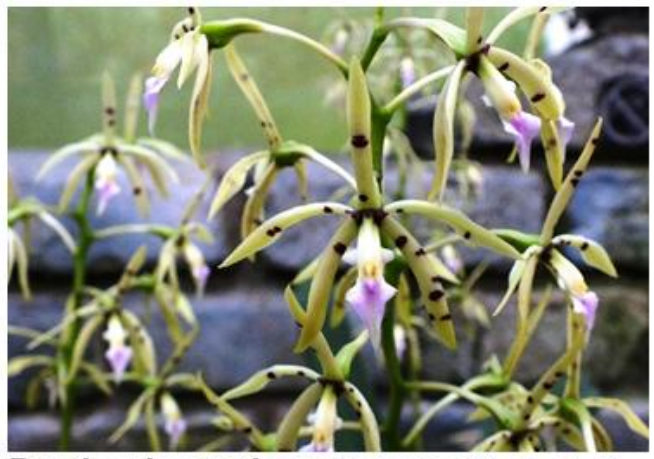
Prothechea prismatocarpa