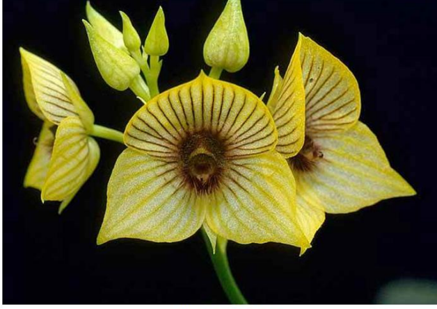
Telipogon leila-alexandrae 'Keith' CBR-AOS