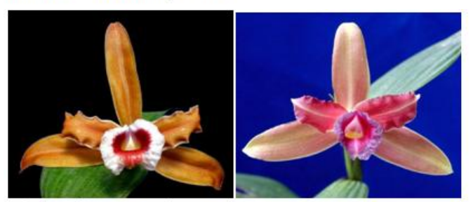
Sobralia atrorubescens from Ecuagenera Photo: Jose Portilla, Ecuagenera, OW 11.2