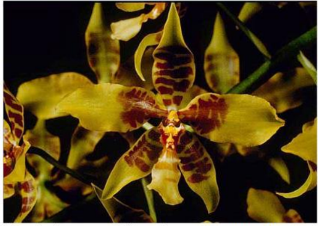
Rossioglossum schlieperianum 'Robustin' AM-AOS