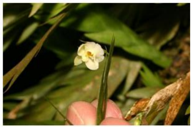
Lockhartia hercodonta Photo: Patricia Harding, OW 11.2