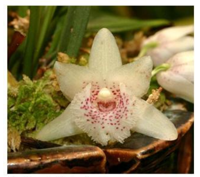
Kefersteinia lactea Photo: Patricia Harding, OW 11.2