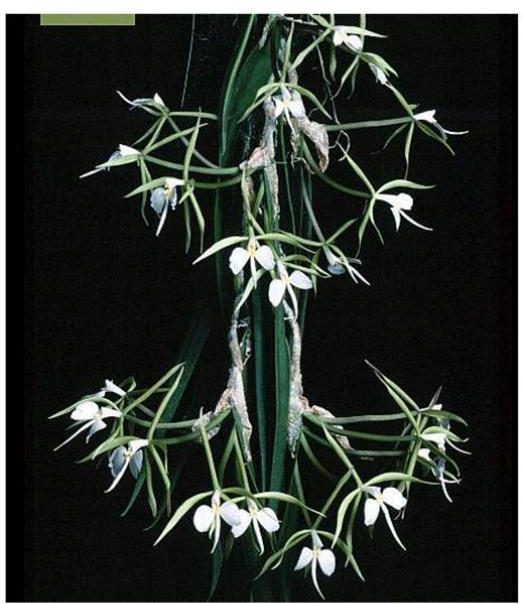
Epidendrum parkinsonianum 'Las Lomas' CCM-AOS