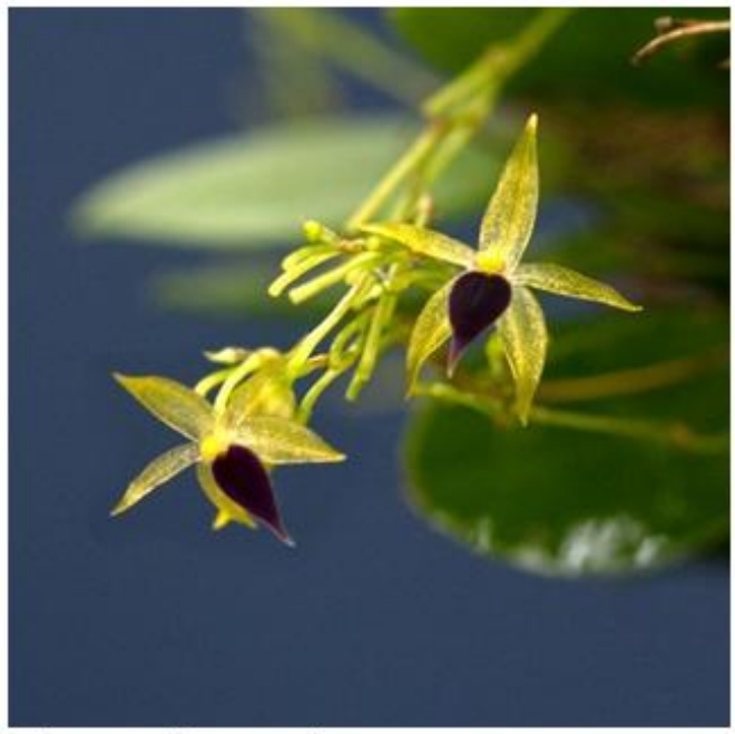
Platystele propinqua Photo: Jose Portilla, Ecuagenera, OW 11.2