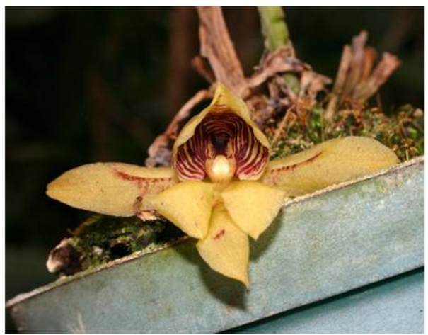
Chaubardiella subquadrata Photo: Patricia Harding, OW 11.2