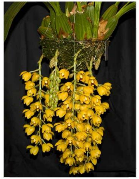
Acineta chrysantha 'NYBG' CCM-AOS