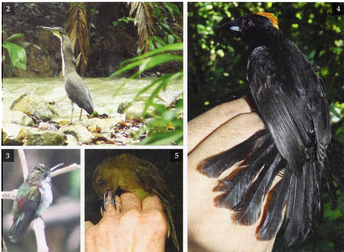
Figure 2. Fasciated Tiger Heron Tigrisoma fasciatum , Río Plátano Biosphere Reserve, Honduras, April 2009