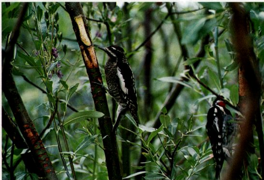
Figure 5. Juvenile female Red-naped Sapsucker visiting Well 3 on July 29. Adult male at bottom right.

The sapsucker family that worked Clump A consisted of an adult male (Fig. 3) and female and a juvenile male (Fig. 4) and female (Fig. 5). Only the adult sapsuckers created, maintained, and enlarged the wells. The juveniles foraged upon the sap thus provided and were also fed adult stoneflies, crane flies, and sap-soaked willow fibers procured by their parents. The average duration of the 80 timed visits to monitored wells by the adult male sapsucker was 49 seconds, while the adult female, timed on 43 occasions, spent an average of 51 seconds at monitored wells. The adults divided this time between feeding and hammering at the tops of the wells. The juvenile female, which spent most of its visit time feeding, averaged 52 seconds on 42 timed visits. No times were obtained for the juvenile male.