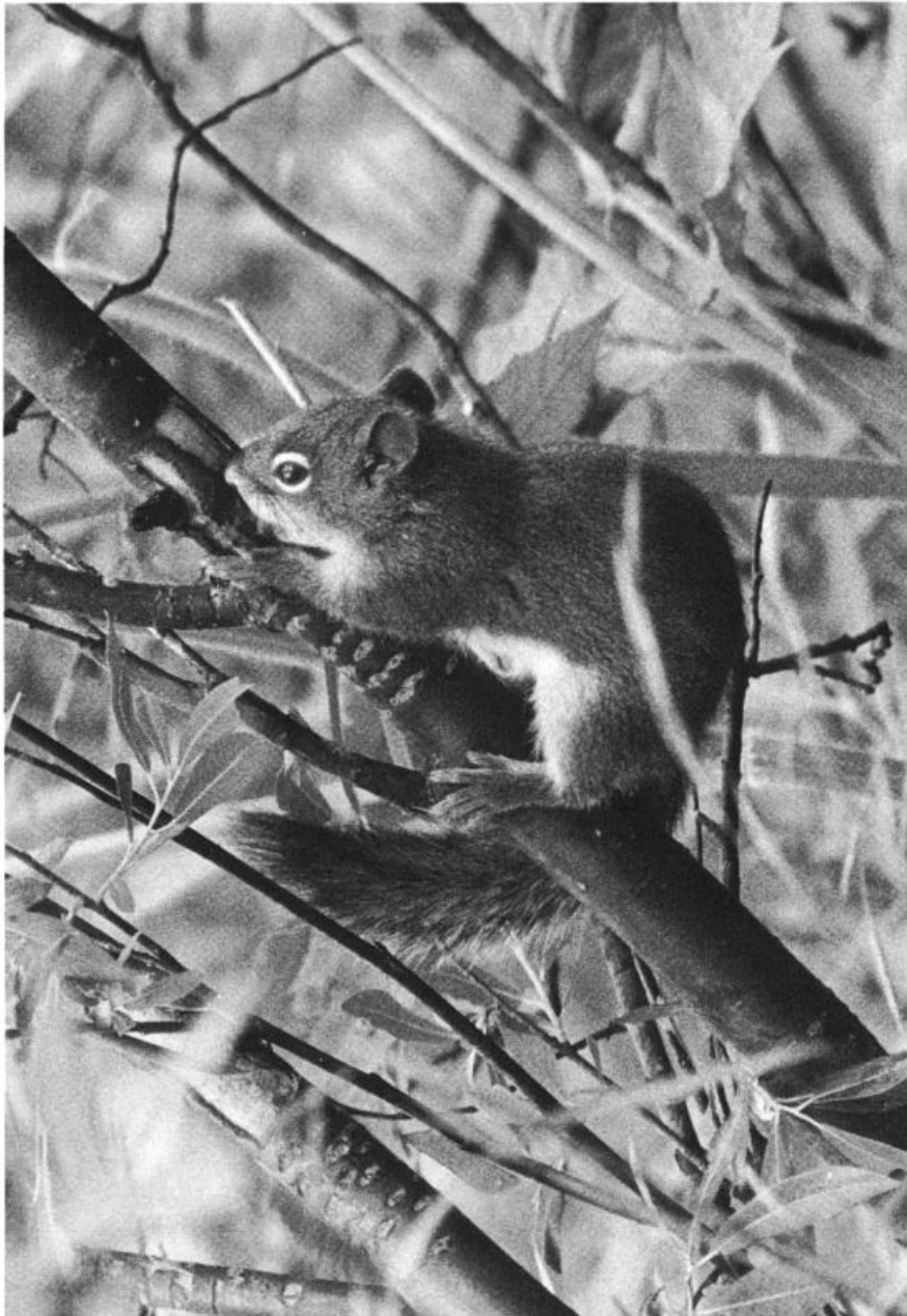
Figure 8. Red squirrel feeding at Well 4.

The impact of the Red-naped Sapsuckers on willow populations in the vicinity of Gothic is severe, probably greater than that of any other herbivore that feeds on the willows in the summer, but we have not been able to evaluate mammalian browsing in other seasons. Indeed, damage is so extensive that it might influence the longevity and dimensions of individual willow clumps. The willows do not appear to have evolved any chemical defenses against the sapsuckers, in spite of what appears to be a potentially strong selective pressure to do so. Perhaps the sapsuckers are able simply to avoid eating the por-