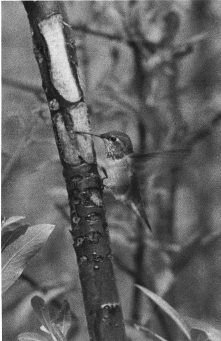
Figure 7. Juvenile male Rufous Hummingbird visiting Well 2 about July 28.

erage 20 minutes. The squirrel licked sap from the wells and stems in a manner similar to that of the chipmunks.