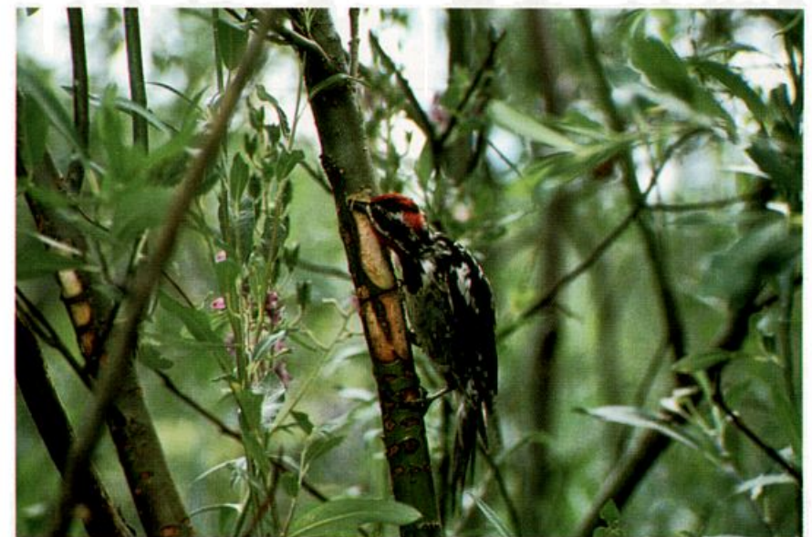
Figure 3. Top: Adult male Red-naped Sapsucker visiting Well 3 on July 29. Bottom: Same individual enlarging top of well.

damaged on average and 98 percent of the damaged stems were dead. All of the recent damage was clearly the result of sapsucker excavation—the well cavities were still sharply defined. However, some dead stems, estimated to be at least five years old, had decayed to a point where the agent of the damage could not be determined for certain.