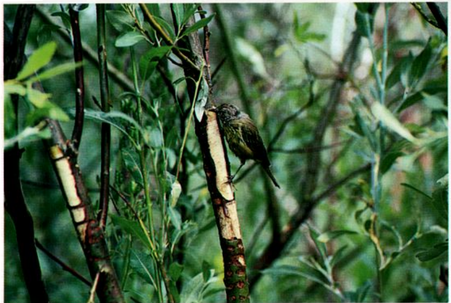
Figure 6. Orange-crowned Warbler visiting Well 2 on August 5.

Warblers were observed in the clump during 94 percent of our observation sessions. At least one individual was present 42 percent of the total observation time. The average visit length of 284 timed warbler visits to monitored wells was 18 seconds. Virtually all of this time was spent feeding where sap was most abundant—either from the top or from accumulations at the bottom of major wells. Warblers were found at the wells at virtually all times of day between 0545 hrs. and 2020 hrs.