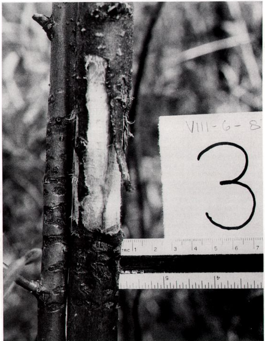
Figure 1. Well 3 on August 6. The bark between the active well (major excavation) and the adjacent excavation has been pulled loose (see unfused excavations in Figures 3–5). Note also the exploratory drillings below the main excavation and on the adjacent branch.

Sapsuckers, which create "wells" in the bark of trees and shrubs from which sap flows (Tate 1973), similarly provide other herbivores with access to a resource. The sap is an important component of the diet of sapsuckers, and the use of the wells as a source of nourishment by insects, mammals, and other birds is well known (e.g., Bolles 1891; Batts 1953; Kilham 1953; Kilham 1958; Foster and Tate 1966; Miller and Nero 1983). Much of the literature on sapsucker foraging behavior and interactions with guests has been based on Yellow-bellied Sapsuckers ( Sphyrapicus varius ) and on the use of trees as a sap source. Here we describe the behavior of Red-naped Sapsuckers ( S. nuchalis ) drilling wells in shrubby willows, their impact on the willows, and their rela-