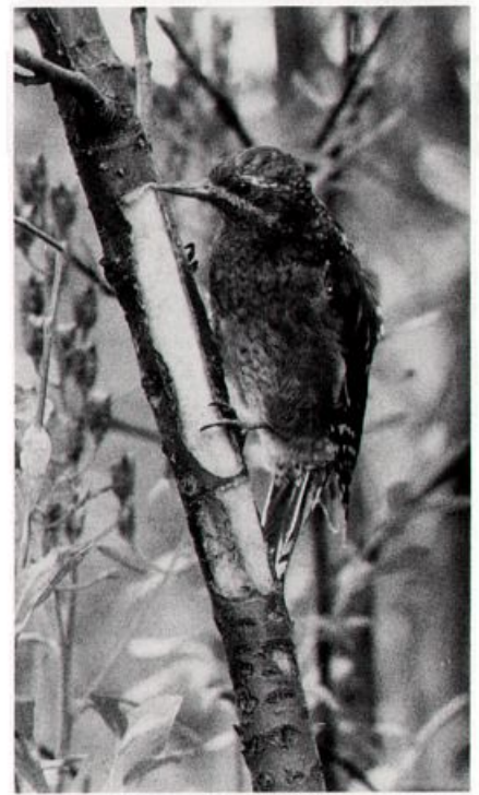
Figure 4. Juvenile male Red-naped Sapsucker visiting Well 3 about August 6. Note enlargement of the well from its size roughly a week before shown in Figure 5.

We made 97 successful sap measurements (there was not enough sap to get a reading in 22 attempts). The sugar content of the sap, expressed as sucrose, ranged from 7.0 (diluted by rain) to 48.5 percent (weight/weight) with a mean of 29.0 percent. The sugar concentration of the sap was consistently about 20 percent at each well in the early morning (before 0900 hrs.), as is typical of sieve tube exudate (Crafts and Crisp 1971). The concentration increased throughout the day as evaporation took place. Wells 1, 2, and 4 were highly correlated ( P < 0.05 in each case) in sap concentration. Well 3 did not correlate significantly with any other well. We found no significant difference between the mean sap concentration at the wells on mostly sunny versus mostly cloudy days. We also found that the amount of sap varied independently of cloud cover (mostly sunny versus mostly cloudy).