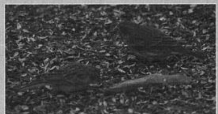
This Purple Finch at Lamar, Colorado 7 December 2004 was one of a record-high 18 reported in the Colorado & Wyoming region in winter 2004–2005.