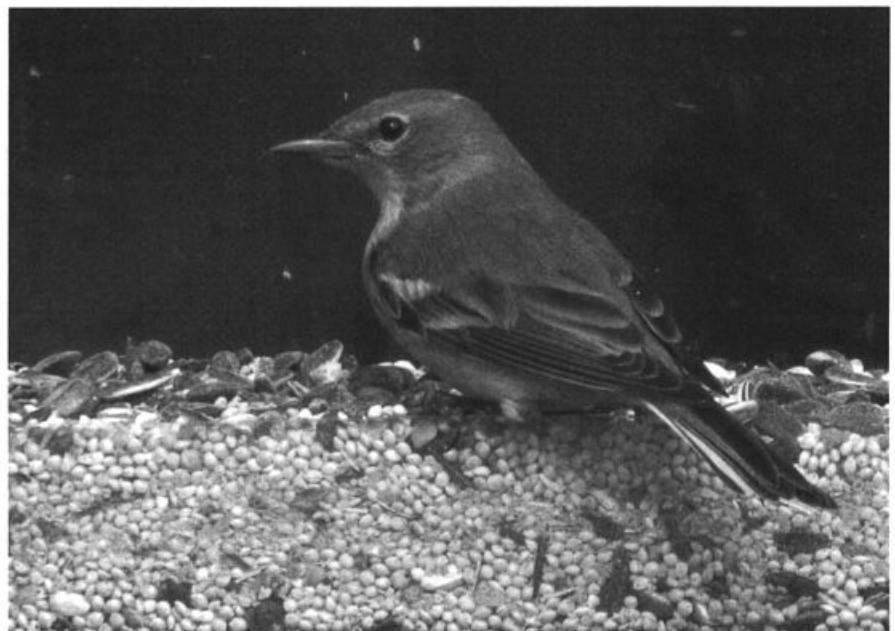
This male Pine Warbler provided welcome winter color at a feeder in Golden, Colorado 7 January–19 (here 12) February 2005.