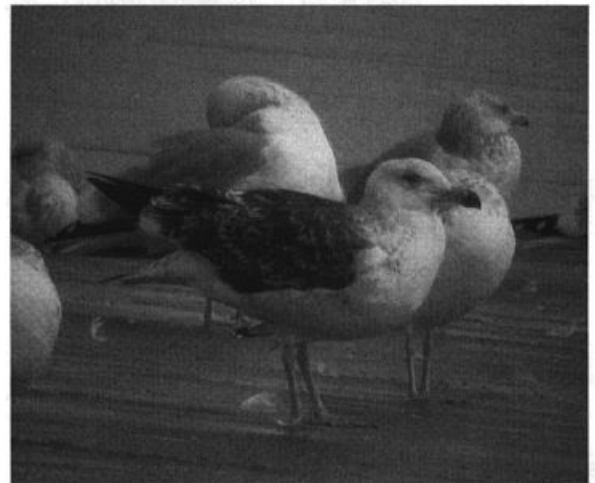
Great Black-backed Gulls made a record ten appearances this winter in Colorado, including this second-winter bird at Cherry Creek Reservoir 12 February 2005.