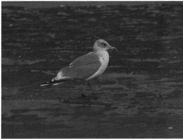
In four-year gulls, third-year ("third-cycle") plumages are the rarest, so, though the species is not a rarity in Colorado, this Thayer's Gull provided a rare opportunity to document this uncommonly seen plumage.

ed Geese, the numbers wintering in Colorado this year were higher than usual, with the highest count of individuals known to have wintered being the returning flock at Cañon numbering 13 (m.ob.). The 26 and 14 at Jumbo Res., Logan/Sedgwick and Haxtun, Phillips, respectively, on 25 Feb were probably early spring migrants (JK, R. Olson, GW). Counts of wintering Chen in the Arkansas River valley seemed lower than usual, though spring migrants were noted early, with 5000 passing northward over Yuma 5 Feb (G. Goodrich) and 1900 Snow Geese and 100 Ross's Geese at Haxtun 20 Feb (TL). The large fall flight of (and observers' intense attention to) Cackling Geese this fall carried over into winter, as the species was found widely on Christmas Bird Counts in Colorado, with many birds staying throughout the winter. The goose highlight of the winter was a first-winter Black Brant found at Inverness on the Arapahoe/Douglas line 18 Feb; it stayed into