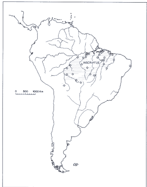
FIG. 1. Distribution of Pteroglossus incriptus , an aracari likely to have reached eastern Brazil by a northern route (after Haffer 1974).

Northern-crossing widespread species. Of the 870 species of east-Brazilian birds under consideration (647 when the 57 water and 166 open-zone species are excluded), 8 scrub, mangrove and coastal birds probably came along the coast, via existing habitat: Nycticorax violaceus , Eudocimus ruber , Buteogallus aequinoctialis , Rallus longirostris , Aramides mangle , Columbina passerina ,