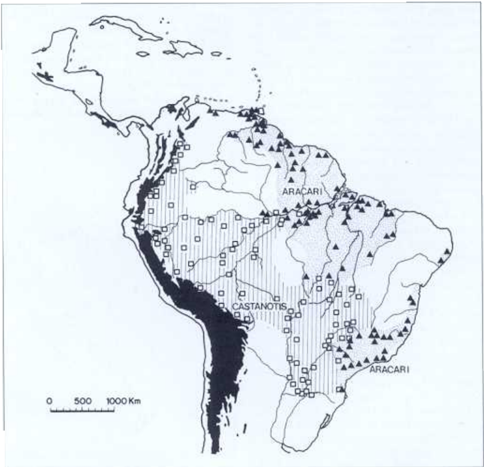
FIG. 2. Distribution of Pteroglossus aracari and P. castanotis . Related toucanets that probably reached eastern Brazil by different routes (after Haffer 1974).

Teixeira et al. (1987) show that Cissopis l. leve-riana of northern Amazonia occurs in Alagoas,