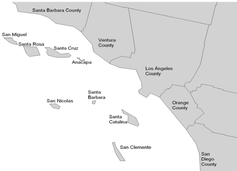
Figure 1. The California Channel Islands. San Clemente is the southernmost island, located approximately 90 km off the mainland.

like those of the nearby mainland than should the outlying islands (e.g., San Nicolas and San Clemente) (MacArthur and Wilson 1967, Brown and Gibson 1983). However, the degree of endemism on the Channel Islands is striking (Howell 1917, Diamond 1969, Johnson 1972). Of approximately 41 breeding landbirds on the Channel Islands, 32% (13 species) show effects of insular isolation. Twenty-one endemic subspecies have been described, typically characterized by coloration darker and bills larger than those of their mainland relatives, although the validity of some of these is doubtful or has been disproven (Johnson 1972; Table 1). Only one of the islands' endemic birds is currently ranked as a species, likely because the islands are continental rather than oceanic; that is, they lie too close to the mainland to have followed too independent an evolutionary path.