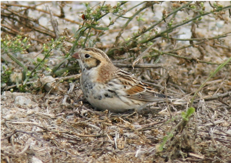
Figure 55. Lapland Longspur at VC3 21 November 2003.