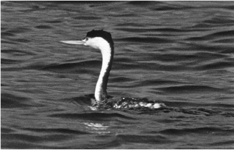
Figure 15. Clark's Grebe off Burns Canyon 12 October 2002.