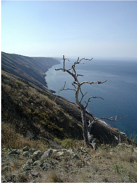
Figure 4. View north from Horton Canyon along San Clemente Island's east side.