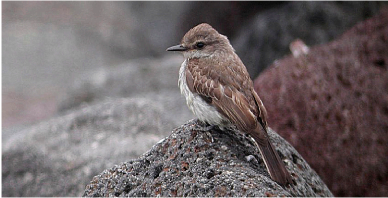
Figure 32. Female Vermilion Flycatcher at Horse Beach 29 September 2003.