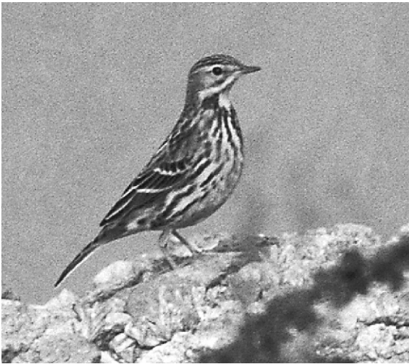
Figure 39. Red-throated Pipit at Lemon Tank 1 October 2002.