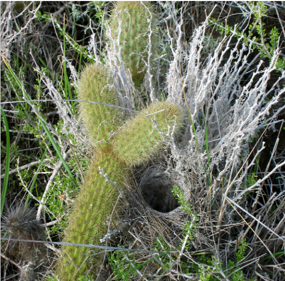
Figure 51. Sage Sparrow nest in Senecio at West Shore, March 2003.