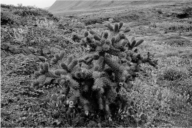
Figure 9. Cholla at Lost Point on San Clemente Island's southwest side, April 2002.