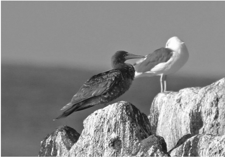
Figure 19. Juvenile Brown Booby at China Point 1 November 2003.