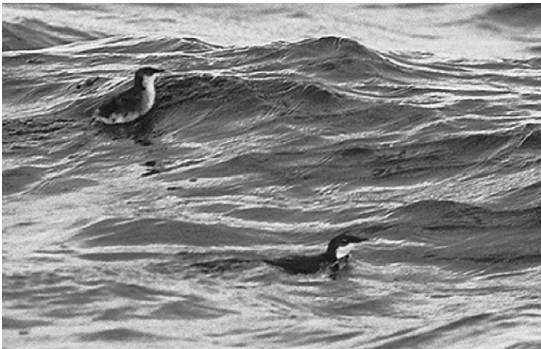
Figure 30. Xantus's Murrelet with downy chick off China Point 4 July 2001.

Peregrine Falcon ( Falco peregrinus ). †* Extripated breeder; rare migrant and winter visitor. Recorded primarily from 20 Sep to 19 Apr, exceptionally as early as 7 Sep (2001, one juvenile at Lemon Tank, BLS, AMC) and as late as 7 May (2002, one at West Cove Beach, ELK) and 10 May (2003, one at Box Canyon, RSAK). Formerly a rare resident (Breninger 1904, Mearns 1907, Linton 1908, Howell 1917). This