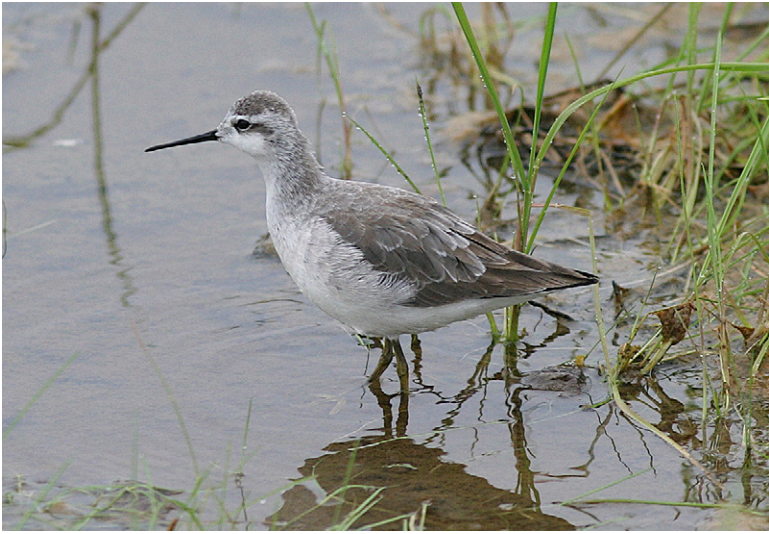
Figure 27. Wilson's Phalarope at a pond along REWS Road 1 April 2004.