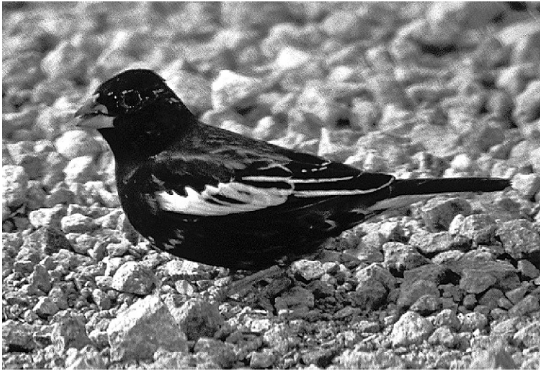
Figure 52. Male Lark Bunting at Northwest Harbor 24 May 2002.