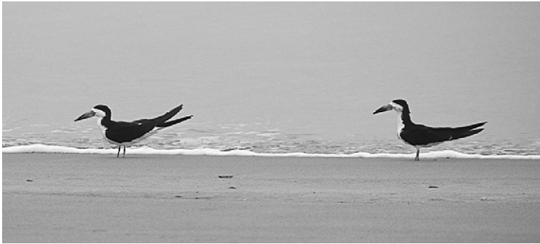
Figure 29. Black Skimmers (one banded) at Northwest Harbor 20 September 2002.