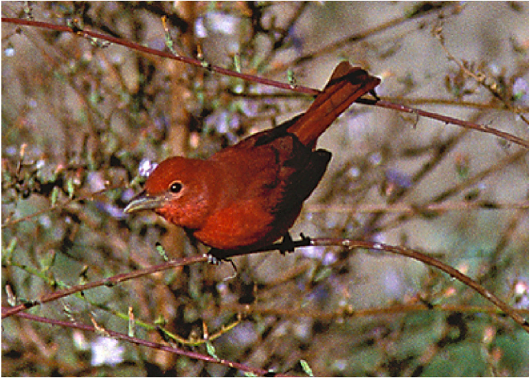
Figure 46. Male Summer Tanager at Lemon Tank 3 October 2002.