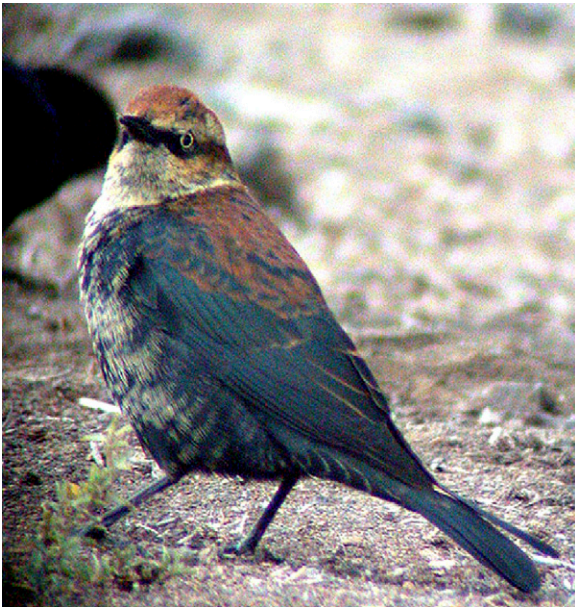
Figure 59. Rusty Blackbird at Lemon Tank 24 October 2002.