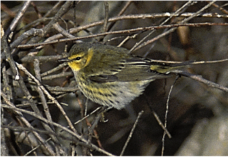
Figure 41. Female Cape May Warbler at Lemon Tank 20 October 2001.