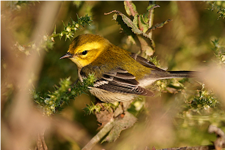
Figure 42. Black-throated Green Warbler at Wilson Cove 28 October 2003.