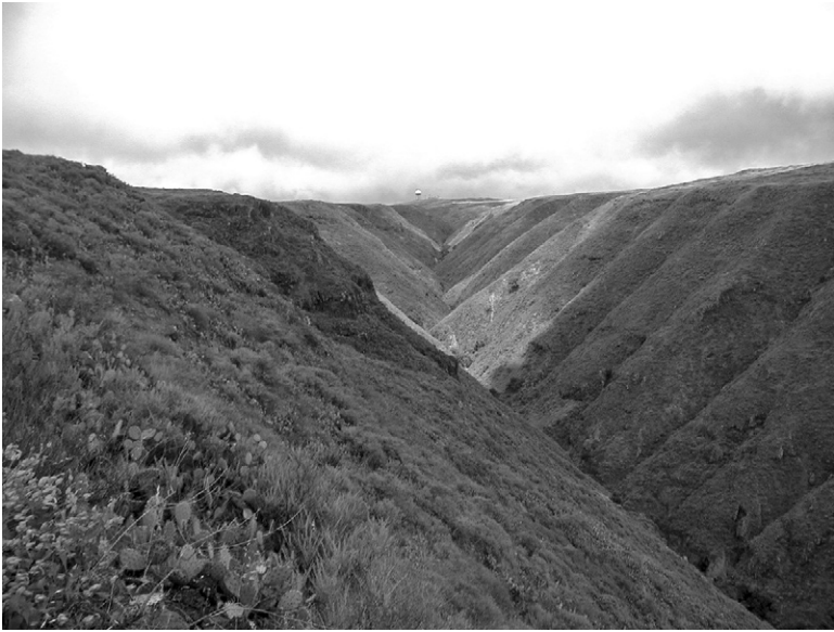
Figure 3. Horse Canyon, on San Clemente Island's southwest side; view to the east.