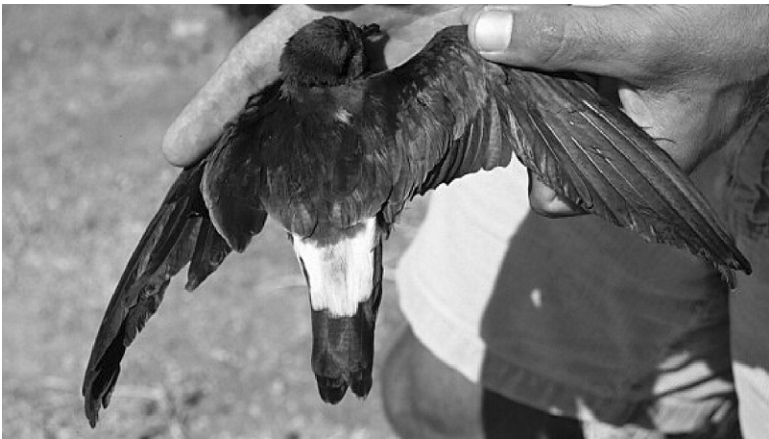
Figure 16. Leach's Storm-Petrel found above Bryce Canyon 13 July 2001.

White-tailed Kite ( Elanus leucurus ).* Casual breeder; rare migrant and winter visitor. Recorded year round, but most records are from October to January; migra-