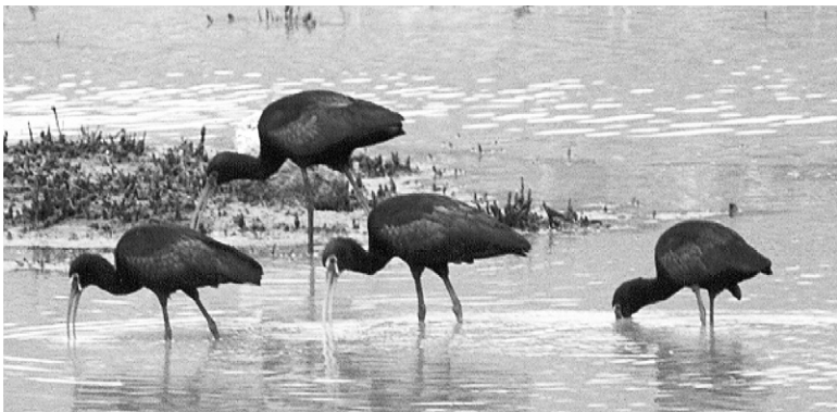
Figure 20. White-faced Ibises at Chad's Bluff 19 May 2001.

Northern Harrier ( Circus cyaneus ). * Uncommon fall migrant and winter visitor; rare in spring; casual in summer. Recorded in spring from 20 Feb to 25 Apr, in fall from 14 Aug to 30 Nov, and throughout the winter. Fall migrants typically show up in mid- to late Aug and continue through Nov, when it becomes difficult to separate