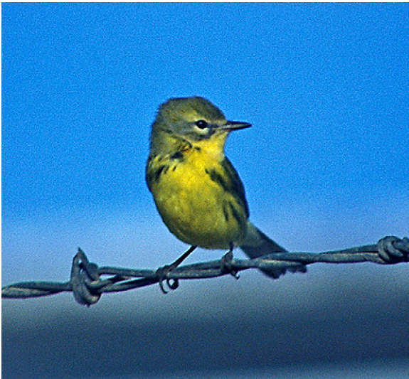
Figure 44. Prairie Warbler at Northwest Harbor 15 September 2002.