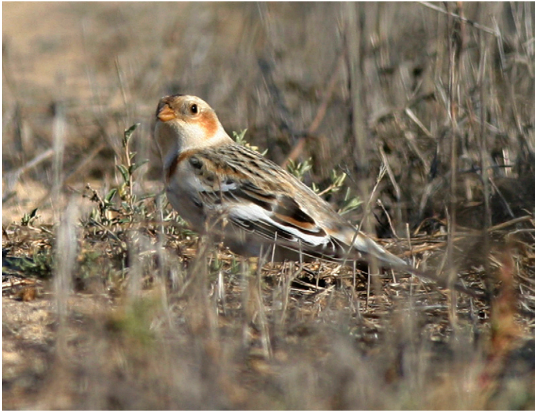
Figure 56. Snow Bunting at Lemon Tank 22 November 2003.