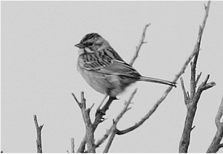
Figure 49. Probable hybrid Chipping x Clay-colored Sparrow at VC3 1 October 2004.