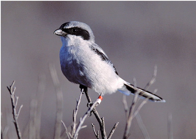
Figure 33. Adult Loggerhead Shrike at Lemon Tank, fall 2002.

Virginia Rail ( Rallus limicola ). Casual fall migrant. Two records: one in Wilson Cove Canyon 19 Sep 1975 (HLJ); one in Chenetti Canyon 7 Oct 2001 (BLS). Garrett and Dunn (1981) cited five records for the Channel Islands, presumably including the one for 19 Sep 1975. Subsequently, the Virginia Rail has been found breeding once at Prisoner's Harbor, Santa Cruz Island, and become known as a rare