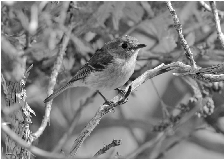
Figure 35. Hutton's Vireo in Canchalagua Canyon 13 June 2004.

Yellow-green Vireo ( Vireo flavoviridis ).+* Casual fall migrant. One record: a bird in fresh plumage at Lemon Tank 18 Sep 2002 (BLS et al., Figure 36; Cole and McCaskie 2004).