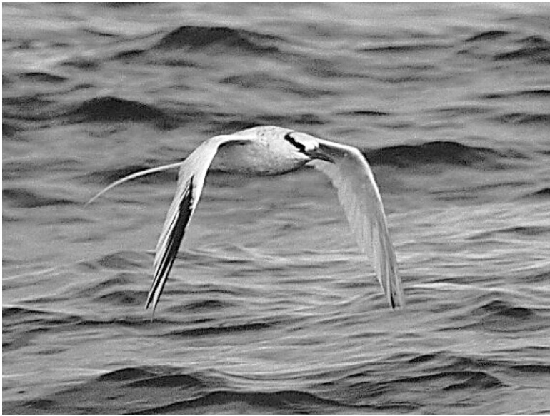
Figure 17. Adult Red-billed Tropicbird off China Point 29 July 2001.