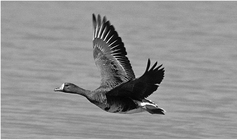
Figure 12. Greater White-fronted Goose at Lemon Tank, October 2002.