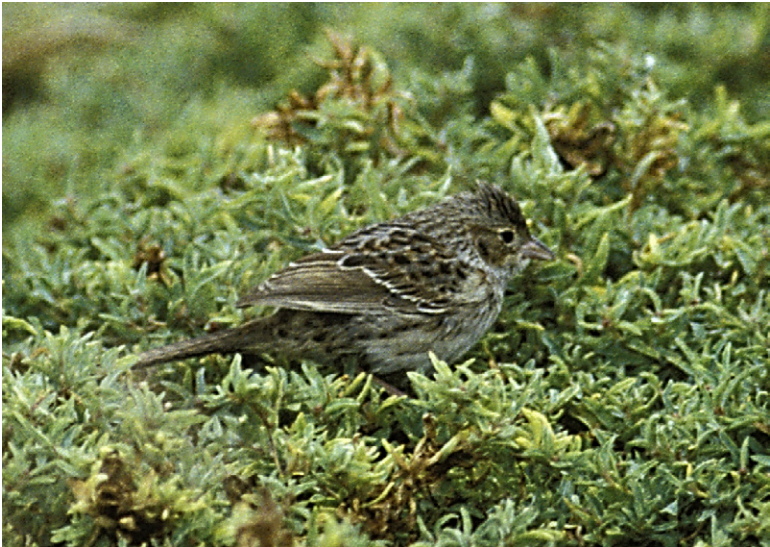
Figure 47. Cassin's Sparrow feeding on Atriplex seed near the airfield 2 November 2001.