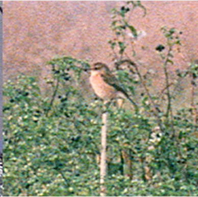
Figure 37. Stonechat at the Chad's Bluff ponds, 20–21 October 1995.