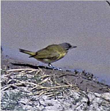
Figure 36. Yellow-green Vireo at Lemon Tank 18 September 2002.