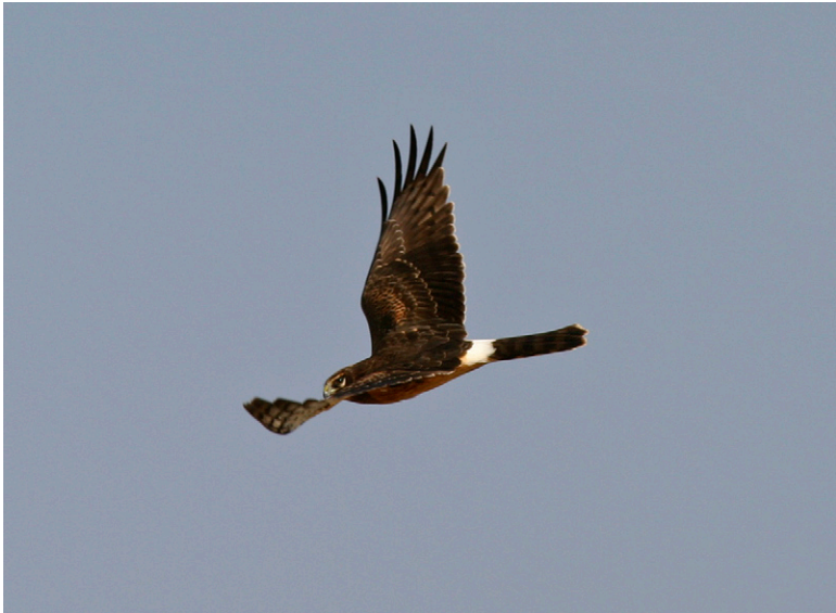
Figure 22. Immature female Northern Harrier at Lemon Tank 27 November 2003.