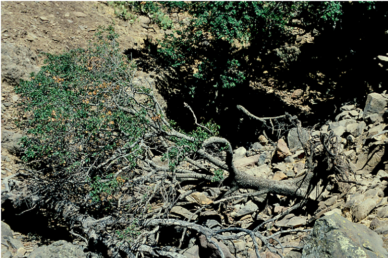
Figure 8. Classic “root perching” caused by erosion on San Clemente Island.