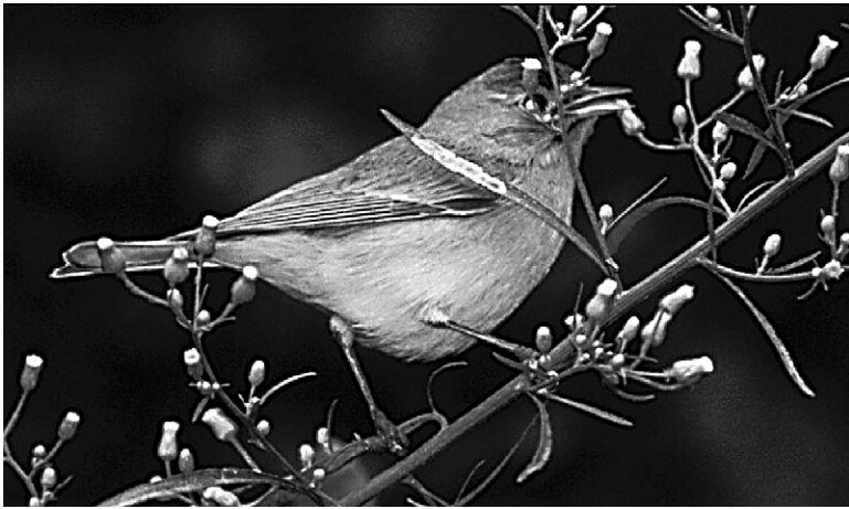
Figure 40. Lucy's Warbler at Lemon Tank 2 November 2001.