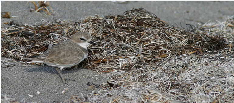
Figure 25. Snowy Plover at West Cove Beach, October 2003.