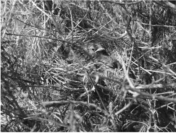
Figure 48. Chipping Sparrow nest in Canchalagua Canyon 13 June 2004.