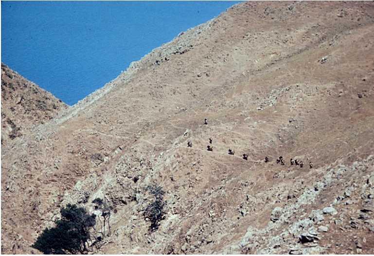
Figure 7. San Clemente Island circa 1970s, showing feral goats and lack of vegetation on canyon slopes.