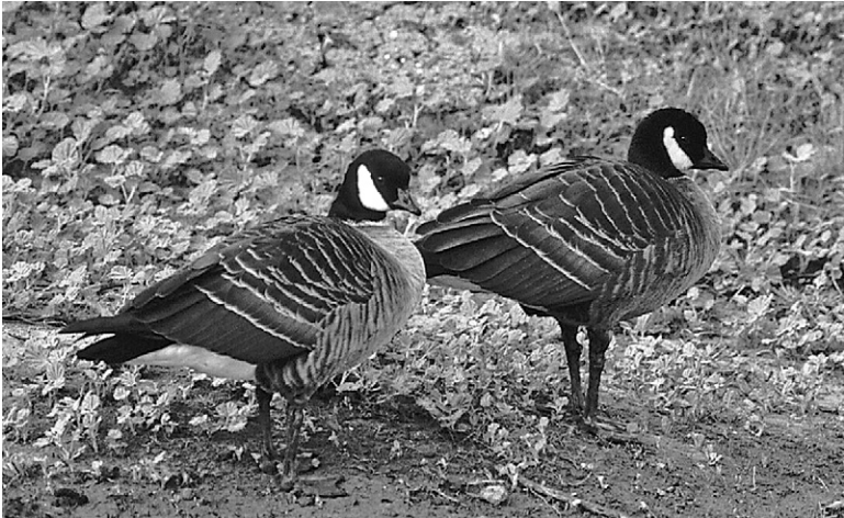
Figure 13. Cackling Geese, one B. h. leucopareia , one possibly B. h. minima , at Chad's Bluff 14 October 2001.