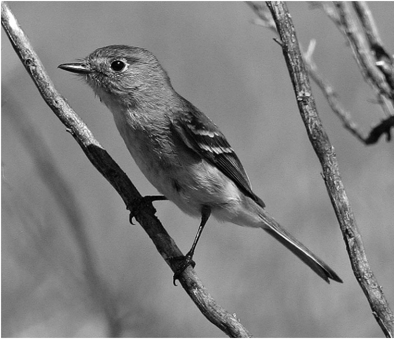
Figure 31. Dusky Flycatcher at Spanish Curve 23 April 2004.