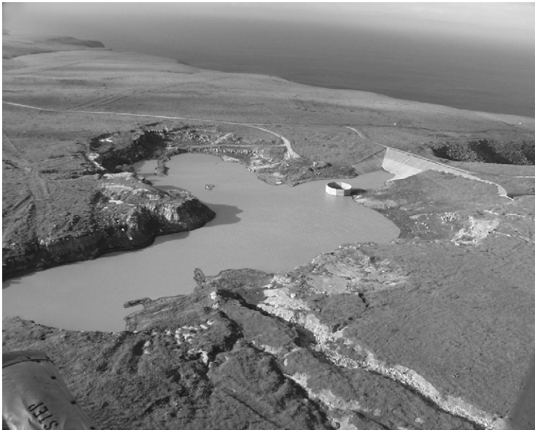
Figure 11. Lemon Tank, March 2003.