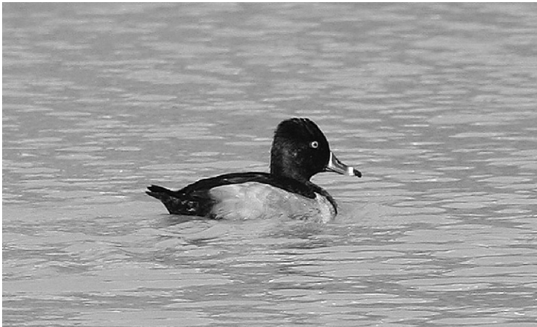
Figure 14. Male Ring-necked Duck at Lemon Tank 14 November 2003