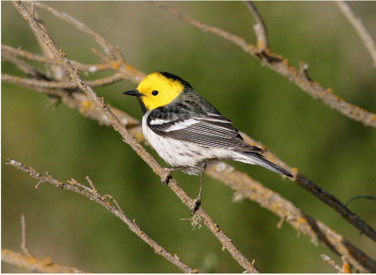
Figure 43. Hermit Warbler near Lemon Tank 25 April 2004.