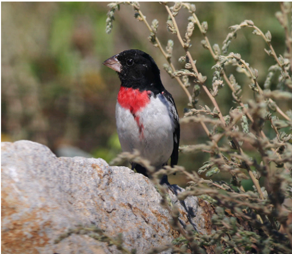
Figure 57. Male Rose-breasted Grosbeak on San Clemente Island 16 August 2004.