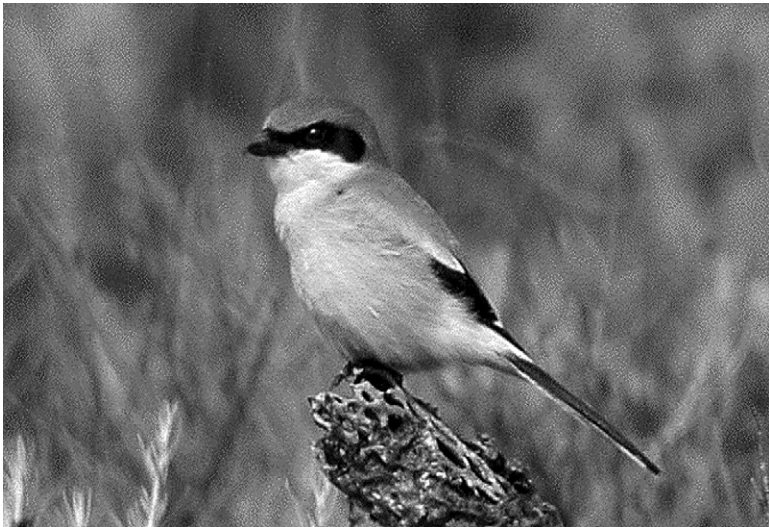
Figure 34. Adult male Loggerhead Shrike at China Canyon showing plumage features typical of Lanius ludovicianus mearnsi , March 2003.

Only two shrikes banded on SCI have been recovered elsewhere. Remains of one were found at a Peregrine Falcon aerie at a Least Tern ( Sterna antillarum ) nesting colony near Coronado, California, in 1994 (Everett et al. 1996); as Peregrine Falcons