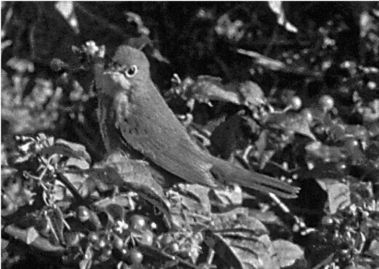
Figure 45. Canada Warbler at Lemon Tank 7 October 2001.