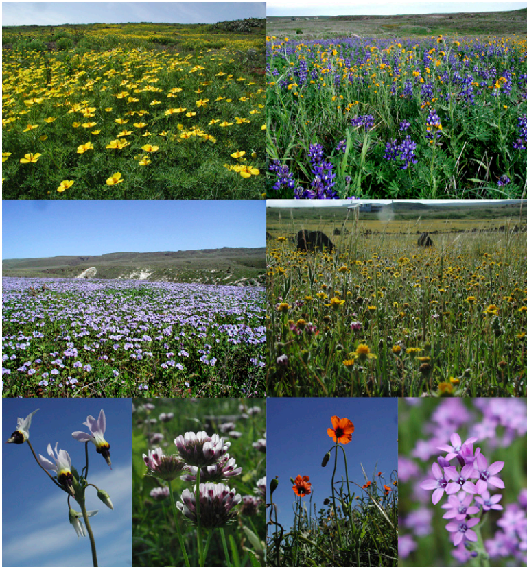
Figure 10. San Clemente Island wildflowers, from top right Eschscholzia ramosa (island poppy), Lupinus guadalupeensis (lupine) and Amsinckia menziesii (fiddleneck), Lasthenia californica (goldfields) and Trifolium sp. (clover), Gilia nevinii (Nevin's gilia), Stylomecon heterophylla (wind poppy), Trifolium willdenovii (clover), Dodecatheon clevelandii insulare (shooting star), Phacelia floribunda (San Clemente Island phacelia).