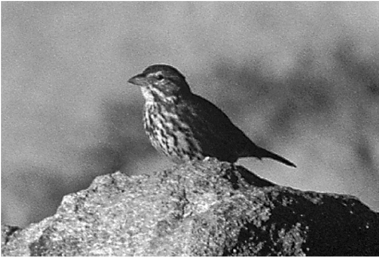
Figure 53. Large-billed Savannah Sparrow on West Cove Point 7 October 2002.