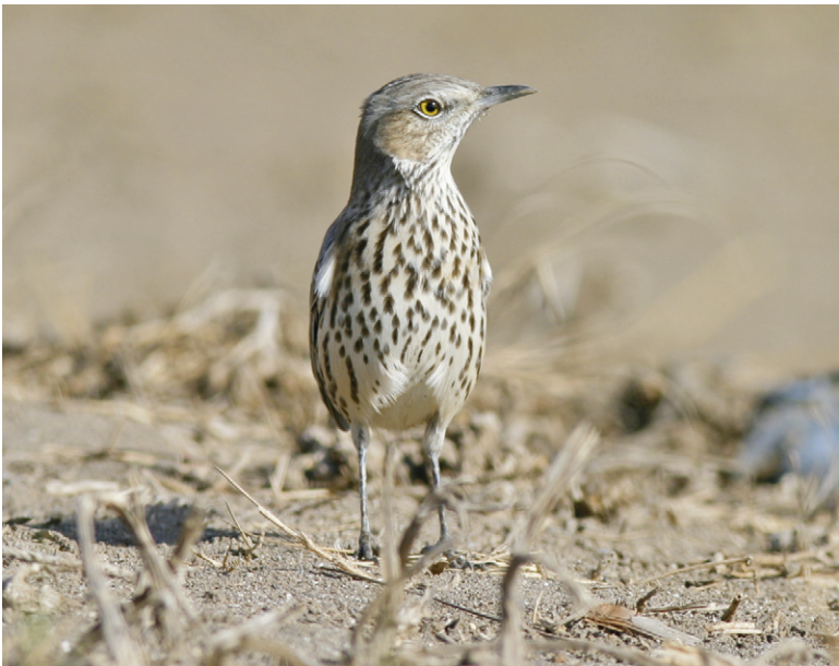
Figure 38. Sage Thrasher at Horse Beach 1 November 2003.