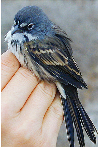
Figure 50. Adult Sage Sparrow, July 2000.