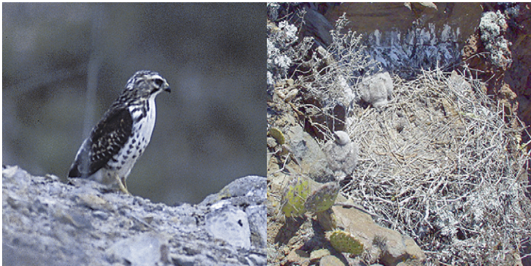
Figure 23. Immature Broad-winged Hawk at Lemon Tank 31 October 2001.