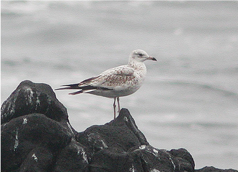
Figure 28. First-winter Ring-billed Gull at China Point 4 October 2003.