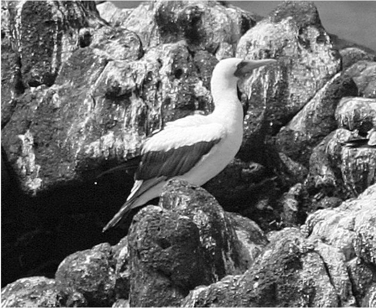
Figure 18. Adult Masked Booby on China Point 23 July 2004.