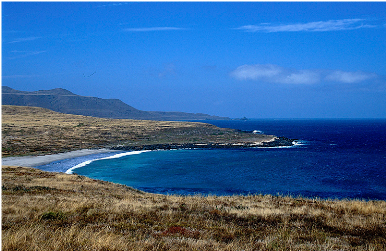
Figure 5. Horse Beach at San Clemente Island's southern tip, July 2001.