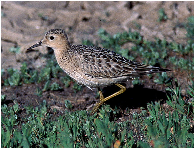
Figure 26. Juvenile Buff-breasted Sandpiper at Lemon Tank 19 September 2002.

Merlin ( Falco columbarius ). * Rare migrant and winter visitor. Recorded from 21 Sep to 16 Apr. First recorded 30 Mar 1915 (Howell 1917) and recorded only three times as of 1983 (Jorgensen and Ferguson 1984), the Merlin is now seen regularly during migration. Most records come from fall migration, peaking from mid October through November. There is a less noticeable peak during spring migration in March. All three North American subspecies have been recorded on SCI. The most common is nominate F. c. columbarius (75%), whereas F. c. suckleyi (25%) occurs