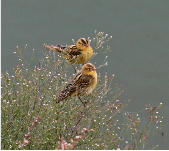
Figure 58. Bobolinks at Lemon Tank 19 September 2004.