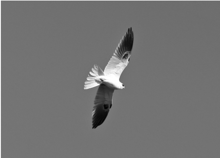
Figure 21. White-tailed Kite near San Clemente Island's single eucalyptus tree 26 November 2003.