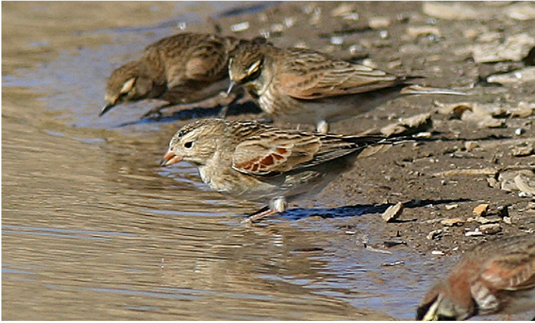
Figure 54. Male McCown's Longspur at Lemon Tank 23 November 2003.