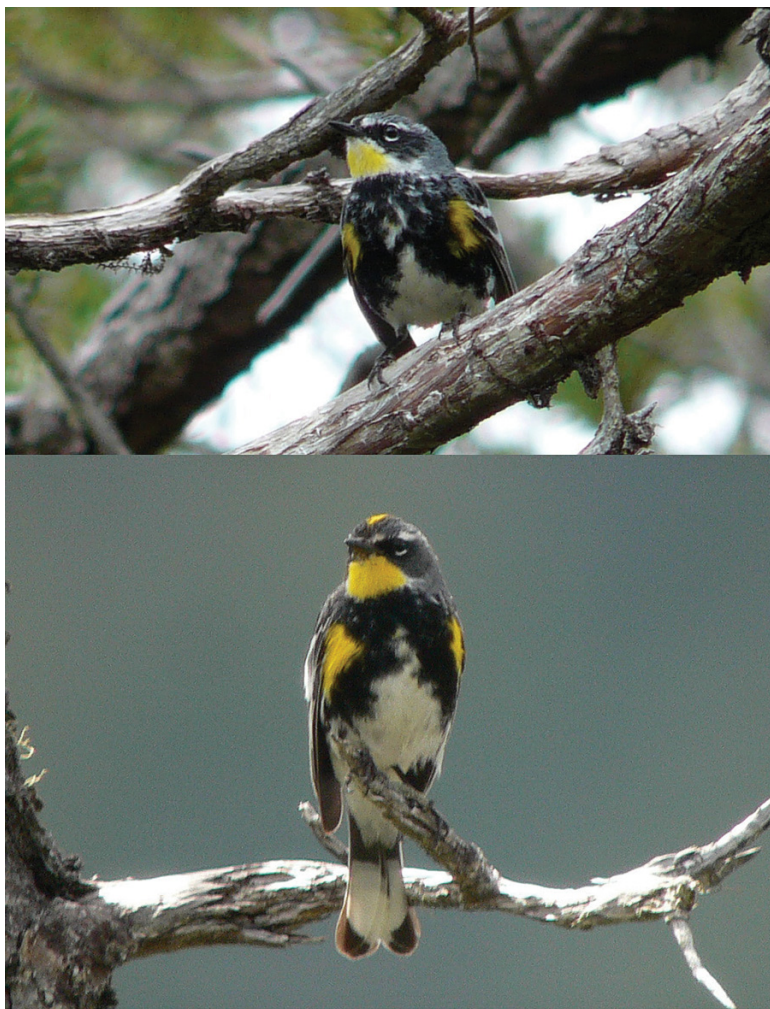
Figure 21. Most, if not all, Yellow-rumped Warblers that breed in muskeg habitat in the Ketchikan area are intergrades of the Myrtle Warbler ( Dendroica coronata hooveri ) and the Audubon's Warbler ( D. c. auduboni ). The top bird most closely resembles a Myrtle Warbler; however, most of its throat is lemon yellow. The bottom bird most closely resembles an Audubon's Warbler; however, it has white supraloral and supercilium markings, slaty auriculars, and white throat corners that extend slightly behind the auriculars. Gravina Island, 28 June 2008.