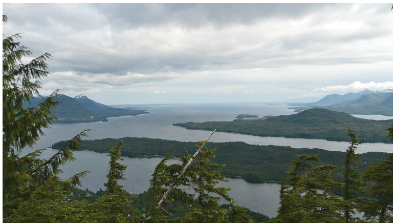
Figure 6. Gray skies, sheltered nearshore waters, and mountainous islands blanketed with dense coniferous forest characterize the Alexander Archipelago of southeast Alaska. View looking south down Nichols Passage on a typical summer day, with Annette Island on the left, Gravina Island on the right, and Pennock Island in the foreground.