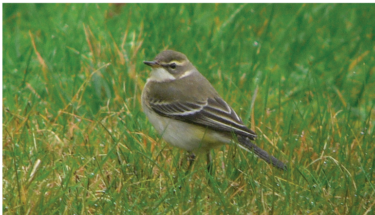
Figure 19. This immature Eastern Yellow Wagtail at Ketchikan 30 September 2007 represented only the second record for southeast Alaska.