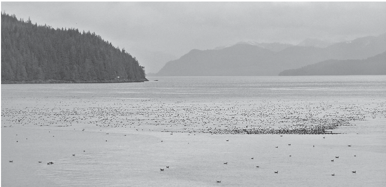
Figure 8. Part of an estimated 14,000 Surf Scoters at Clover Passage, near Ketchikan, gathered to take advantage of herring spawn deposited along the shorelines 27 April 2008. The sheltered waters of Clover Passage are also an important wintering site for loons, gulls, and alcids, particularly the Marbled Murrelet, which sometimes numbers in the thousands when feed is concentrated in the area.

Melanitta perspicillata . Surf Scoter. Common or abundant migrant and winter visitant, uncommon to fairly common summer visitant. The Surf Scoter is most abundant during spring migration, which begins in late March (e.g., 2000 along the Ketchikan road system 27 March 1997). Migration peaks from late April to early May, when flocks of up to 300 birds are frequently observed flying north over Tongass Narrows, at times in a nearly constant procession. High counts include 9200 in 6 hours on 27 April 2002, 8970 in 6 hours on 28 April 2001, 4000 in 1 hour on 24 April 2001, and 3450 in 2 hours on 4 May 1996. Large numbers congregate at herring spawning areas. On 2 May 1995, Heinl estimated a total of 60,000 at extensive herring spawn in lower west Behm Canal (10,000 at Smugglers Cove, 30,000 at Mike Point, and 20,000 at Tatoosh Rocks). Other large counts at herring spawning areas include up to 15,000 at Point Higgins from late April to early May 1996 and 23 April 1999, 14,000 at Clover Passage 27 April 2008 (Figure 8), and 10,000 at Mountain Point 27 April 2000. Recent, as yet unpublished, studies of the