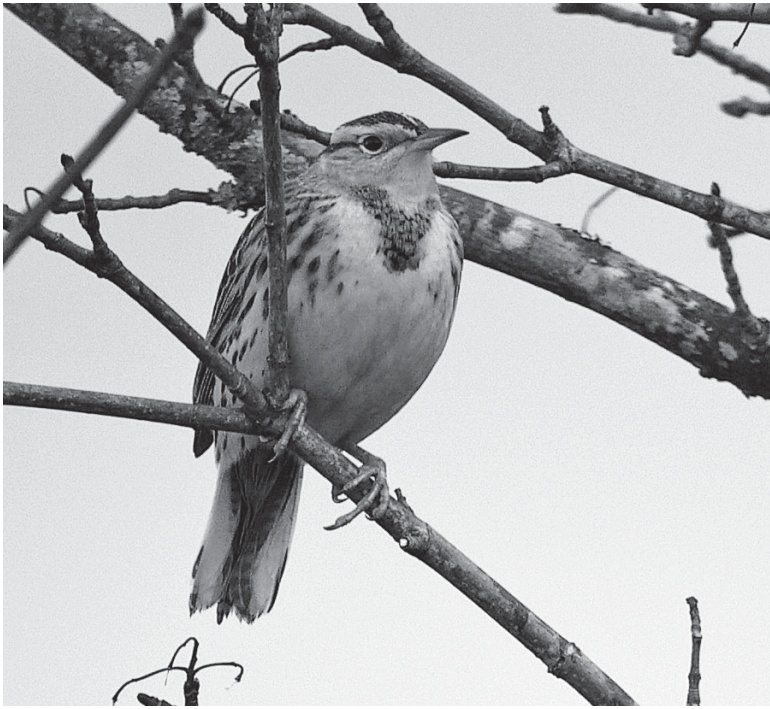
Figure 25. Western Meadowlark at Ketchikan 12 February 2006. This species is a casual fall and winter visitant to Alaska, and the Ketchikan area accounts for more than half the state records.