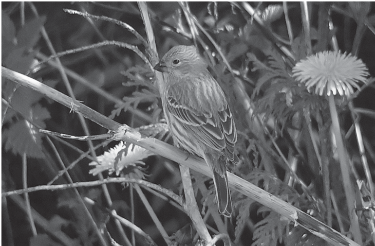
Figure 26. House Finch at Ketchikan 7 May 2005. This species has only recently been found in Alaska, and the Ketchikan area accounts for more than half the state records.

Carduelis pinus (pinus) . Pine Siskin. Common resident and breeder. This spe-