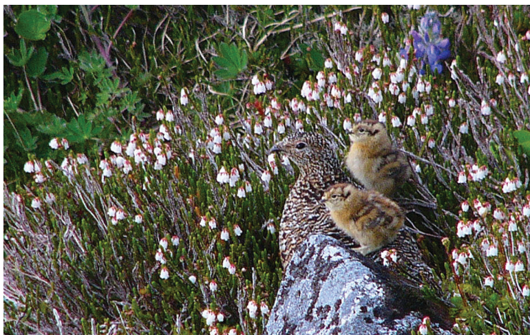
Figure 9. Prior to 2001, the Rock Ptarmigan was not known from the southern islands of the Alexander Archipelago. This female with downy chicks was found at 975 m elevation on Mahoney Mt., Revillagigedo Island, 26 June 2005.