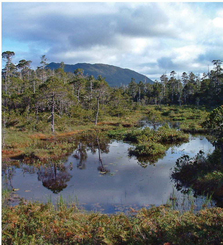
Figure 4. Muskeg or Sphagnum bog habitat at Gravina Island. The wet meadows and surrounding coniferous growth are the primary breeding habitat of the Greater Yellowlegs, Northern Flicker, Yellow-rumped Warbler, Lincoln's Sparrow, and Dark-eyed Junco.