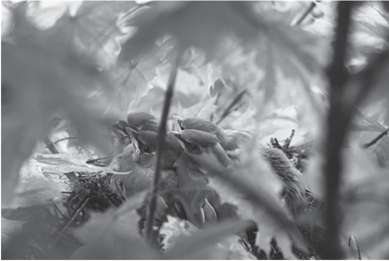
Figure 20. Cedar Waxwing nest in an ornamental maple at Ketchikan 15 August 2008; the five chicks fledged 20 August 2008.