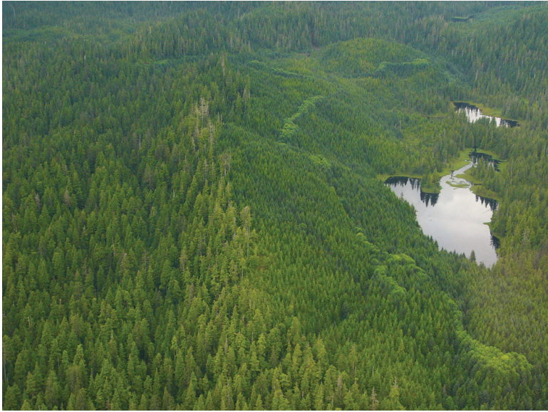
Figure 3. Coniferous forest, Carroll Inlet, Revillagigedo Island, July 2007. On the left is old-growth coniferous forest (hemlock, spruce, and cedar), on the right is a 20-year-old clearcut filled with coniferous second growth. Lines of paler red alder mark the old logging roads. The sedge meadow and Spiraea thickets at the far end of the small lake are excellent habitat for the Song and Lincoln's sparrows and Common Yellowthroat.