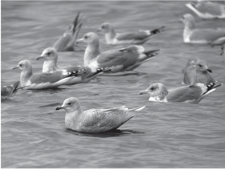
Figure 17. First-winter Kumlien's-type gull ( Larus glaucooides kumlieni ), with Thayer's ( L. g. thayeri ), Mew, and Glaucous-winged gulls at Ketchikan 16 February 2007. In addition to its small size, round head shape, and short, slender bill in comparison to the adjacent Thayer's Gulls', this bird had completely barred rectrices (not visible) and tertials, and dark pigmentation in its outer primaries was limited to subterminal markings.