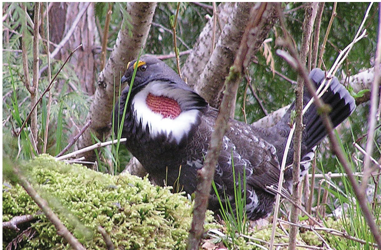
Figure 10. Displaying male Sooty Grouse ( Dendragapus fuliginosus sitkensis ) at Gravina Island 17 April 2004. Like all Sooty Grouse in the Ketchikan area, this bird gave six to eight very loud call notes characteristic of this species; however, it exhibited the reddish apteria of the interior species, the Dusky Grouse ( D. obscurus ), rather than yellow apteria typical of the coastal Sooty Grouse.