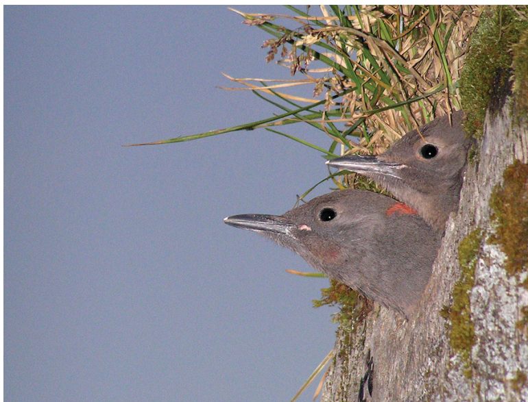
Figure 18. Juvenile Red-shafted Flickers ( C. a. cafer ) at a nest hole in a piling near Ketchikan 11 July 2007. The bottom bird features both a red moustachial stripe and a red nuchal patch, while the top bird has a buff-colored throat, characteristics of intergradation with the Yellow-shafted Flicker ( C. a. luteus ) common to flickers in the Ketchikan area at all seasons.