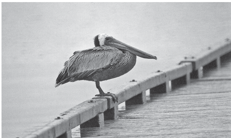
Figure 11. Adult Brown Pelican at Ketchikan 25 May 2003; this species has only recently been reported in Alaska.