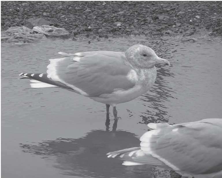
Figure 16. Pure Herring Gulls are very rare during the winter in the Ketchikan area, and most Herring-type birds exhibit signs of hybridization with the Glaucous-winged Gull. This adult at Ketchikan 5 March 2007 was most similar to a Glaucous-winged Gull (large size, heavy bill, dark eye, and pink eye ring) but had extensively slate-gray outer primaries.