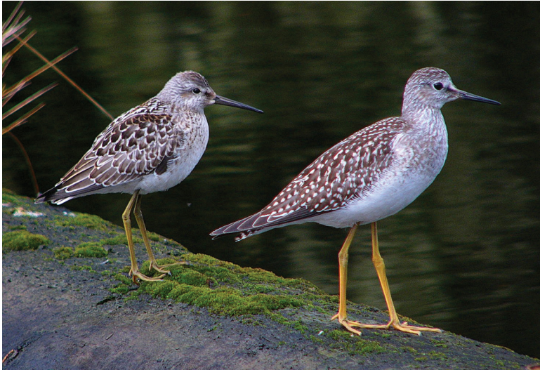
Figure 15. Juvenile Stilt Sandpiper and juvenile Lesser Yellowlegs at Traitors Creek, Revillagigedo Island, 22 August 2005. The Stilt Sandpiper is casual in southeast Alaska, and this bird provided the first record for the Ketchikan area.

Larus hyperboreus barrovianus . Glaucous Gull. Rare migrant and winter visitant.