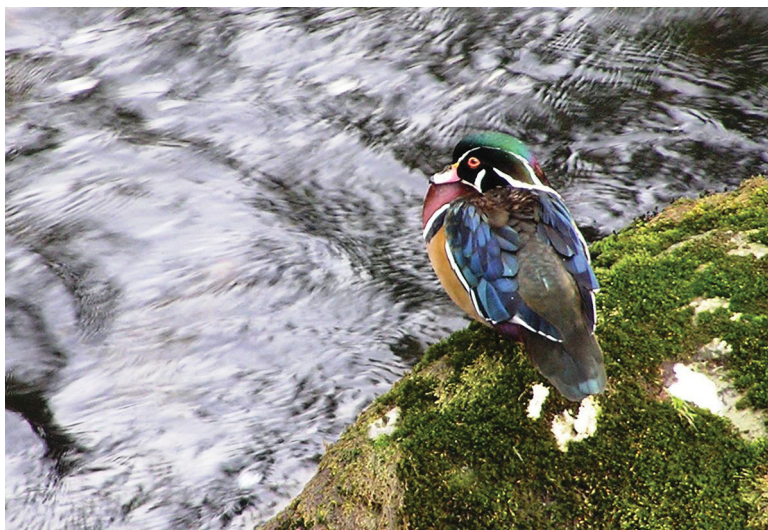
Figure 7. Drake Wood Duck at Ketchikan Creek 11 December 2006. This species is casual in Alaska but has occurred with increasing frequency and at all seasons over the past decade.