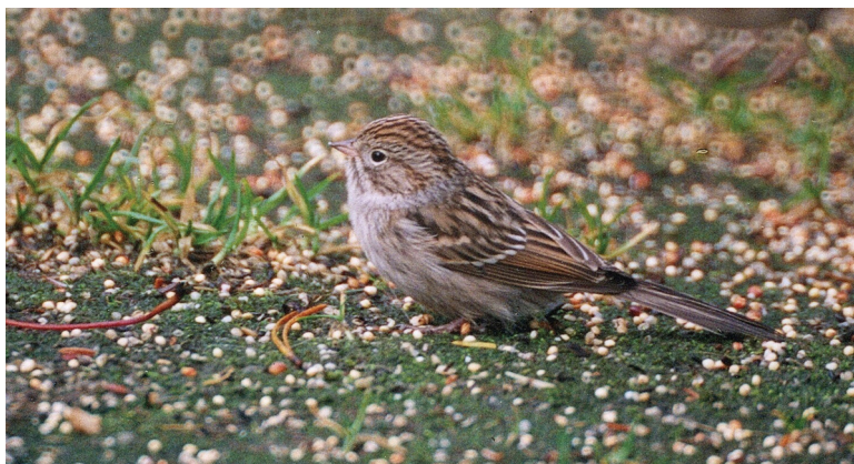
Figure 22. Brewer's Sparrow at a Ketchikan feeder 25 October 2001. The relatively coarse dorsal streaking, pale nape, fairly distinct supercilium, and distinct pale median crown stripe suggest the race S. b. taverneri , which breeds very locally at the eastern edge of the Alaska interior and is the only subspecies of Brewer's Sparrow to have been documented in Alaska by specimen (see Doyle 1997).