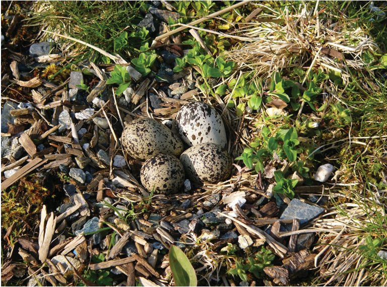
Figure 12. Nest and eggs of the Killdeer at Ketchikan 2 May 2006. This species is a locally uncommon breeder in southeast Alaska.