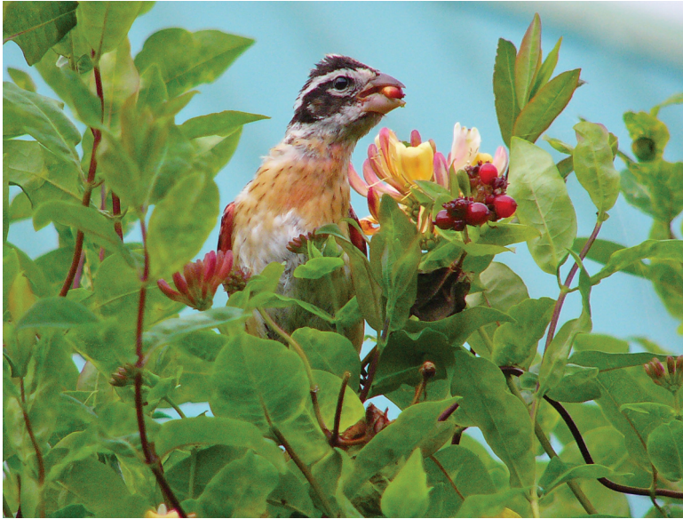
Figure 24. This hatching-year male Rose-breasted Grosbeak at Ketchikan was one of three present 3–18 October 2005 (shown here 4 October 2005); there were only five prior Alaska records.