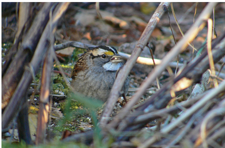
Figure 23. The White-throated Sparrow is a rare fall migrant and winter visitant to the Ketchikan area, and typically multiple birds are found each year. This adult was at a Ketchikan feeder 23 November 2006.