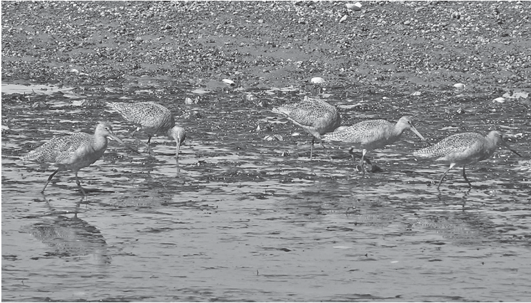
Figure 14. Part of a flock of 23 Marbled Godwits at Annette Island 24 April 2004. Marbled Godwits migrating through southeast Alaska are presumably from the small Alaska Peninsula breeding population ( L. f. beringiae ) that winters from western Washington to central California. Much like the Brant, this race migrates to and from the breeding grounds primarily via a trans-Gulf of Alaska flight, but it is found in small numbers along the south coast of Alaska during the spring migration.