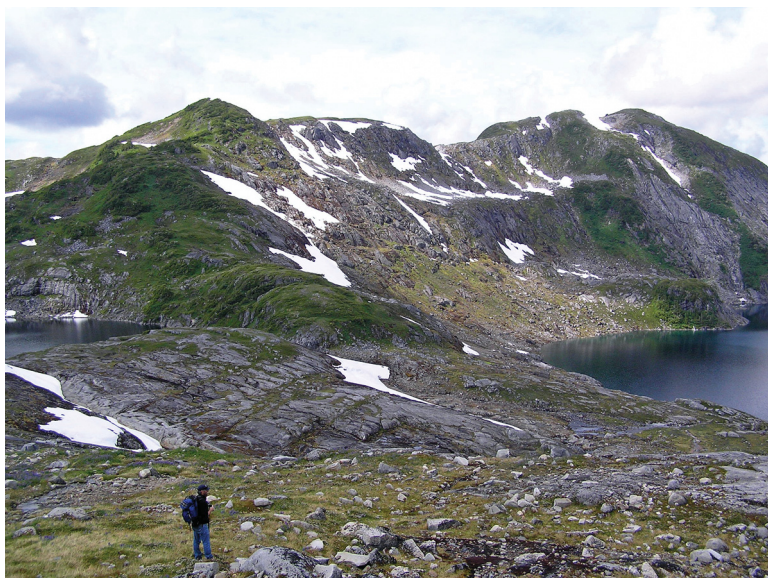
Figure 5. Extensive alpine habitats support breeding Rock and Willow ptarmigan, American Pipit, and possibly Gray-crowned Rosy-Finch (975 m, Mahoney Mt., Revillagigedo, June 2005).