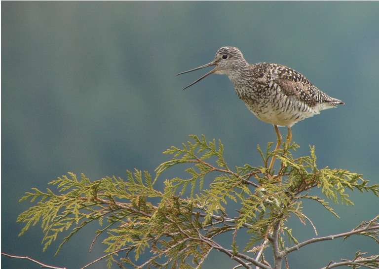
Figure 13. Greater Yellowlegs in muskeg habitat at Gravina Island 24 June 2007. This bird was highly agitated and likely had chicks nearby.