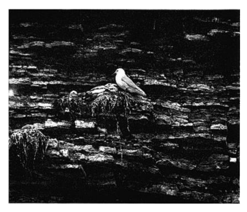
Figure 2. Kittiwake nests at Gullcliff Bay.

June 7—West Point to Cap de Rabast: a flock of 130 and a flock of 80.